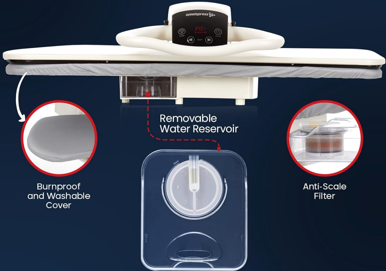
Image 2: Diagram showing the removable water reservoir, anti-scale filter, and burnproof cover.