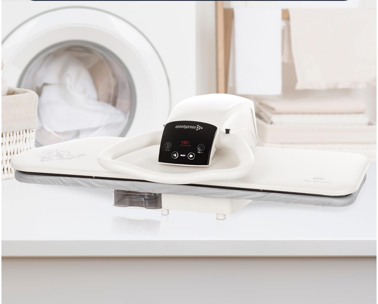
Image 1: The SpeedyPress 100HD Steam Press, showcasing its large ironing surface and control panel.

- The Professional Solution to Endless Ironing -