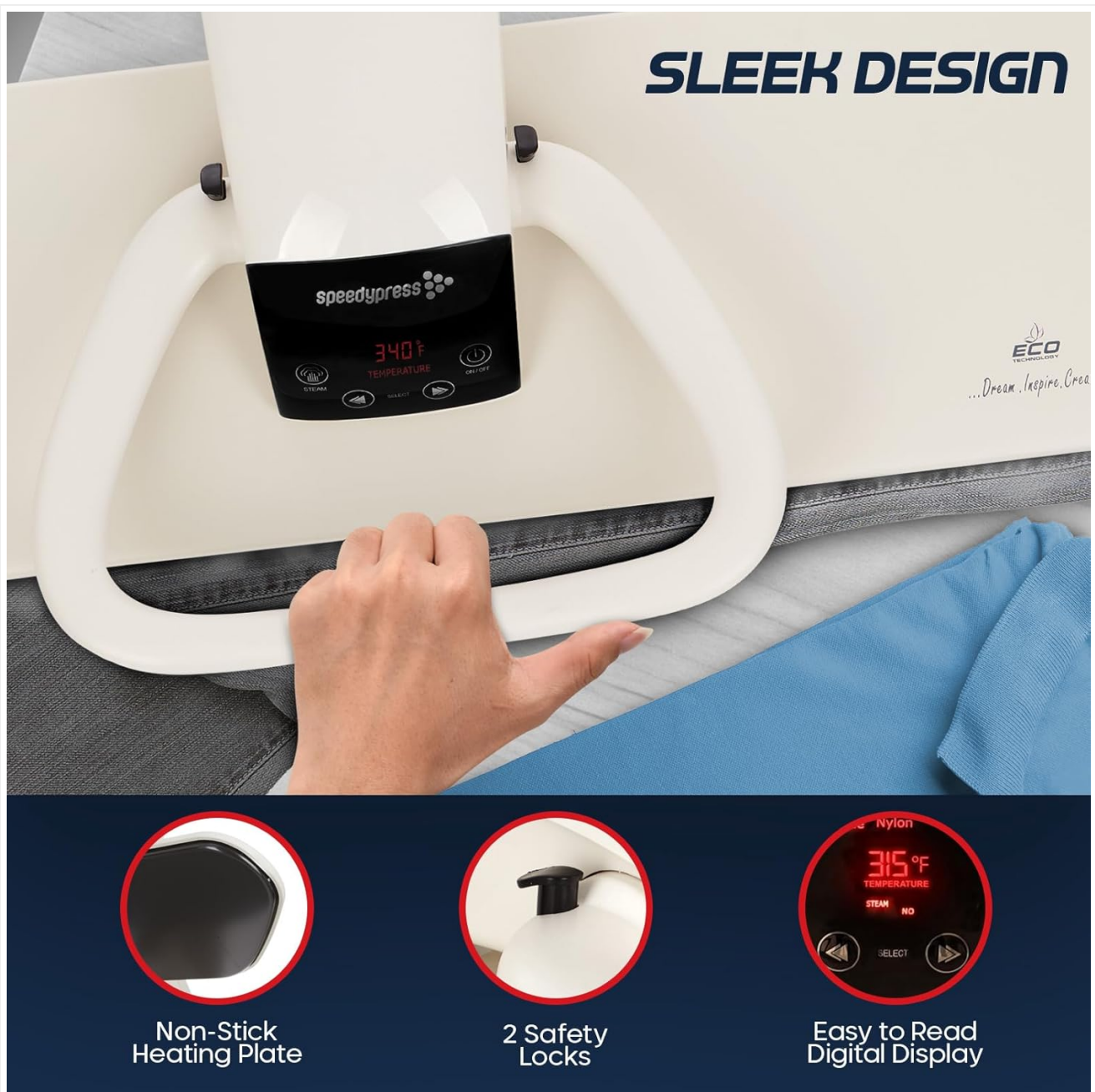
Image 3: Close-up of the digital display, non-stick heating plate, and safety locks.