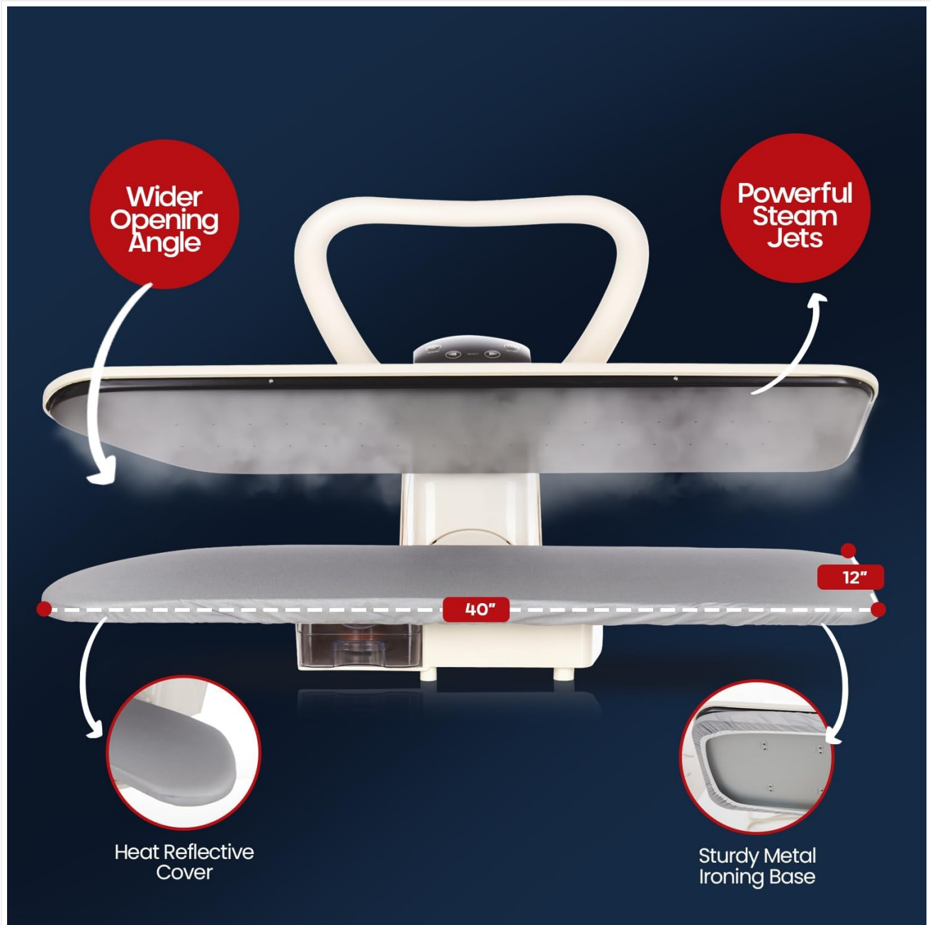
Image 5: Illustrates the wide opening angle and powerful steam jets for effective ironing.