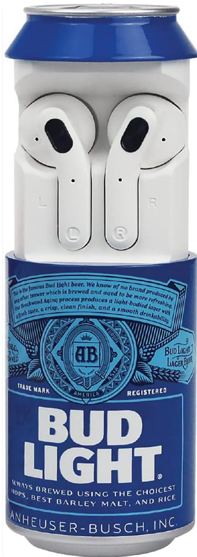
Image 2.1: The Bud Light Wireless Earbuds and their charging case.