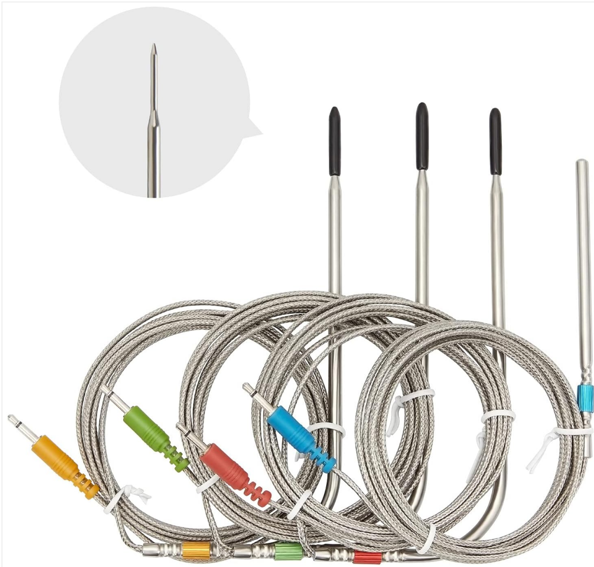
Image: A set of four Inkbird replacement probes, featuring braided metal cables and colored connectors (red, yellow, green for meat, blue for ambient).