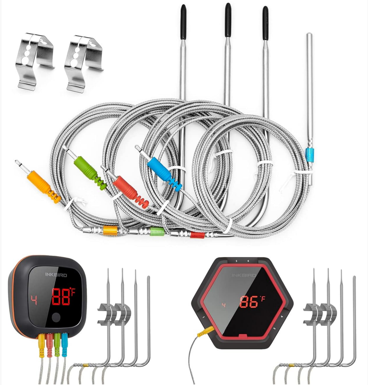
Image: Inkbird colored probes with braided cables, connected to an Inkbird thermometer unit, illustrating proper connection.