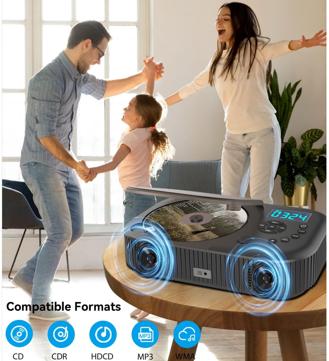
Image: MONODEAL MD318 with remote control for convenient use.