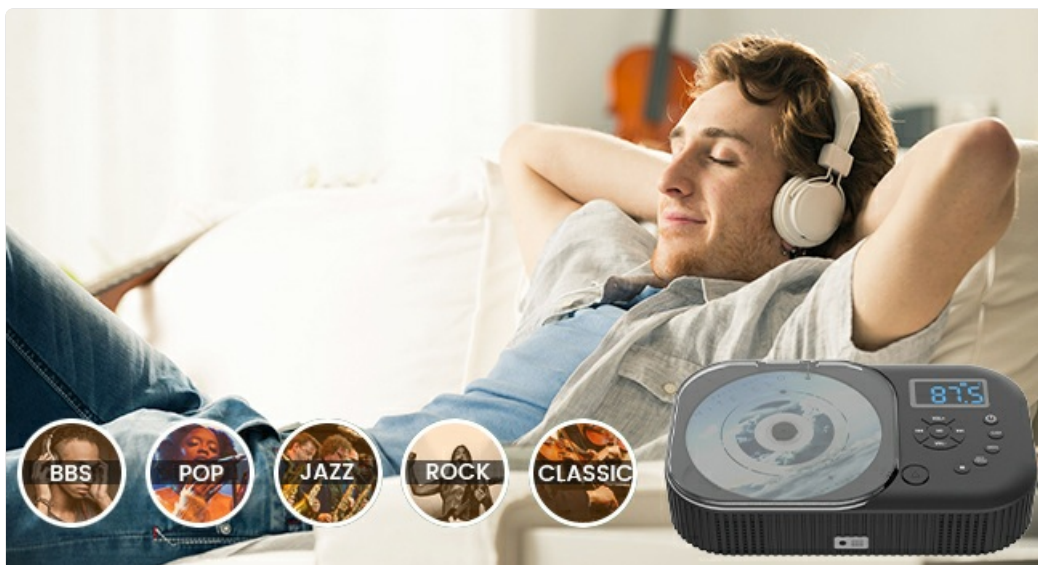
Image: Anti-Skip Protection for continuous playback in motion.

The MD318 features an enhanced anti-skip protection system to prevent interruptions during CD playback, even when the device experiences minor shocks or vibrations. This makes it suitable for use in various environments, including cars or while carrying.