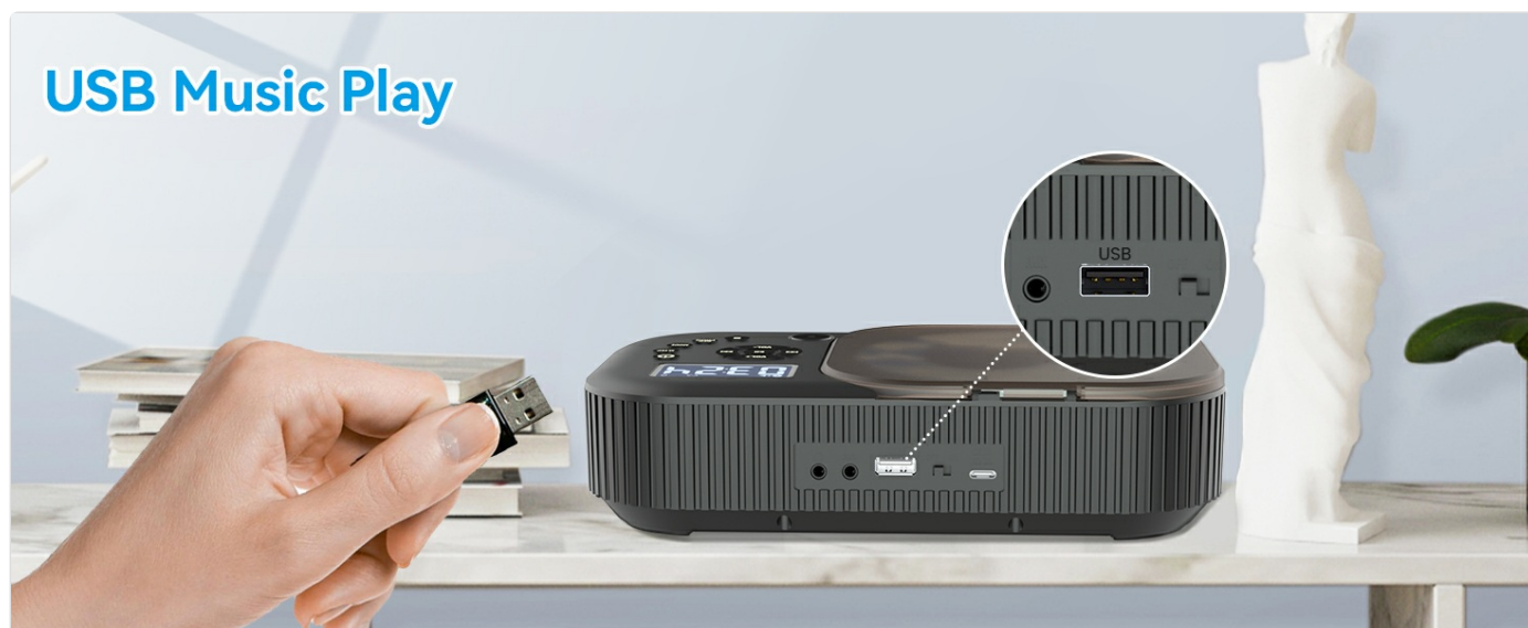
Image: Programming a playlist on the MD318 CD player.