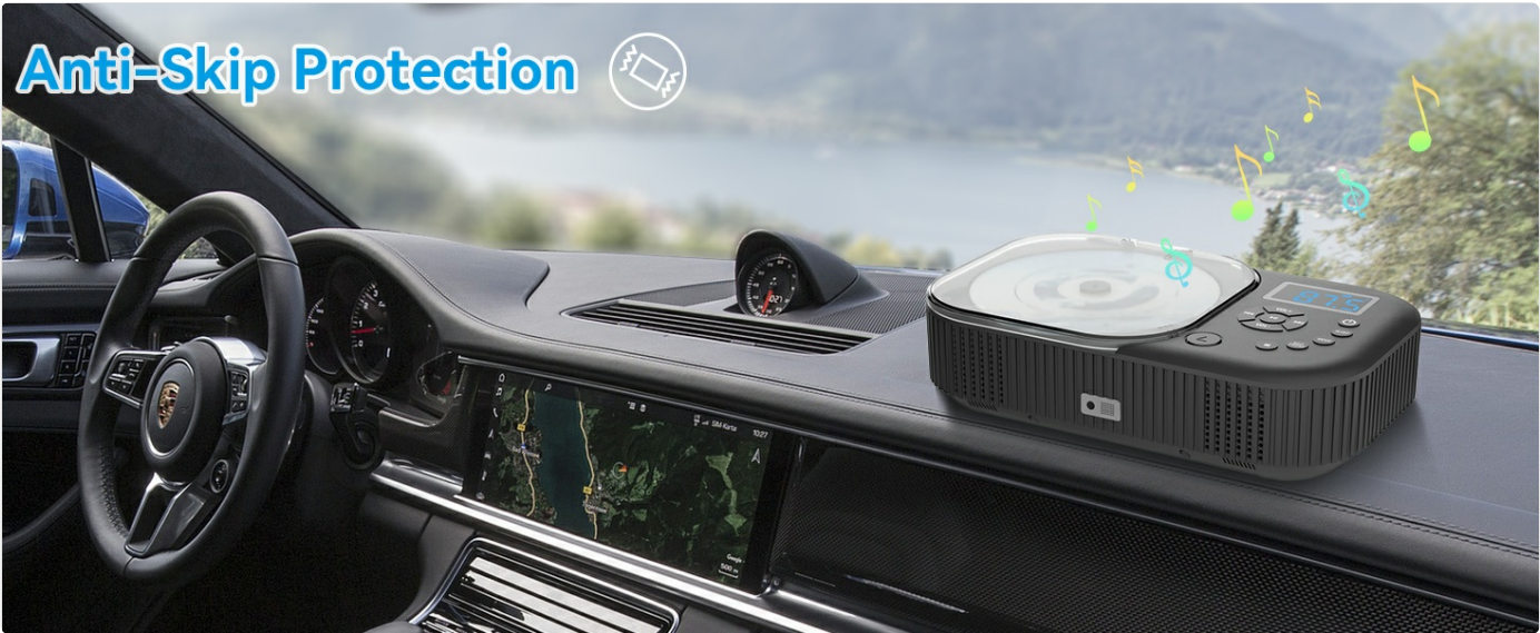
Image: The MONODEAL MD318 enhances daily life with music.

For any questions, issues, or support needs regarding your MONODEAL MD318 Portable CD Player, please contact our customer support team. We offer lifetime support to ensure your satisfaction. Please refer to the contact information provided on our official website or the product packaging for the most up-to-date support channels.