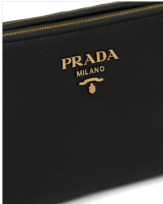
Figure 2: Detailed view of the gold-tone Prada Milano logo on the front of the bag, highlighting the hardware finish.