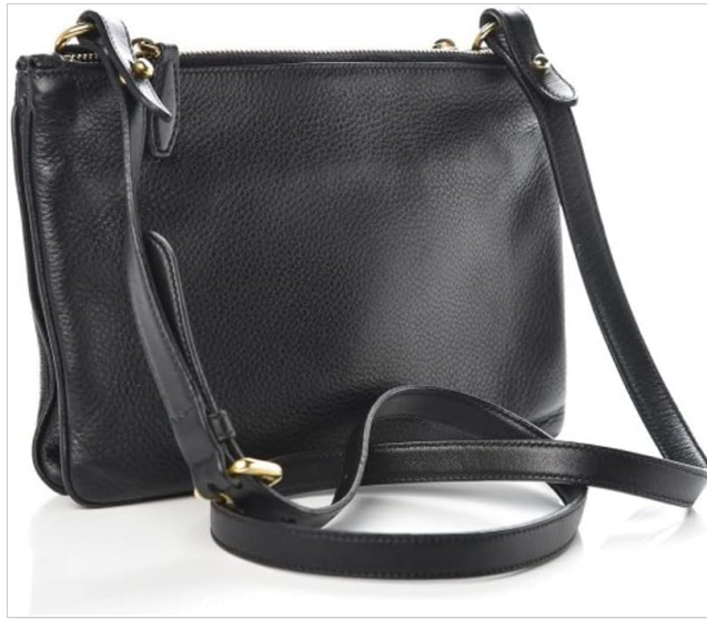
Figure 3: Rear view of the bag, illustrating the attachment points for the adjustable and detachable crossbody strap.