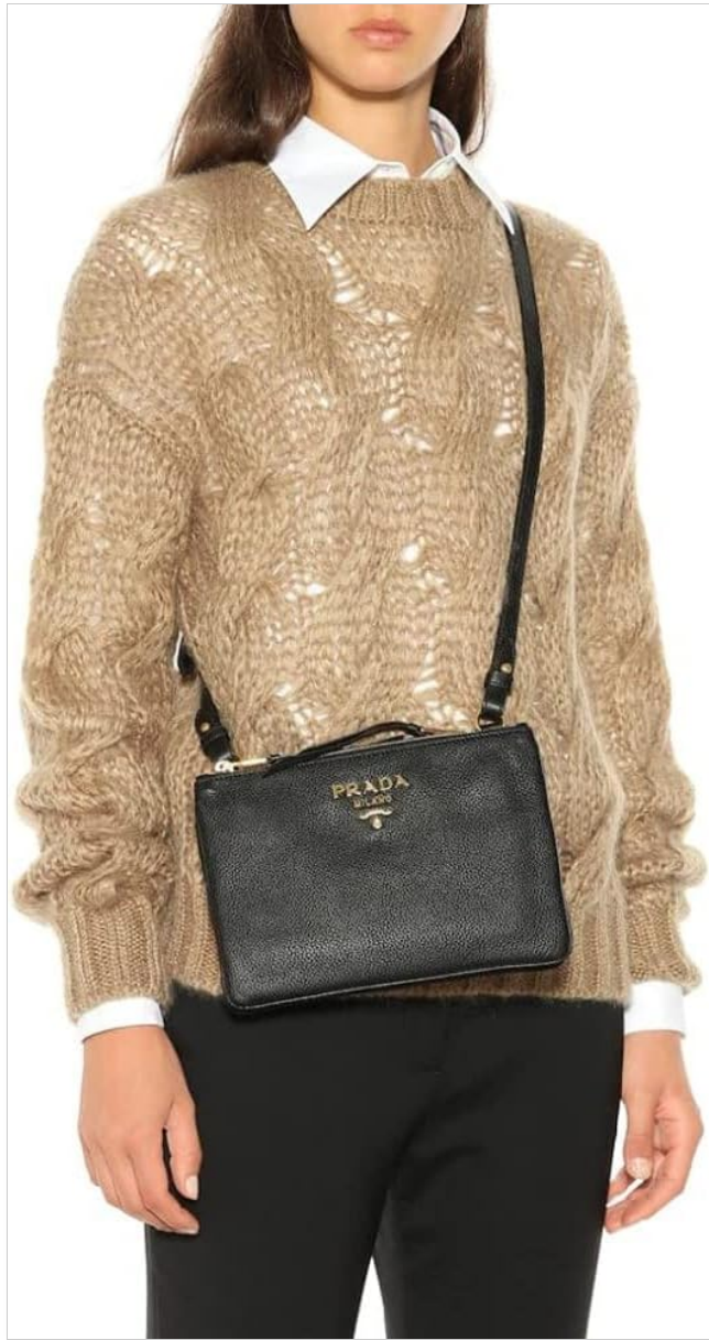
Figure 5: The Prada Vitello Phenix bag styled as a crossbody, demonstrating its practical wearability.