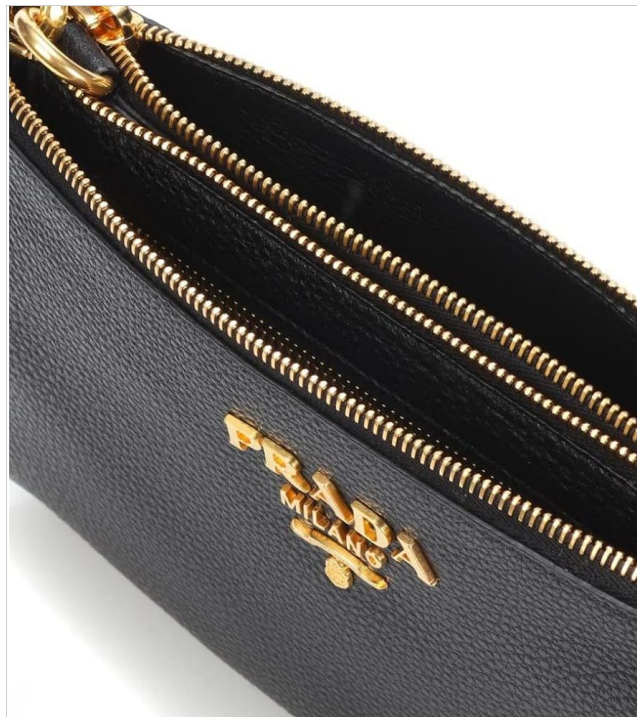
Figure 4: Interior view displaying the two main zippered compartments and the internal zip pocket for organization.