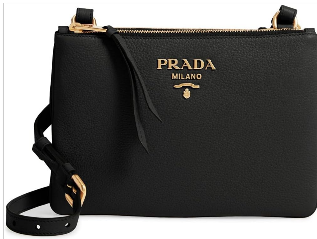
Figure 1: Front view of the Prada Vitello Phenix Leather Crossbody Bag, Model 1BH046, showcasing its textured black leather and gold Prada logo.

This manual provides essential information for the proper use and care of your Prada Vitello Phenix Leather Crossbody Bag, Model 1BH046. Crafted from durable Vitello Phenix leather with gold-tone hardware, this bag is designed for everyday elegance and functionality. Please read these instructions carefully to ensure the longevity and optimal condition of your product.