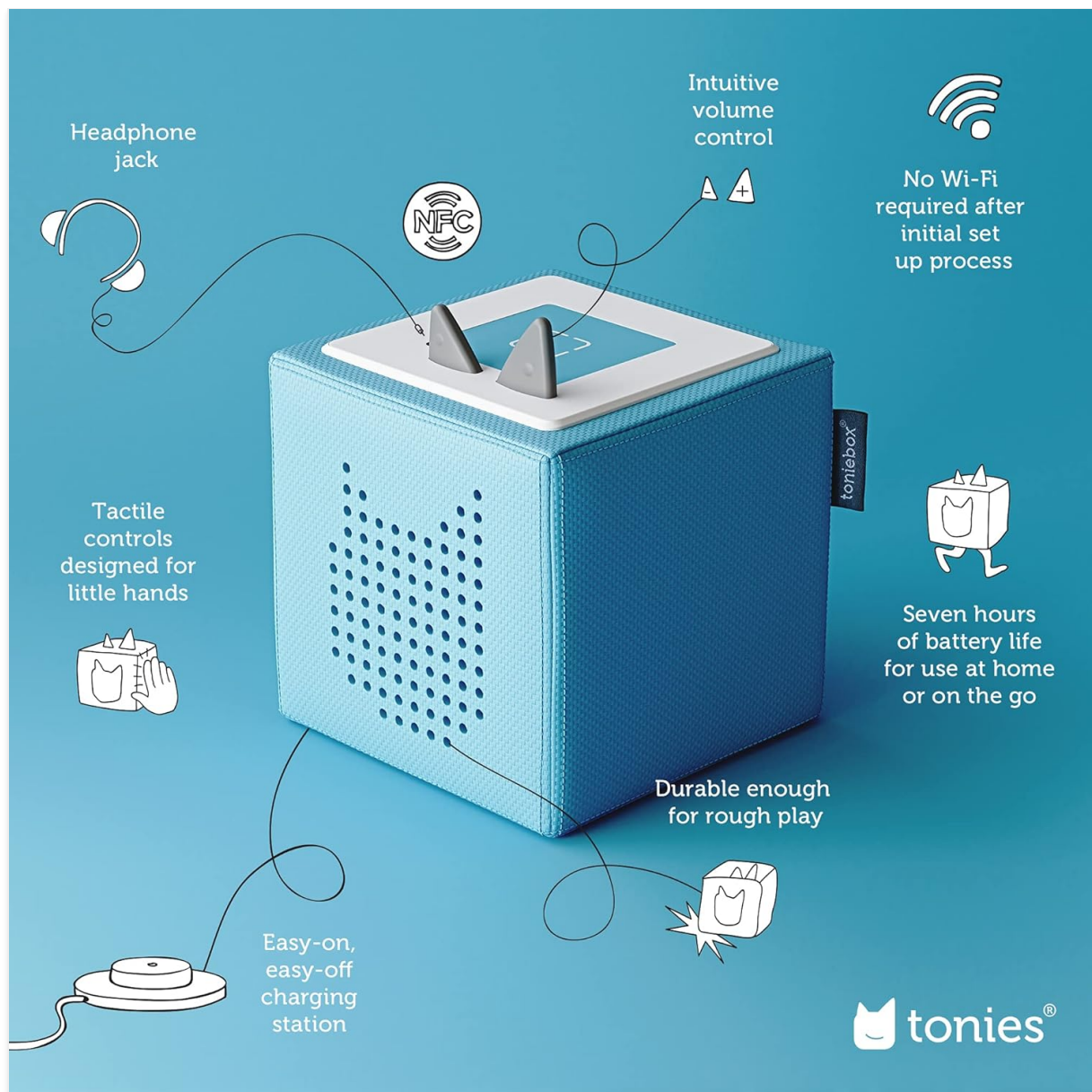
Figure 2: Simple steps for getting storytime started with the Toniebox.