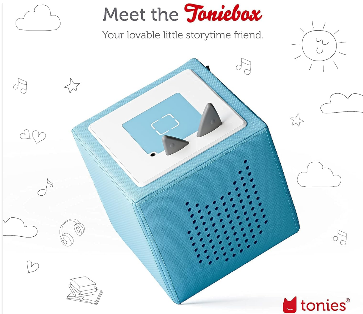
Figure 3: Key features and controls of the Toniebox.