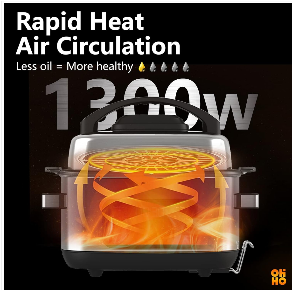
Image: Front view of the ohho 6L Air Fryer and Multicooker, highlighting the digital touch control panel with various function buttons and a display for time and temperature.

The ohho 6L Air Fryer and Multicooker features a touch control panel for easy operation across various cooking modes.