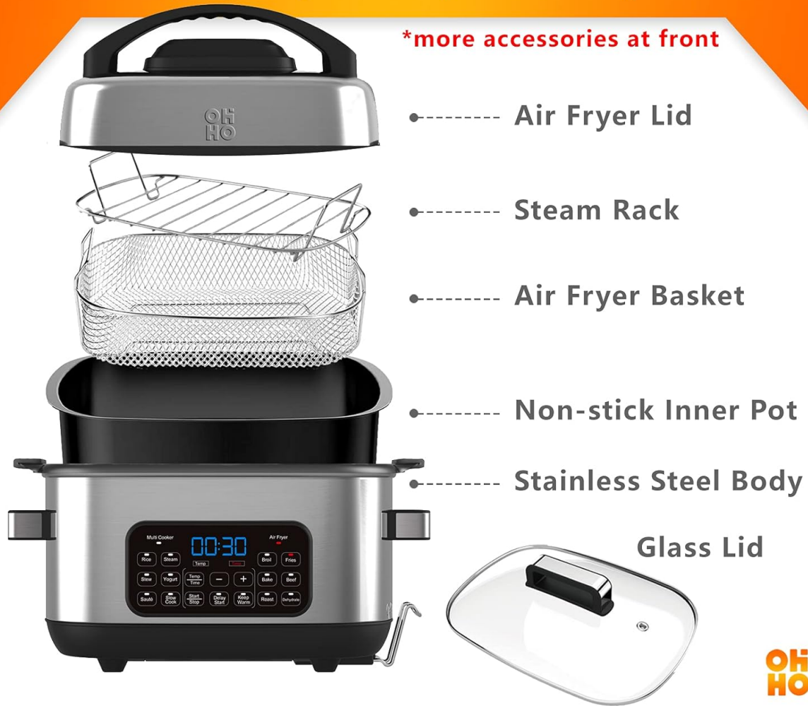
Image: Exploded view showing the various components of the ohho 6L Air Fryer and Multicooker, including the air fryer lid, steam rack, air fryer basket, non-stick inner pot, stainless steel body, and glass lid.