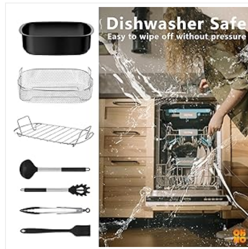
Image: A visual demonstrating that the removable components of the ohho 6L Air Fryer and Multicooker, such as the inner pot and air fryer basket, are dishwasher safe for easy cleaning.