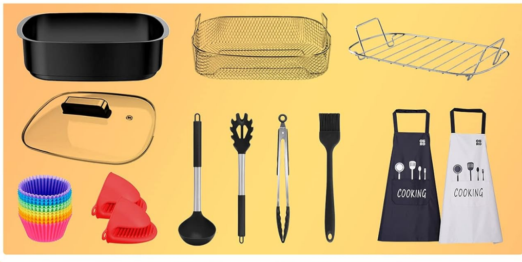
Image: The ohho 6L Air Fryer and Multicooker displayed with its various accessories, including the inner pot, air fryer basket, steam rack, glass lid, and several cooking utensils.