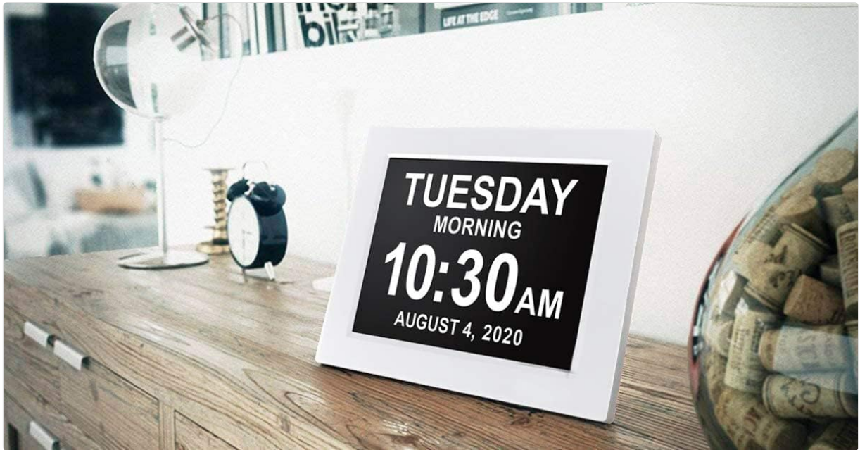
Figure 5: Product dimensions for the 8-inch Digital Day Clock.