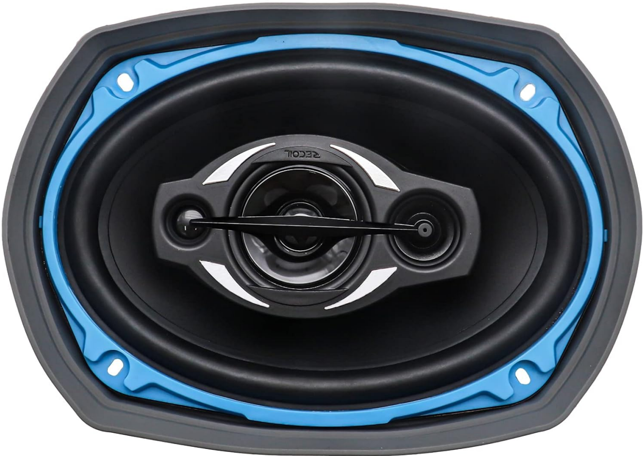
Figure 7: Installed Speaker with RECOIL Baffle (US Patent 10,582,296)