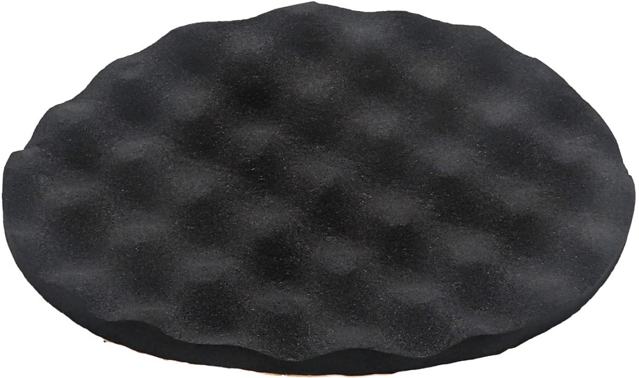
Figure 5: Egg Crate Foam for Sound Improvement

The egg wave foam behind speaker improves sound by preventing sound wave bounced back.