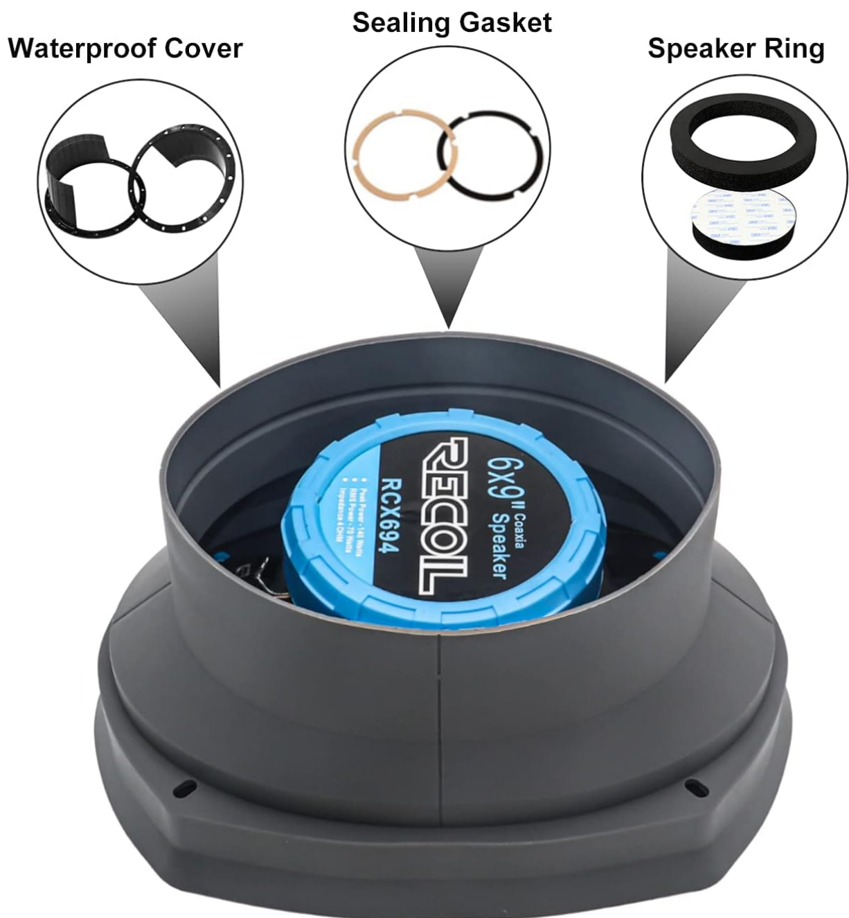
Figure 2: 3-in-1 Speaker Installation Solution Concept