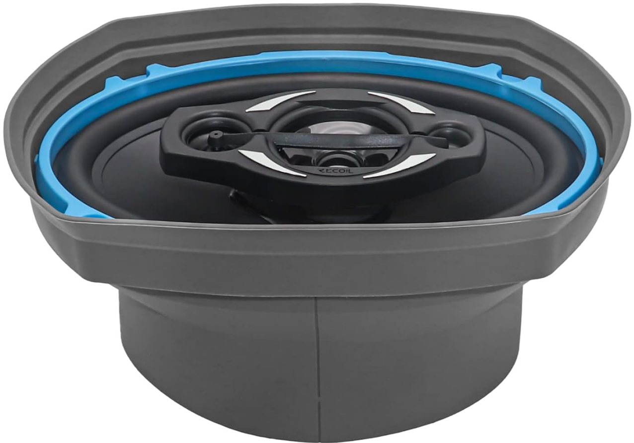
Figure 3: Silicone Baffle Sealing

Silicone material is durable for harsh environment. Silicone material is soft to seal between speaker and door panel.