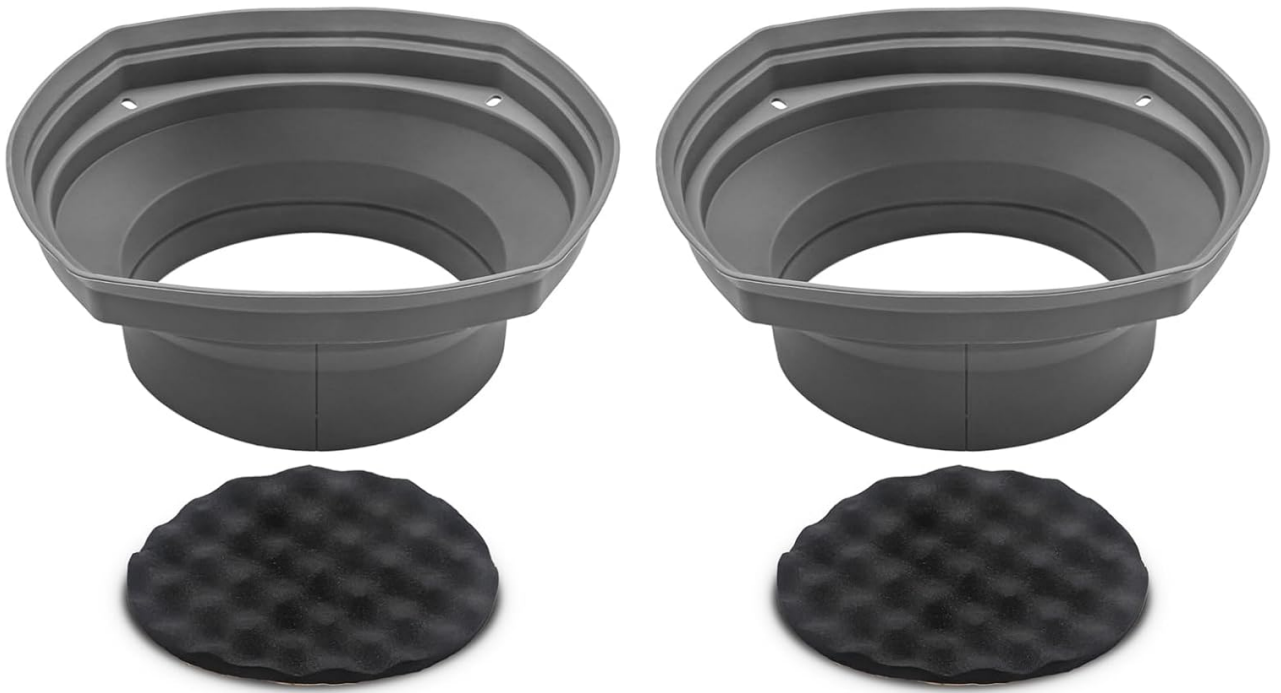
Figure 1: RECOIL SPB69 Speaker Baffle Kit Components