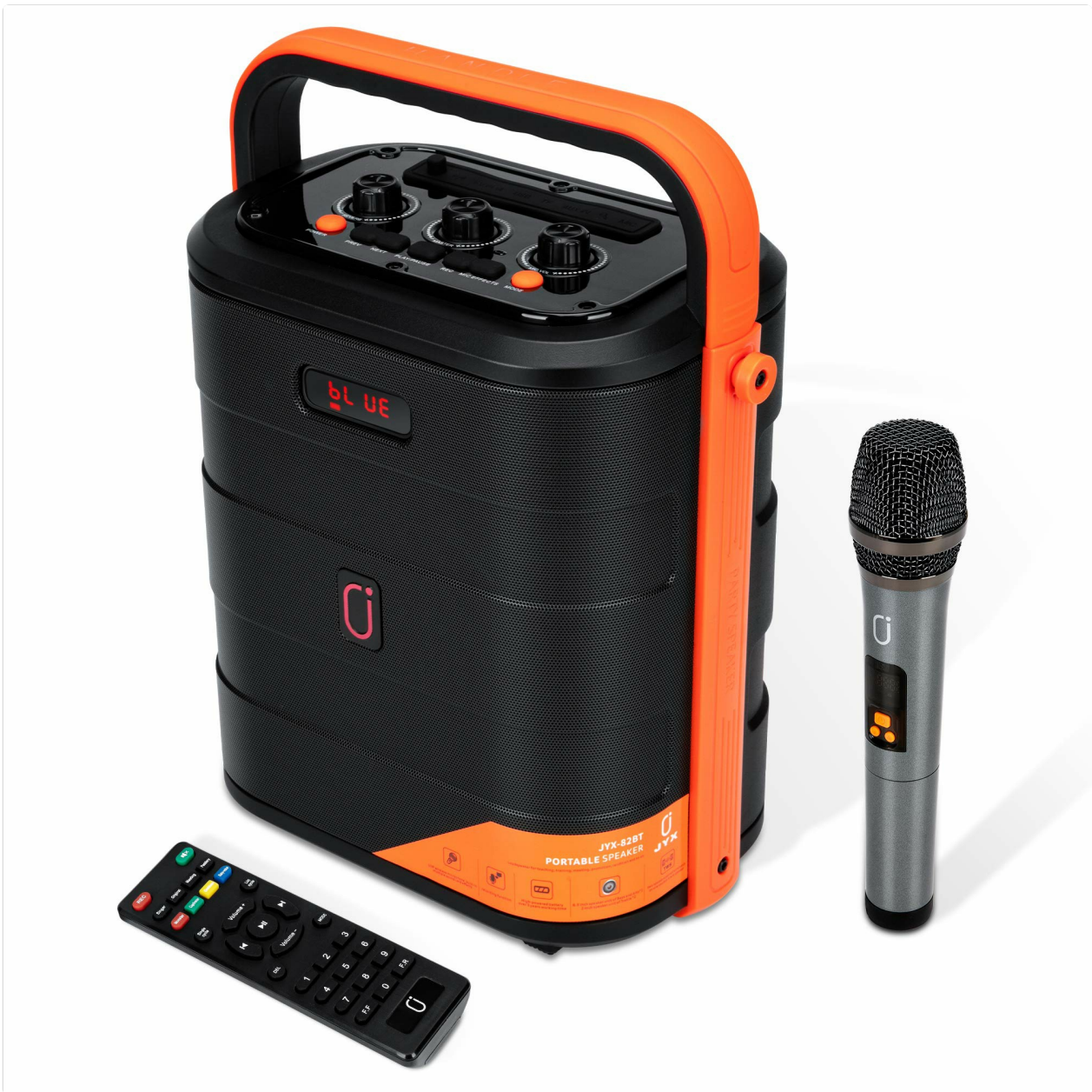
Figure 1: JYX Karaoke Machine JYX-82

The JYX-82 is a portable PA system designed for karaoke, music playback, and public address. It features Bluetooth 5.0 connectivity, TWS (True Wireless Stereo) function, FM radio, recording capabilities, and supports various input methods including USB, TF card, and Aux-in. It comes with two UHF wireless microphones for enhanced vocal performance.