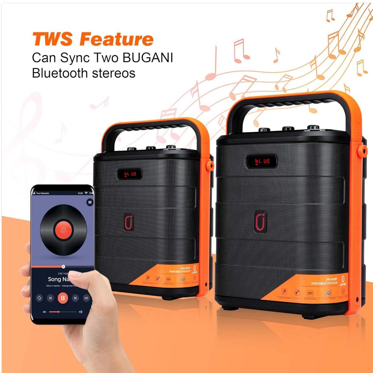
Figure 5: TWS Connection