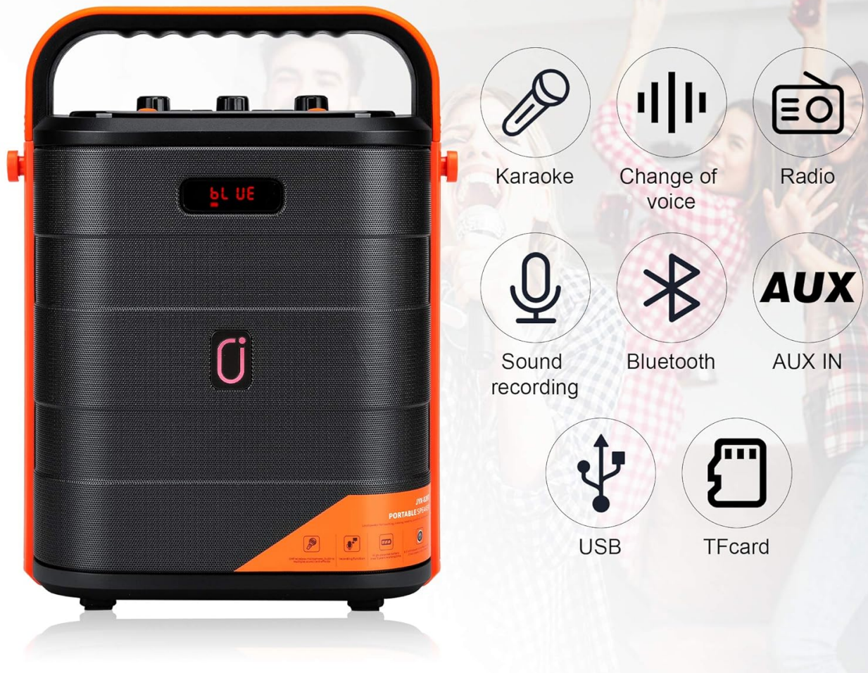
Figure 3: Feature Overview

Karaoke/Radio/Recording/Bluetooth/TWS/USB/TFcard/ Aux in/Cycle charging