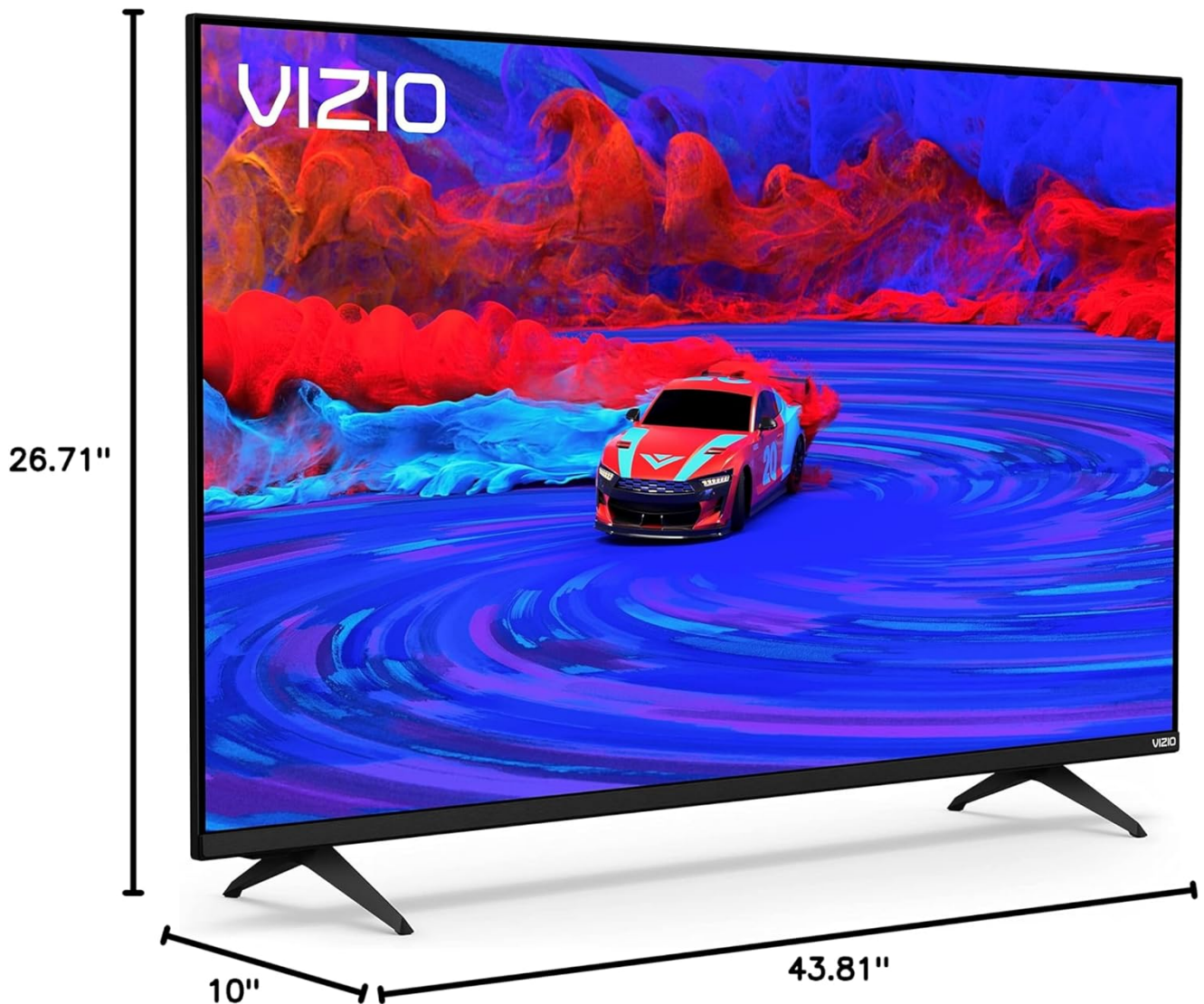
Image showing the VIZIO 50-Inch M-Series Smart TV with its stands attached, along with its dimensions.

If not wall-mounting, attach the included stands to the bottom of the TV. Refer to the quick start guide for specific screw placement and tightening instructions. Ensure the TV is stable before proceeding.