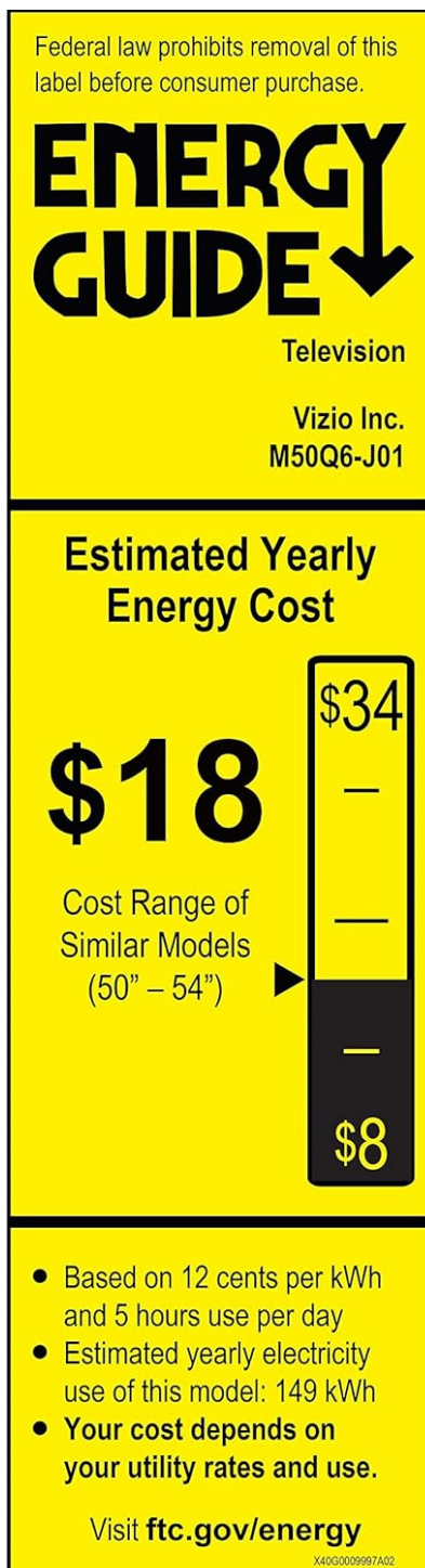
Energy Guide label for the VIZIO M50Q6-J01 TV, showing estimated yearly energy cost and electricity use.