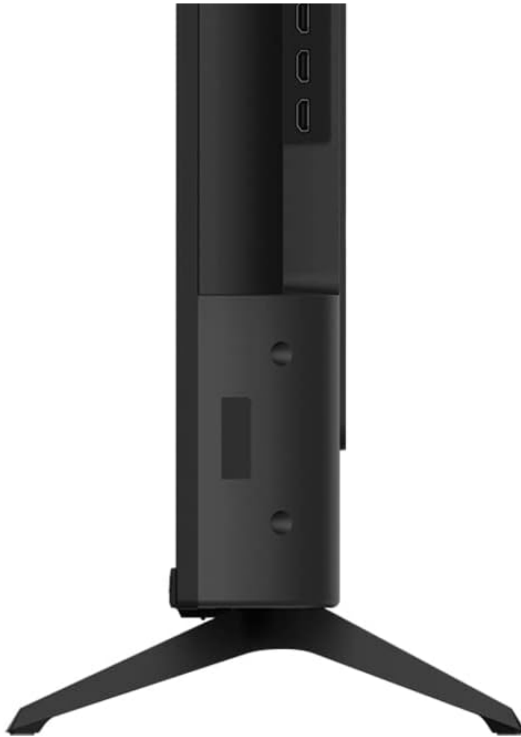
Side profile of the VIZIO M-Series TV highlighting the accessible HDMI and USB 2.0 ports.