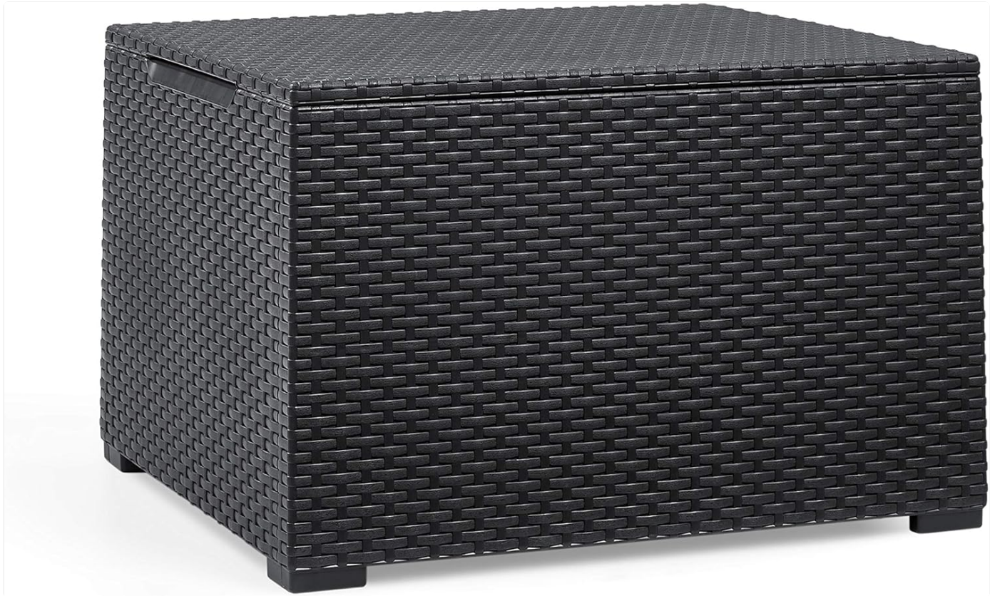
Figure 3: Detail of the durable, weather-resistant resin material with a woven rattan-style texture.