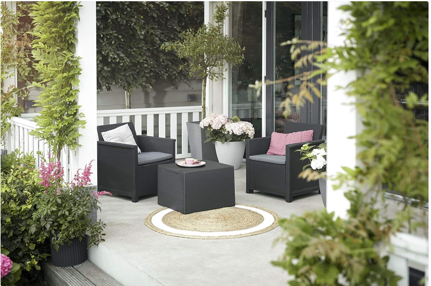
Figure 1: Assembled Keter Emma Corfu Coffee Storage Table. This image shows the complete table with its woven texture and overall design.