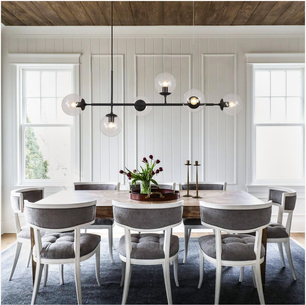
Figure 9.5: Enhancing a formal dining room setting.