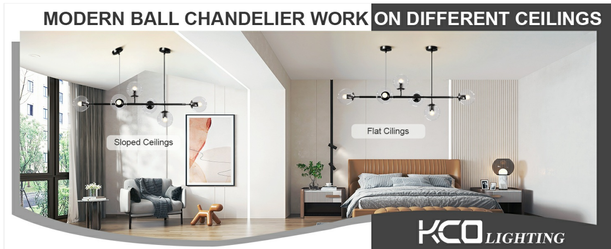
Figure 3.3: The chandelier is designed to work effectively on various ceiling types, including sloped and flat surfaces.