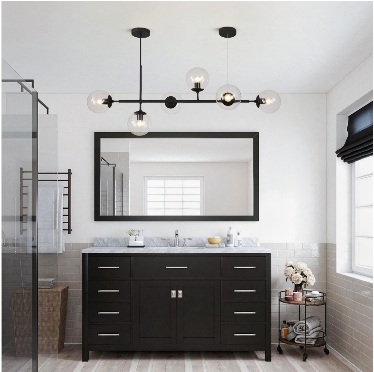
Figure 9.6: Providing sophisticated lighting in a bathroom.