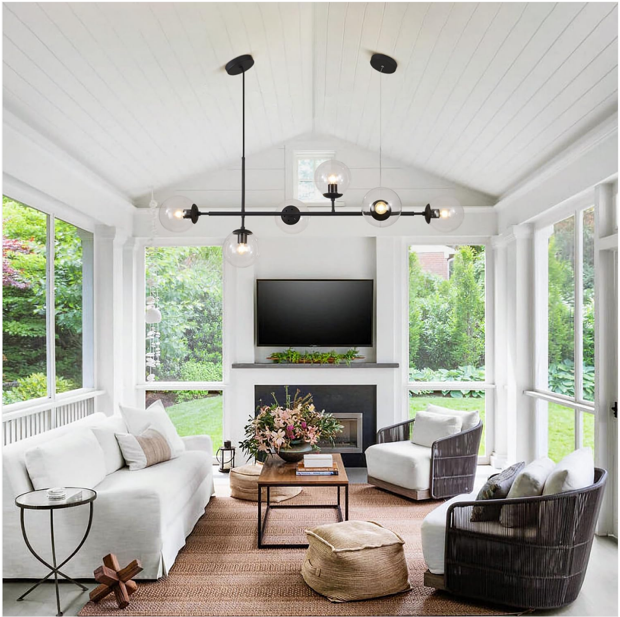
Figure 9.1: Chandelier enhancing a spacious living room.