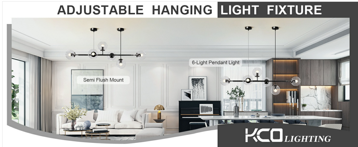
Figure 3.2: The adjustable hanging feature allows customization of the fixture's height to best suit your space.

Video 3.1: An official KCO Lighting video demonstrating the installation process for the 6-Light Globe Pendant Lamp. This video provides a visual guide to help with assembly and mounting.