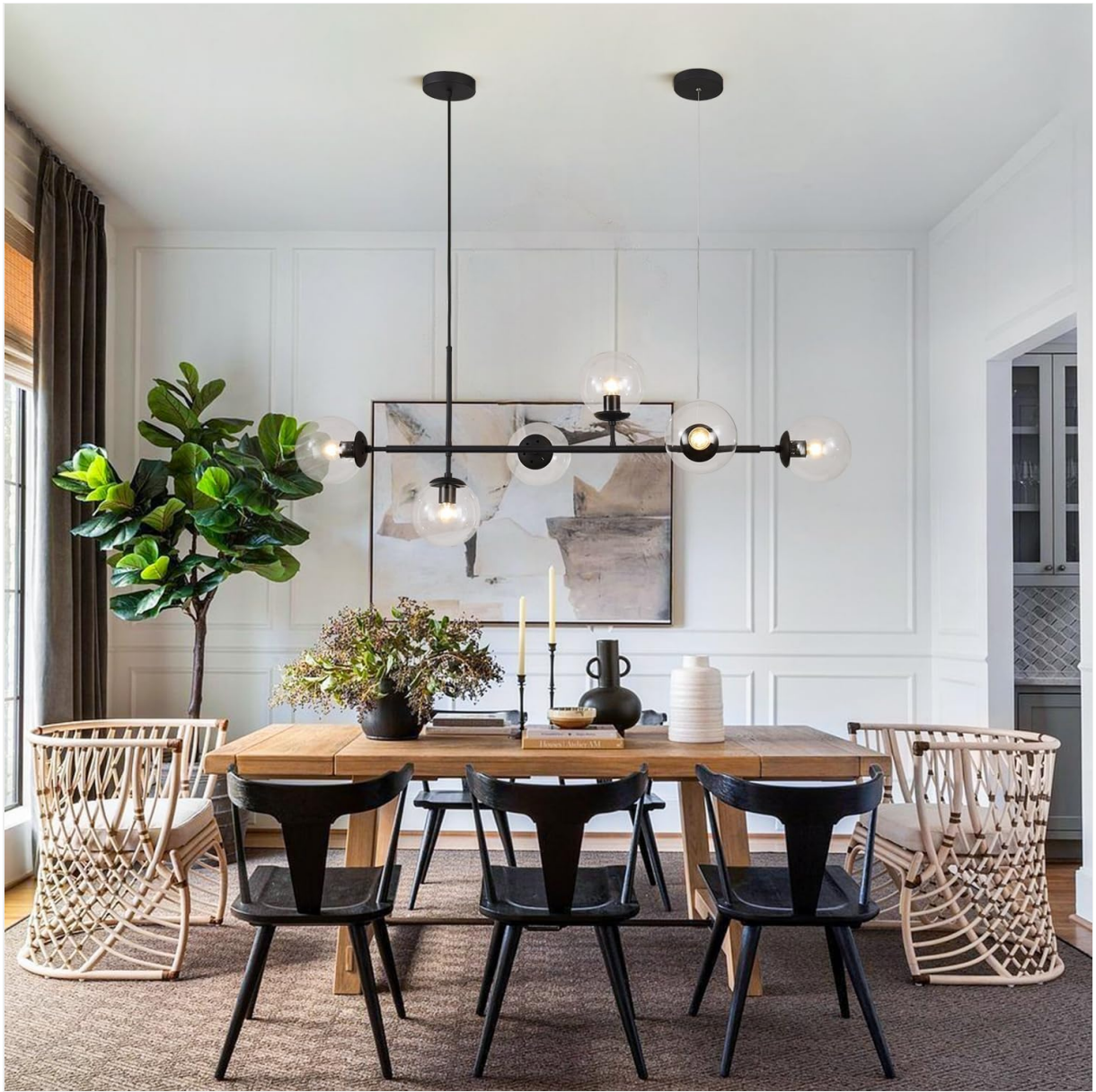
Figure 9.3: A stylish centerpiece for dining areas.