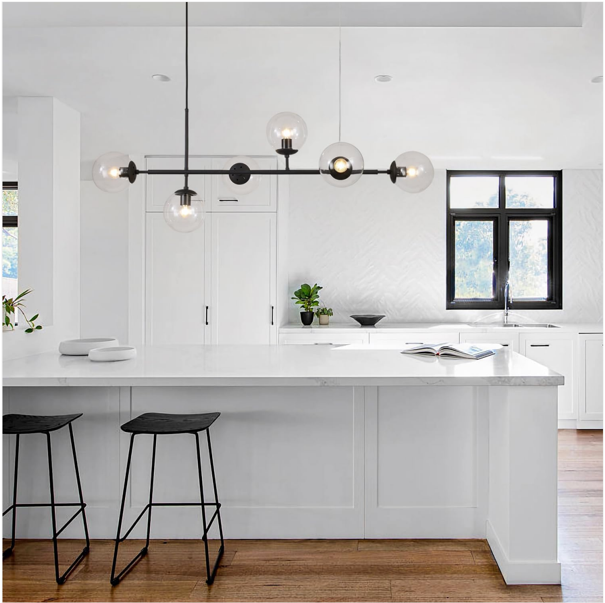
Figure 9.2: Perfect for illuminating a kitchen island.