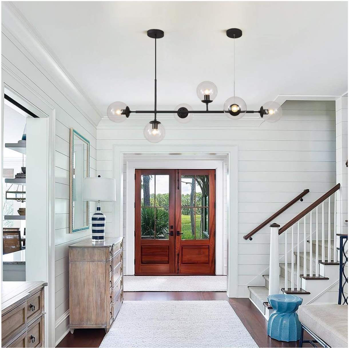
Figure 9.4: Adding modern elegance to an entryway.