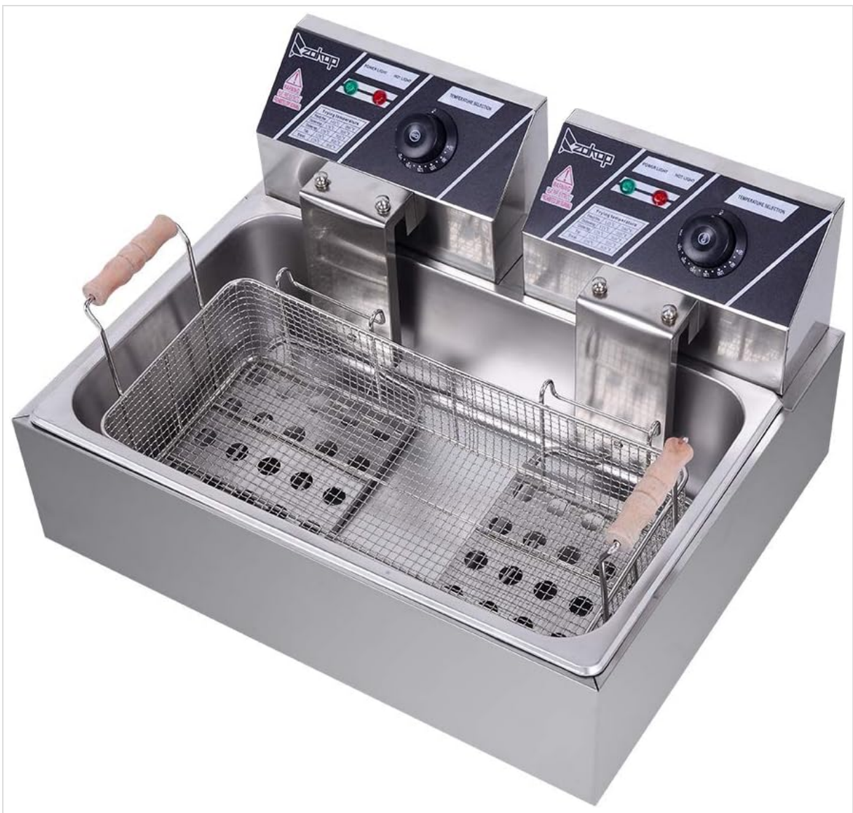
Image: The ZOKOP Eh830 Electric Deep Fryer with two fry baskets placed inside the oil pan, illustrating the dual-basket setup after assembly.