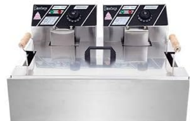
Image: Individual components including the stainless steel oil pan and the wire fry basket with wooden handles, shown with their dimensions.