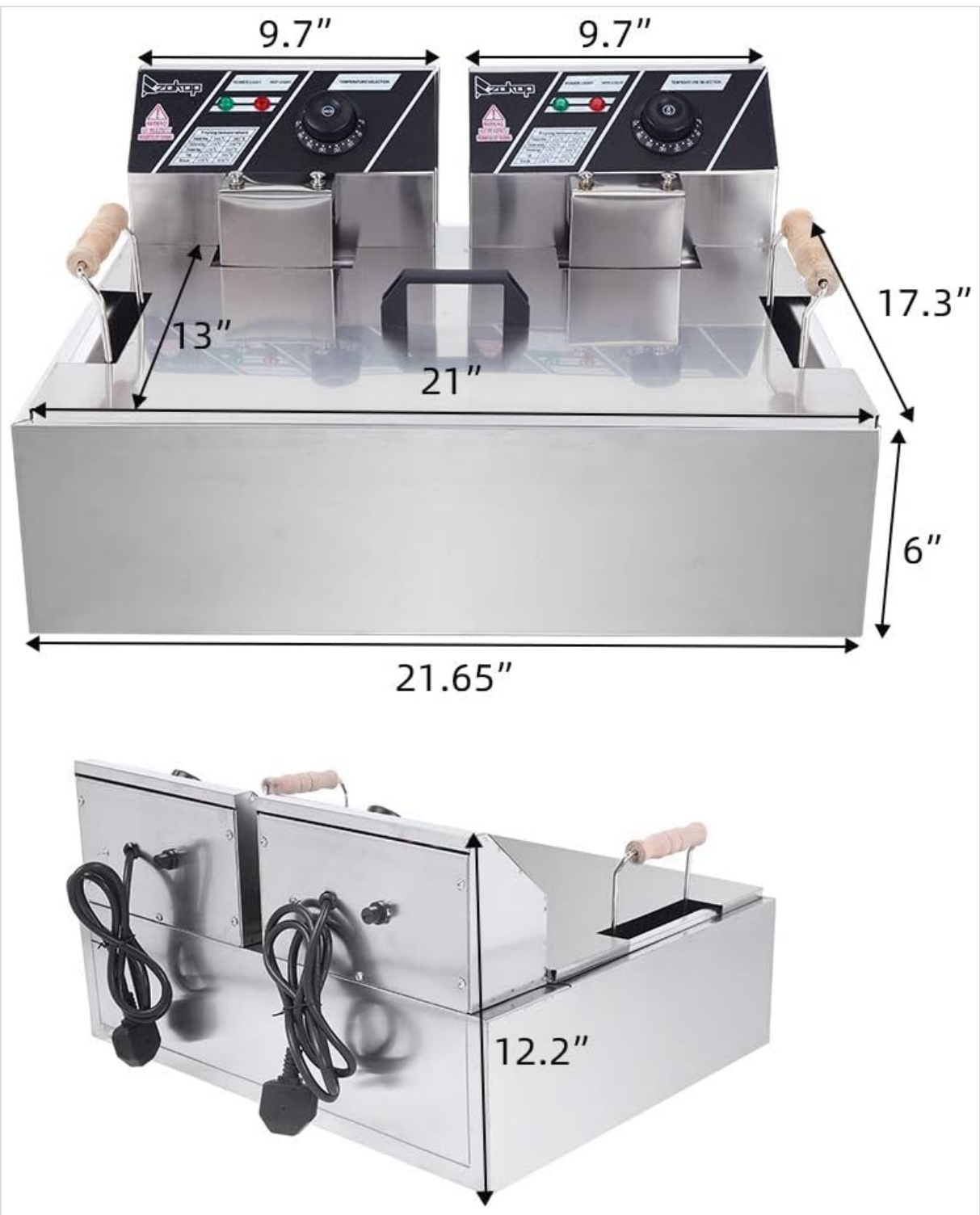
Image: Dimensional drawing of the ZOKOP Eh830 Electric Deep Fryer, showing overall dimensions of 21.65" width, 17.3" depth, and 12.2" height, with individual heating unit dimensions.