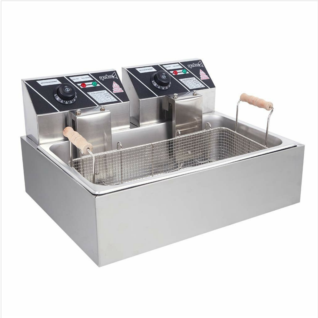
Image: The ZOKOP Eh830 110V Electric Deep Fryer, showcasing its stainless steel construction and dual fry baskets.