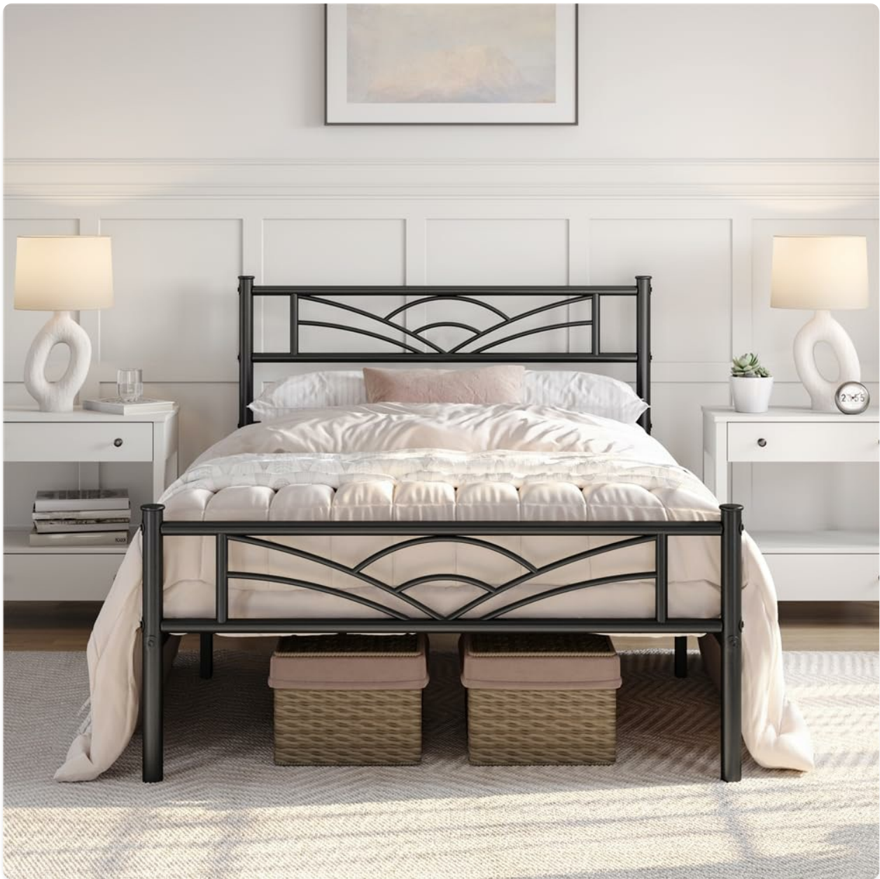
The Yaheetech Simple Metal Bed Frame, designed for comfort and durability.