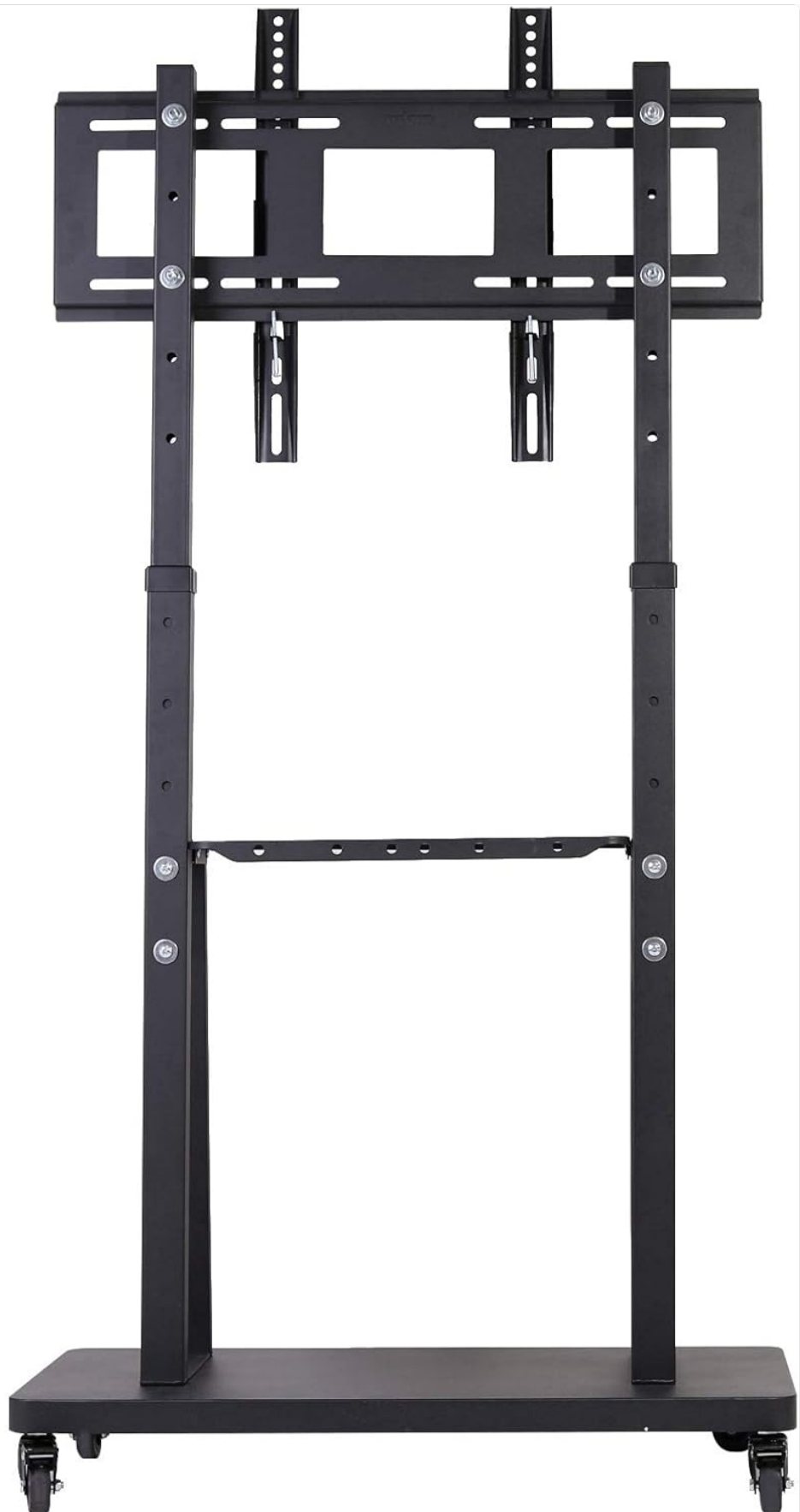
Figure 3: Back view of the TV cart frame.