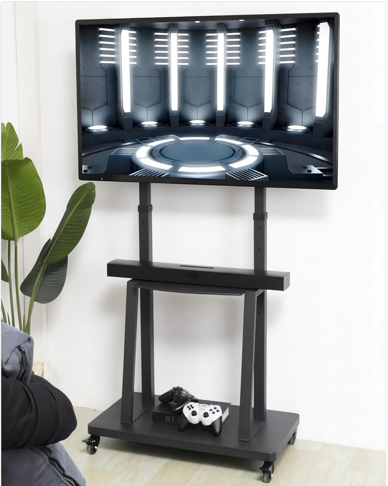
Figure 1: unho 950A Mobile TV Cart in a living room setting.