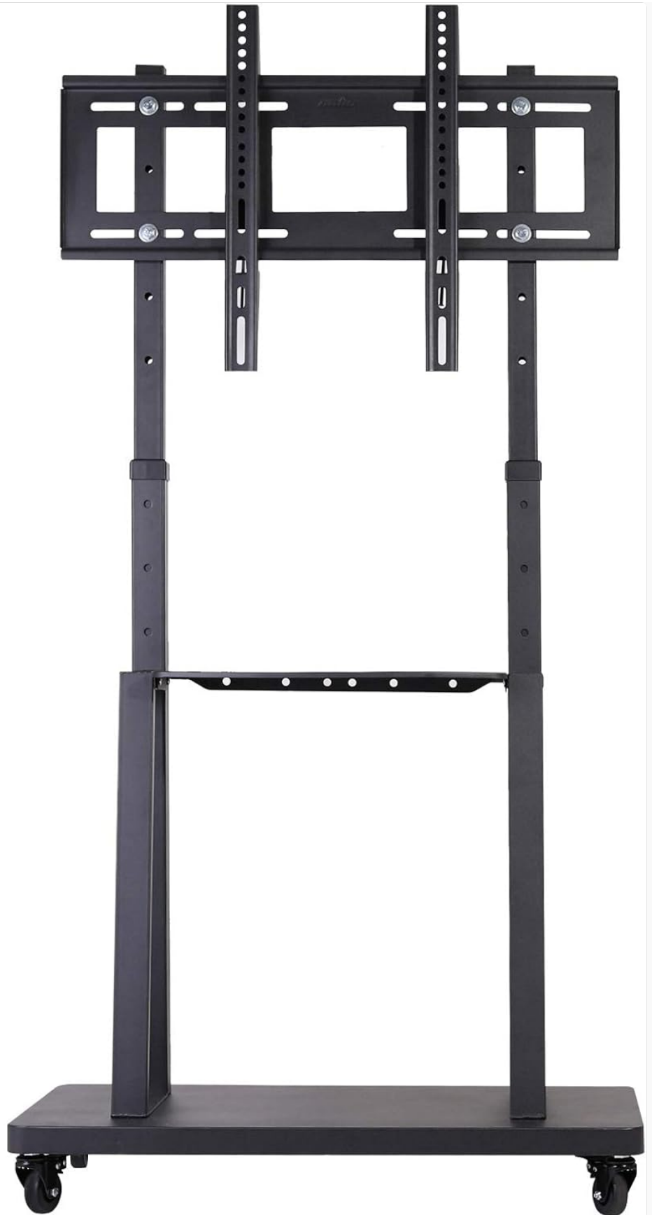
Figure 2: Front view of the TV cart frame.