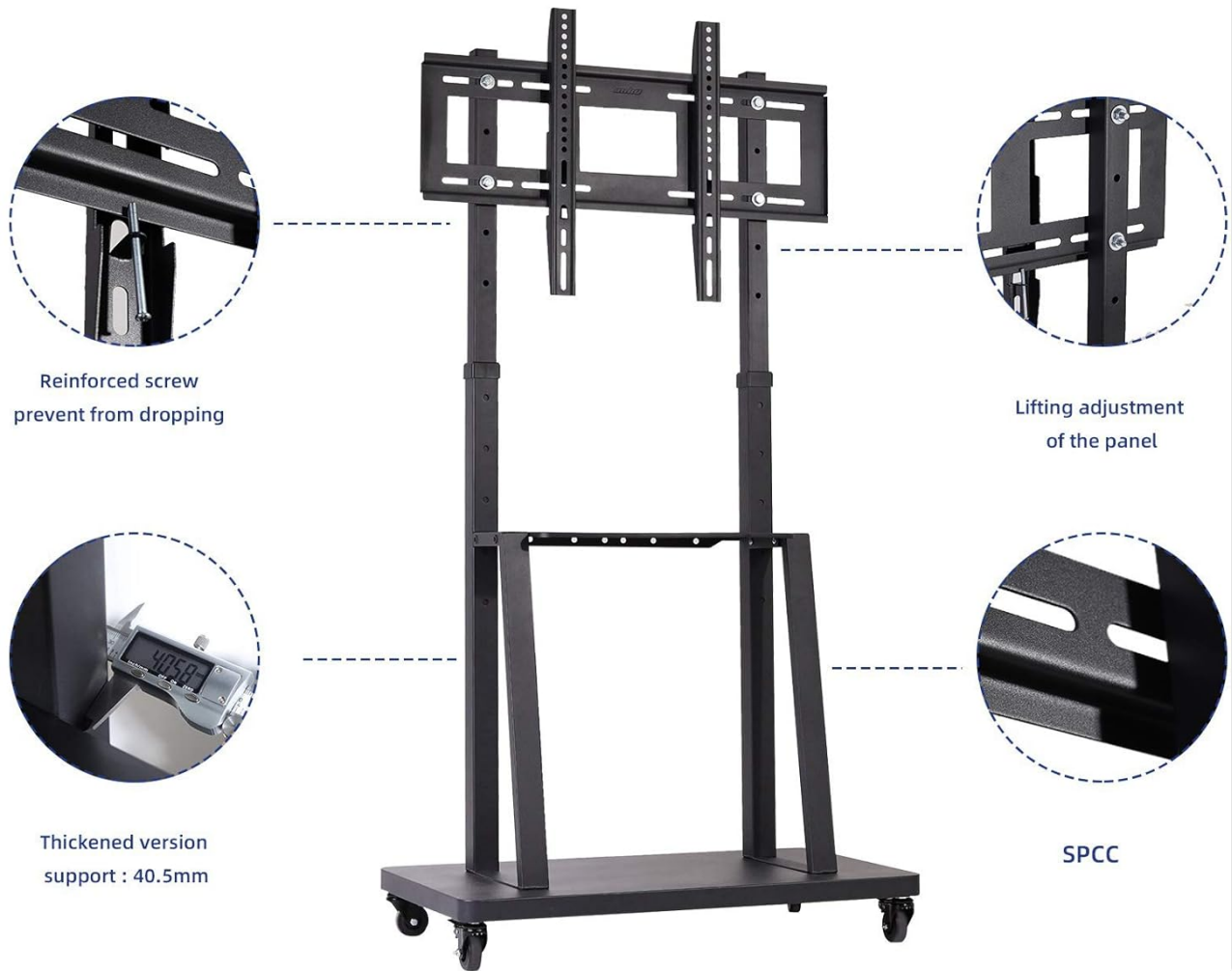
Figure 6: Key structural features and quality details.