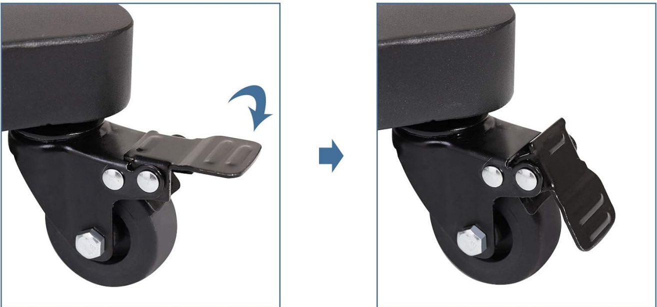
Figure 4: Detail of 360° movable and lockable casters.