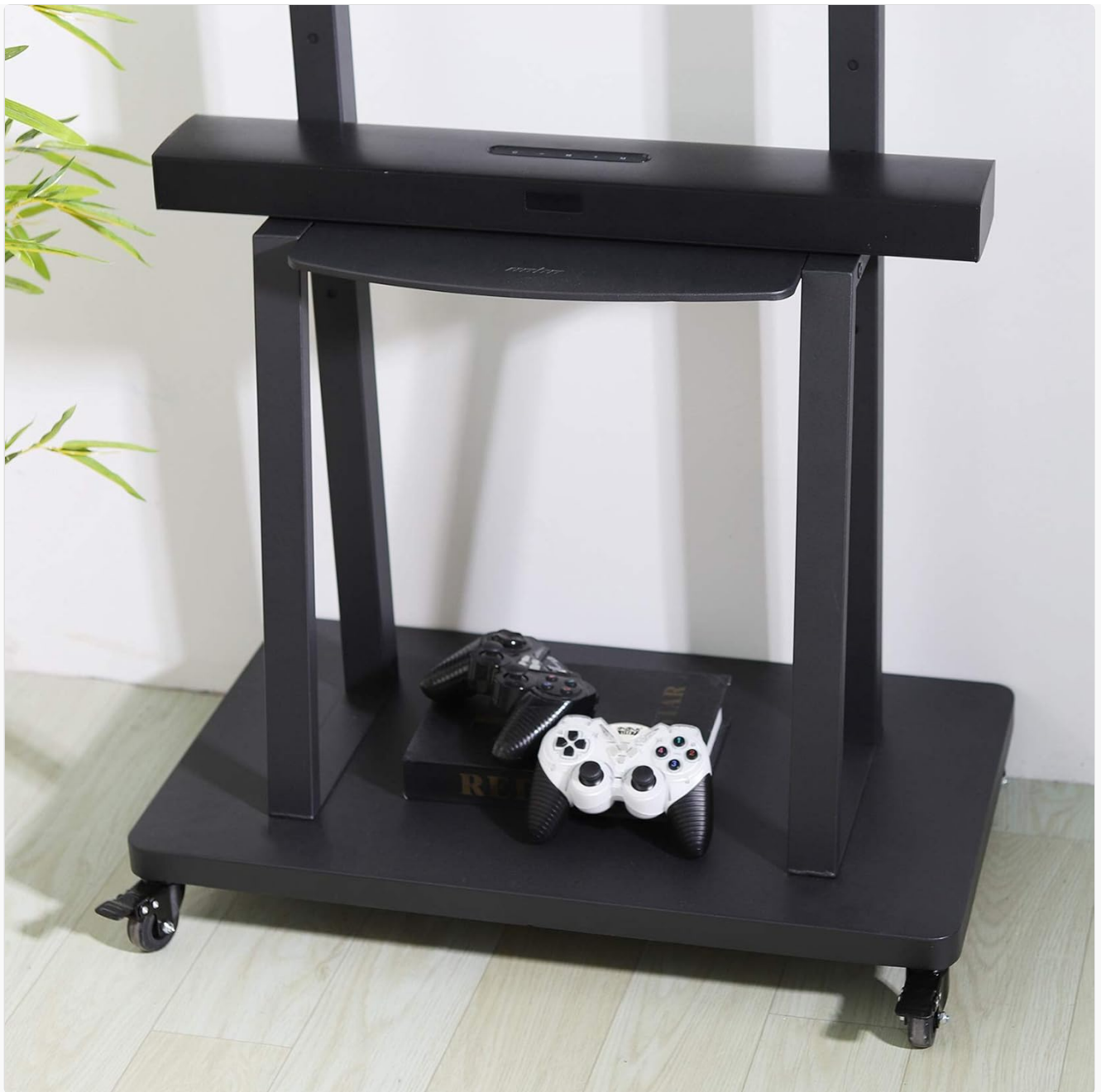
Figure 5: AV shelves for media devices.