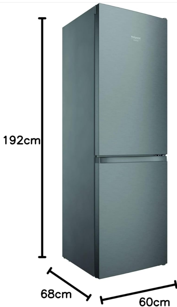
Image 3.1: Dimensional diagram of the Hotpoint HAFC8 TIA22SX refrigerator, indicating a height of 192 cm, width of 60 cm, and depth of 68 cm for proper placement planning.

The appliance dimensions are approximately: Height 191.2 cm, Width 59.6 cm, Depth 67.8 cm.