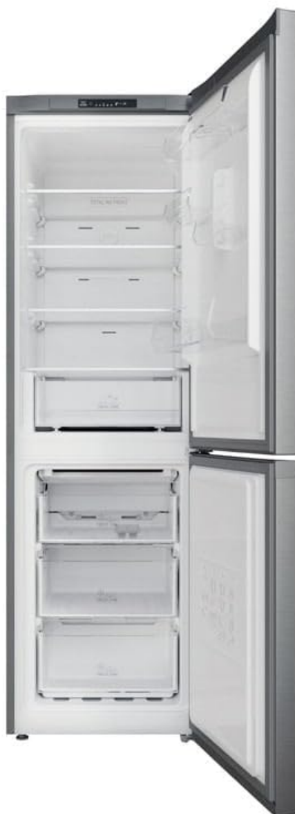
Image 4.3: The refrigerator with both doors open, providing a full view of the interior layout, including the upper refrigerator section and the lower freezer drawers.