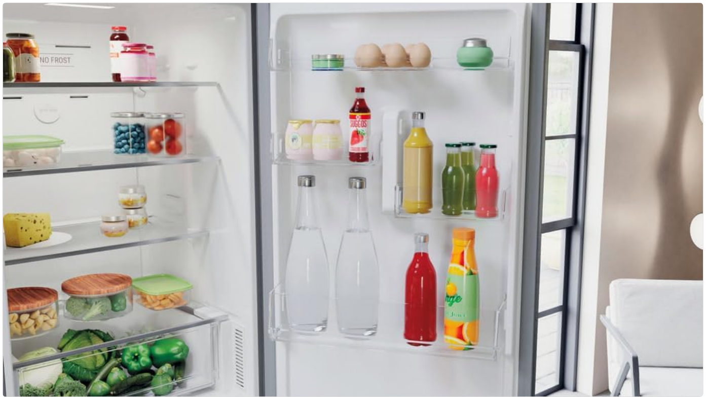
Image 4.2: Inside the refrigerator, displaying adjustable glass shelves, various door bins for bottles and smaller items, and a dedicated drawer for fresh produce.