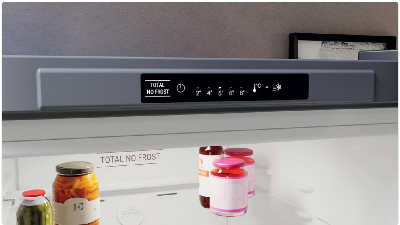
Image 4.1: Detailed view of the electronic control panel, showing indicators for "TOTAL NO FROST" and digital temperature settings (e.g., 2°, 4°, 5°, 6°, 8° Celsius).