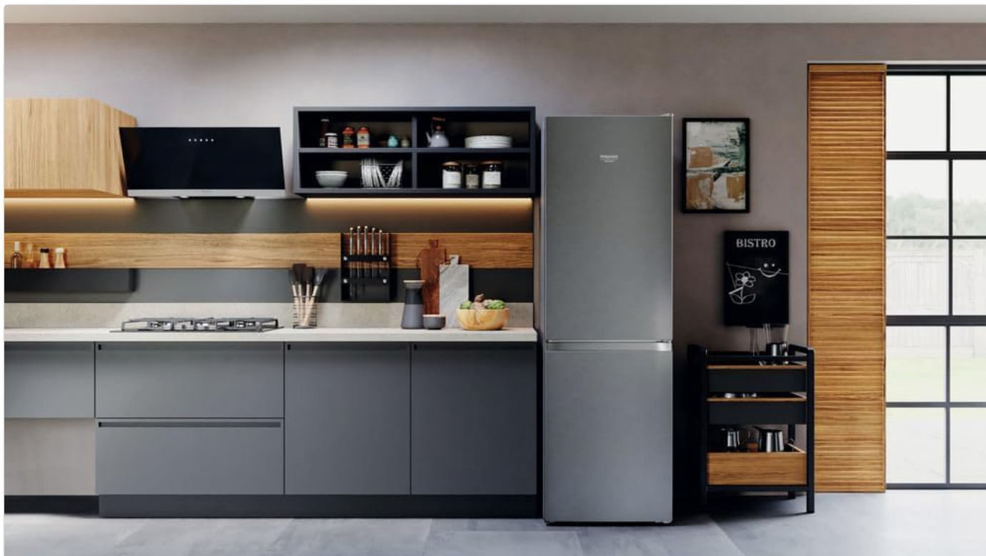
Image 1.1: The Hotpoint HAFC8 TIA22SX refrigerator integrated into a modern kitchen environment, showcasing its freestanding design.

This manual provides essential information for the safe and efficient operation of your new Hotpoint HAFC8 TIA22SX freestanding combined refrigerator. Please read these instructions carefully before installation and use, and retain them for future reference. This appliance is designed for domestic use only.