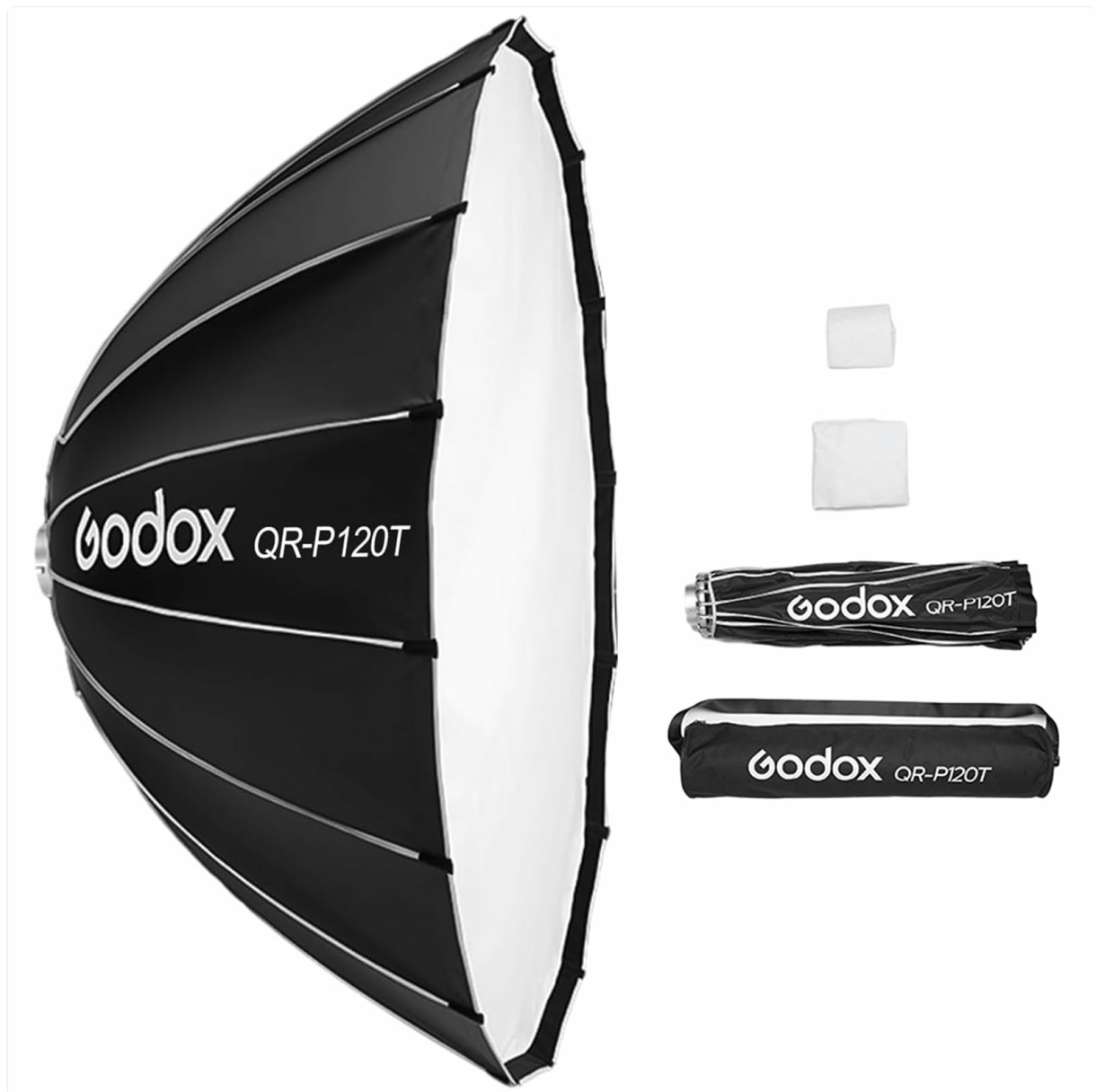
Figure 1: Godox QR-P120T Quick Release Parabolic Softbox.