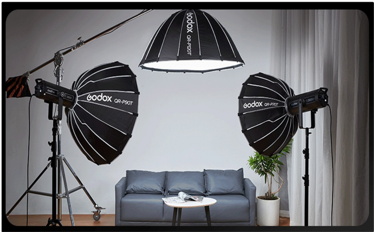
Figure 2: Overview of Godox QR-P series softboxes and included components.