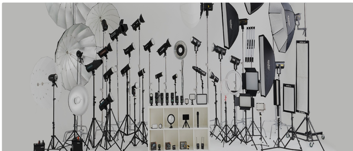
Figure 6: Example of the Godox QR-P120T in a studio setting.