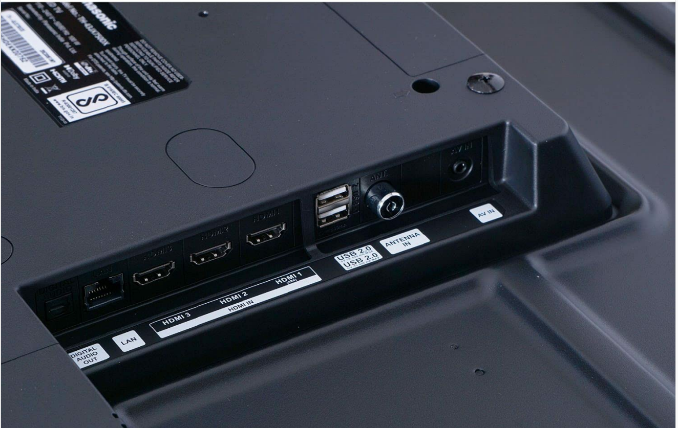
Figure 3: Detailed view of TV connectivity ports.