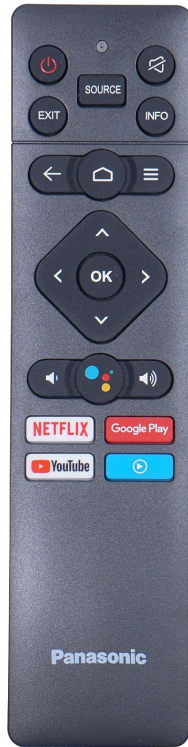
Figure 4: Panasonic TV Remote Control.