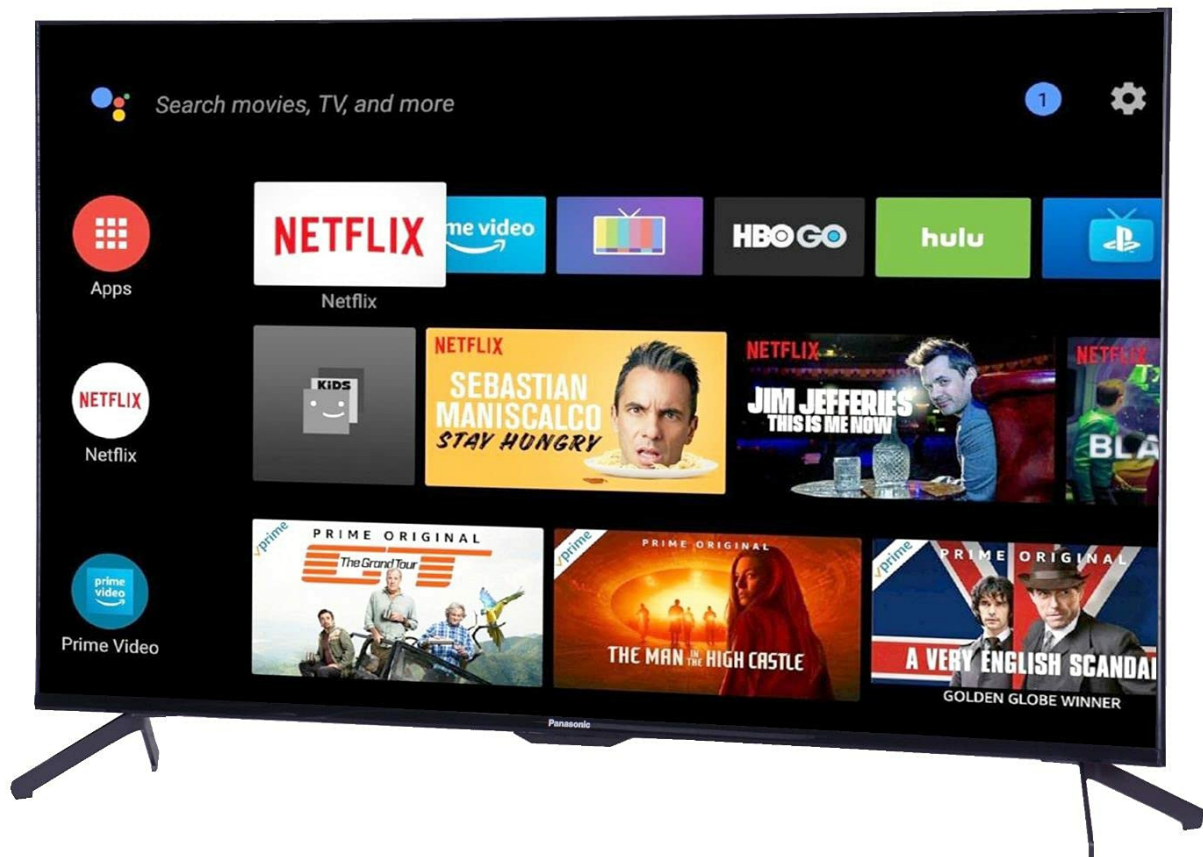
Figure 5: Android TV Home Screen with applications.

From the Home screen, you can access pre-installed applications like Prime Video, YouTube, and Netflix. Additional apps can be downloaded from the Google Play Store.