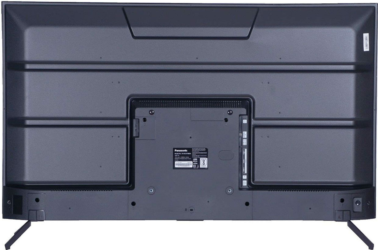
Figure 2: Rear view of the TV, indicating stand attachment points.