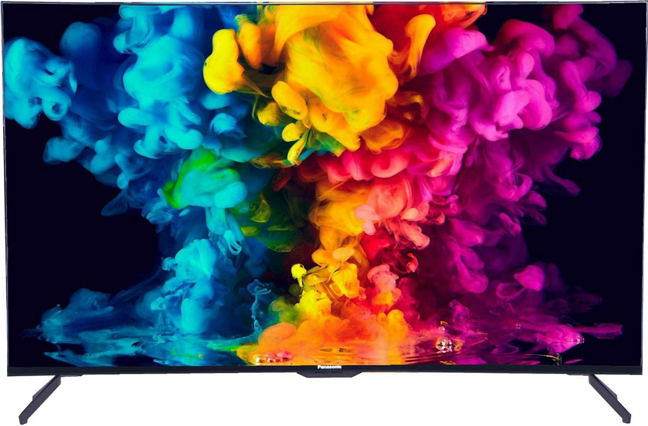
Figure 1: Front view of the Panasonic TH-55JX750DX TV.