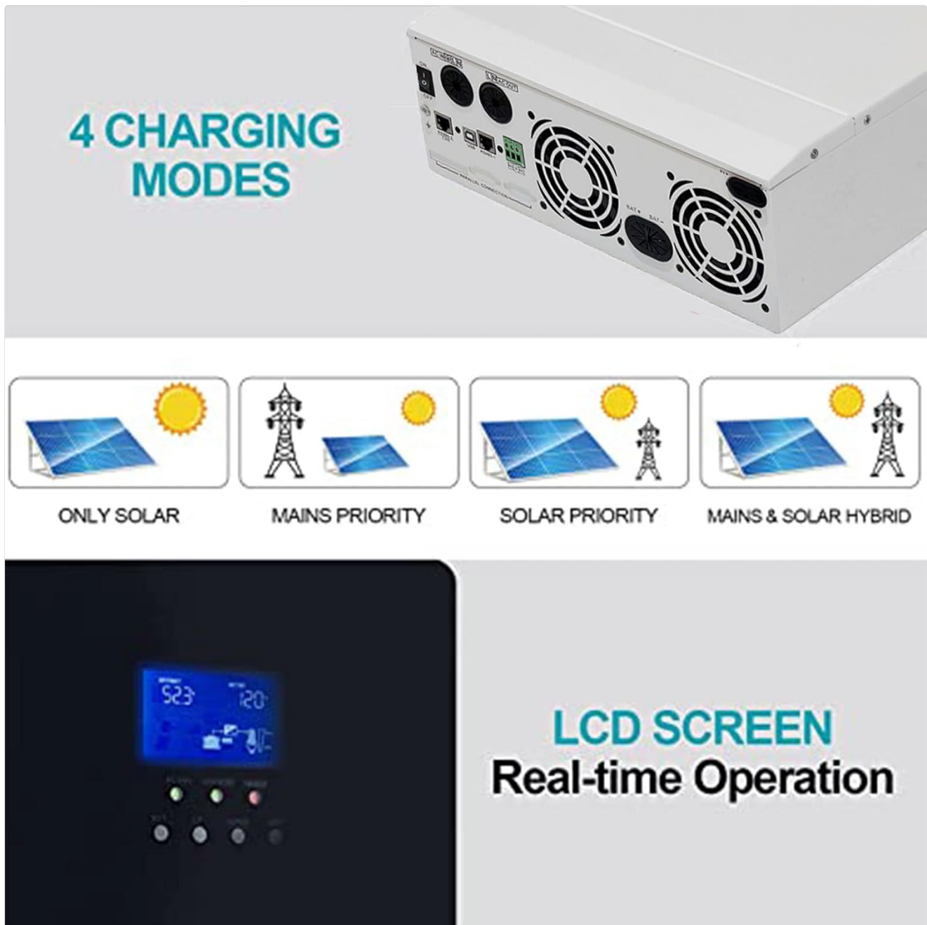
Figure 7: Visual representation of the four selectable charging modes for the inverter.