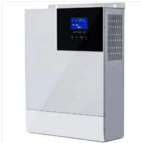
Figure 6: Detailed view of the LCD screen, control buttons (SET, UP, DOWN, ENT), and LED indicators (AC/INV, CHARGE, FAULT).

The inverter's LCD screen and buttons allow for monitoring and configuration of various parameters.