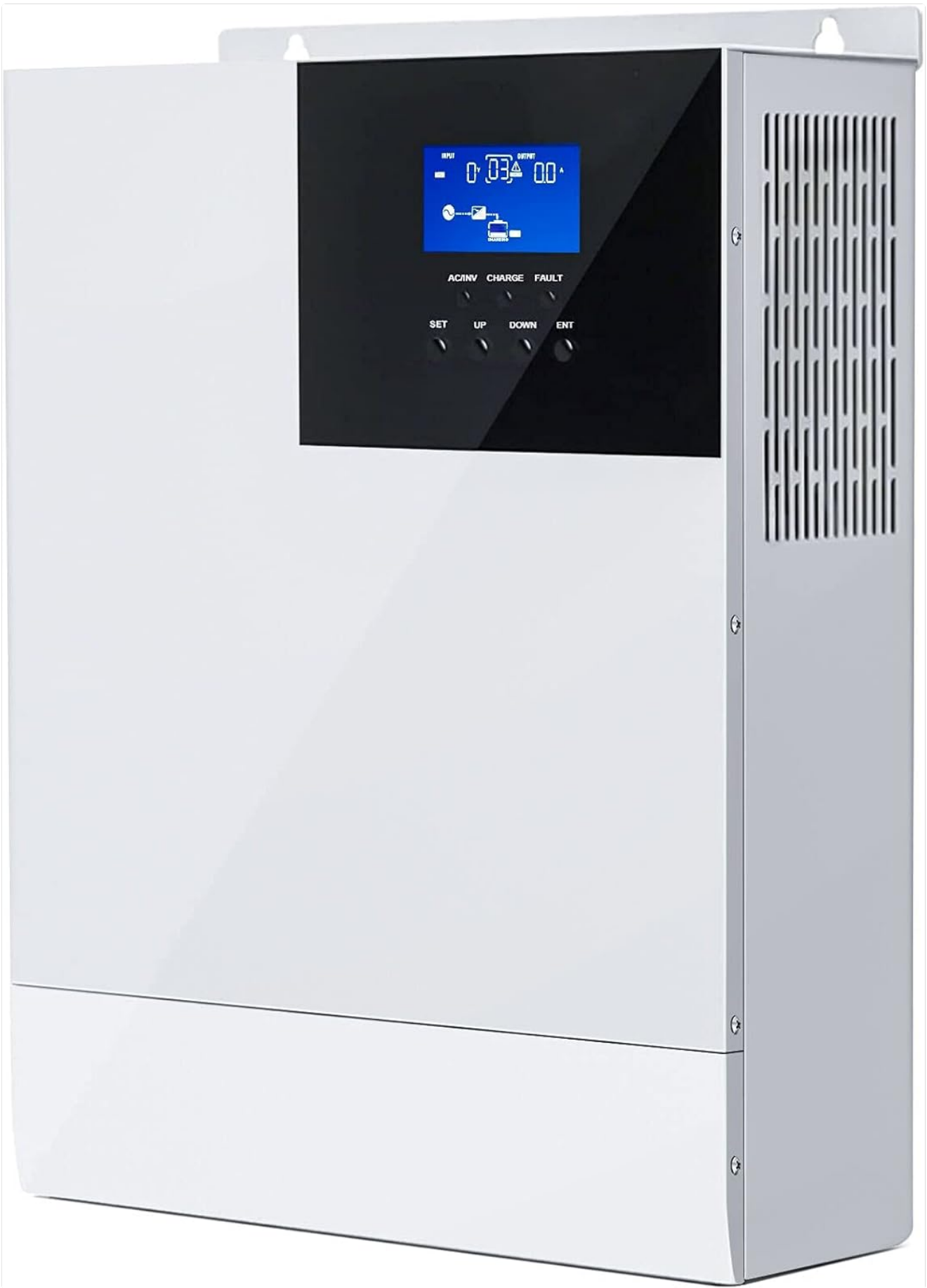
Figure 1: Front view of the POWLAND 5000W Solar Inverter Charger.