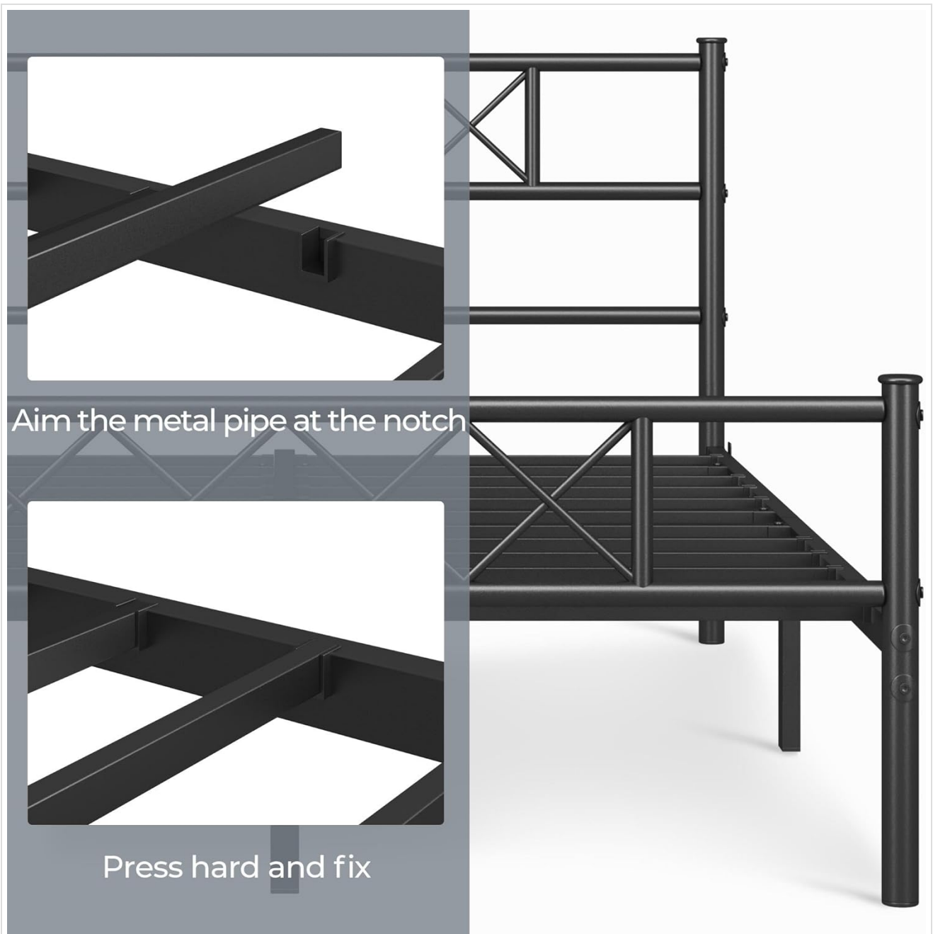
Figure 5: Step-by-step guide for connecting metal pipes by aiming at the notch and pressing firmly to fix.