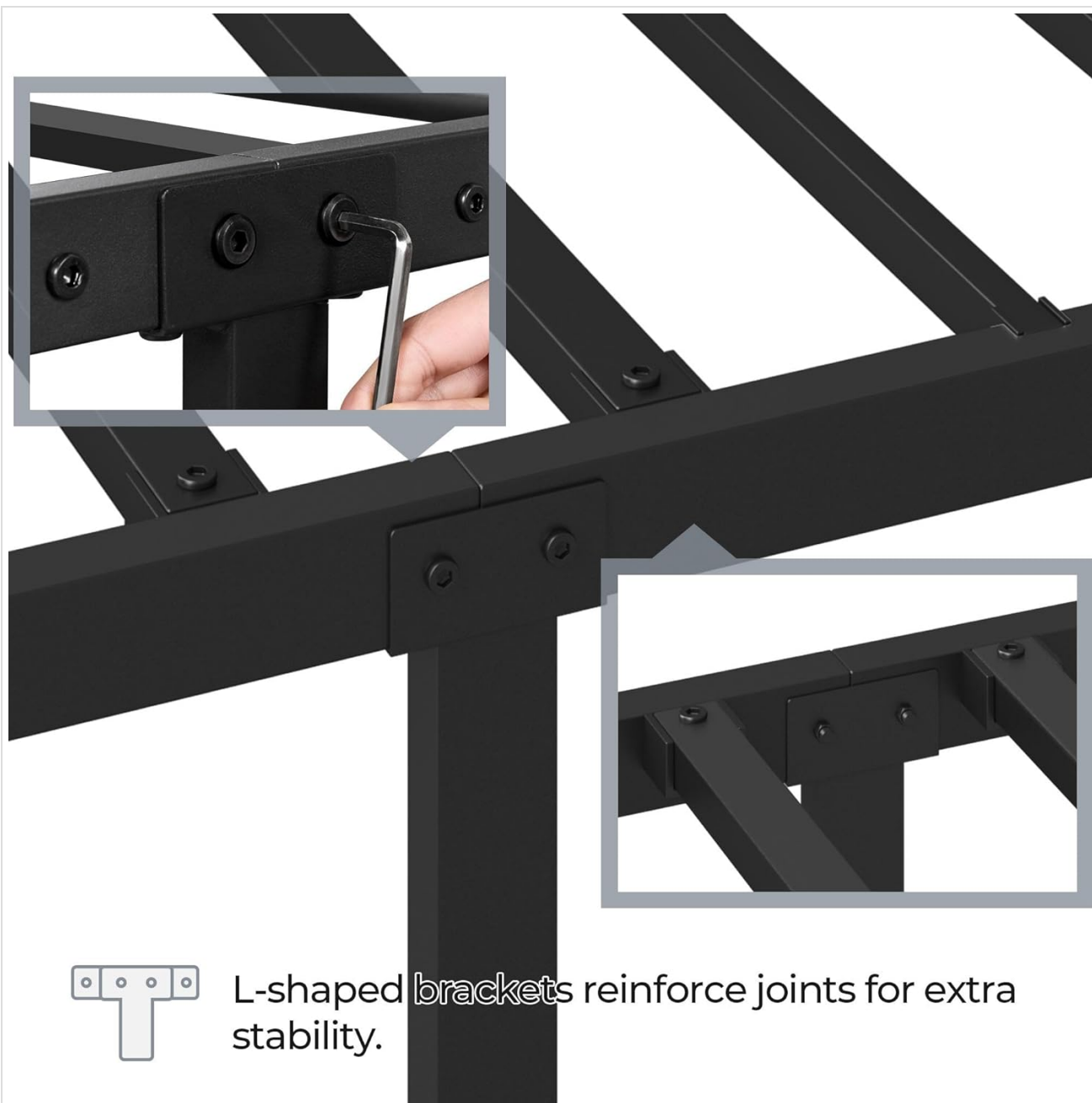
Figure 6: Detail of L-shaped brackets used to reinforce joints, ensuring extra stability for the bed frame.