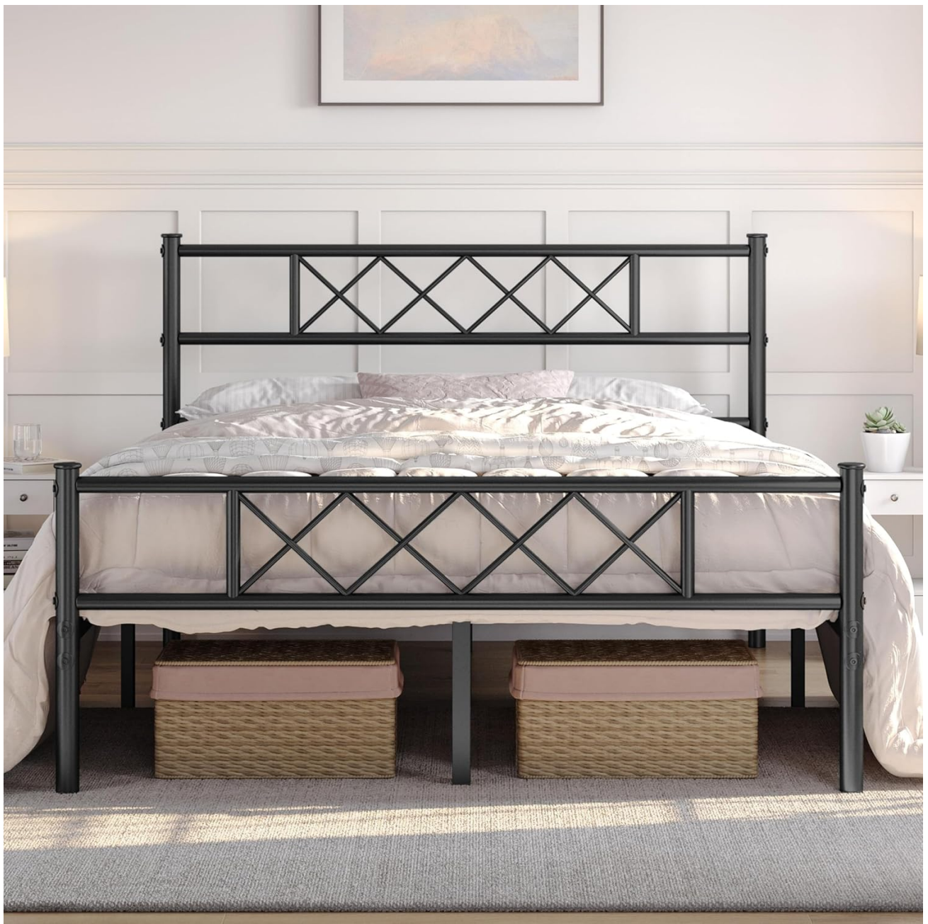
Figure 1: Yaheetech Full Metal Platform Bed Frame with mattress and bedding in a bedroom.