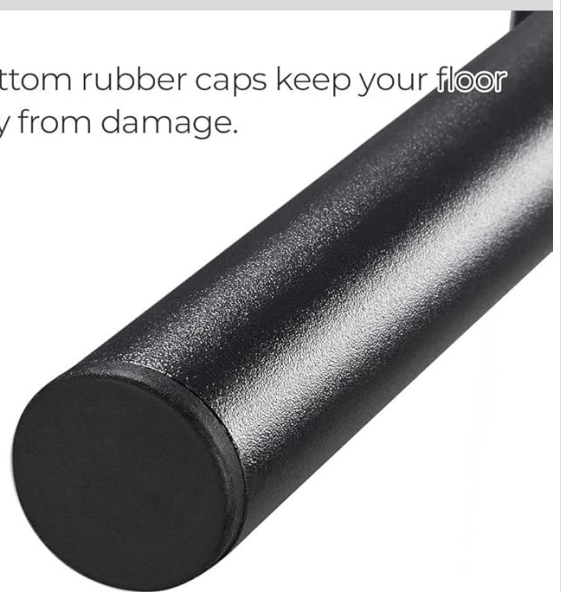
Figure 3: Illustration of anti-slip baffles to prevent mattress shifting and superior metal tubes for extended use.

B ottom rubber caps keep your floor away from damage.