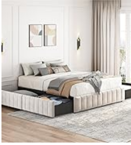
Image: Solid metal frame ensures stability and durability.