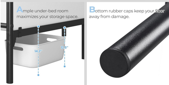
Image: Anti-slip baffles prevent mattress shifting, and bottom rubber caps protect floors.

B ottom rubber caps keep your floor away from damage.