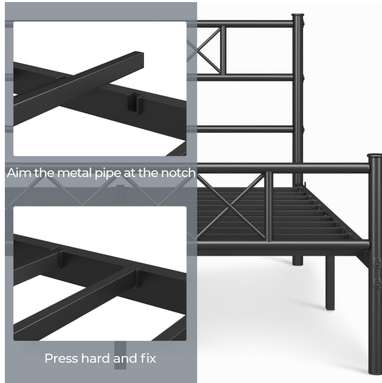
Image: Aiming the metal pipe at the notch for proper connection.