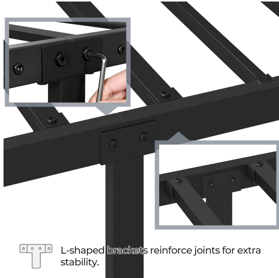
Image: L-shaped brackets reinforce joints for extra stability.