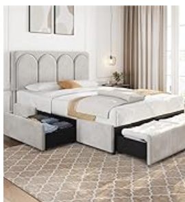
Image: Clear instructions and useful tools are provided for easy setup.