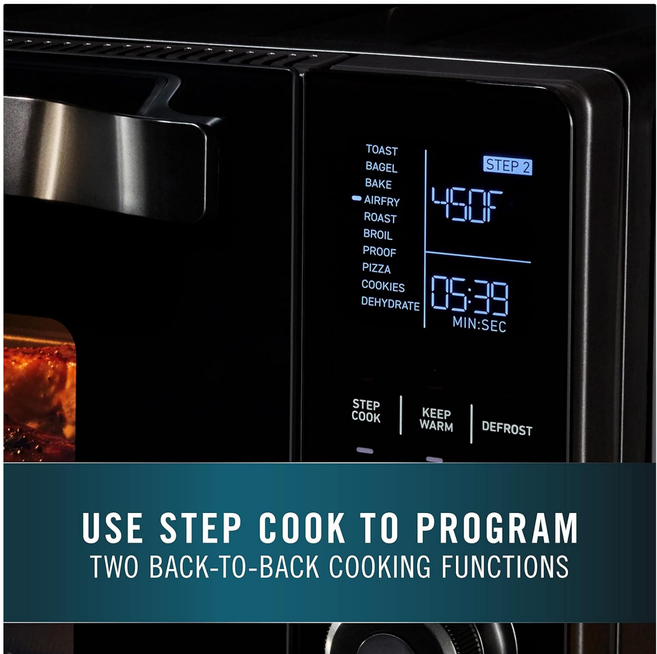
Image: The oven's digital display indicating 'STEP 2' during the programming of the Step Cook function, showing temperature and time settings.