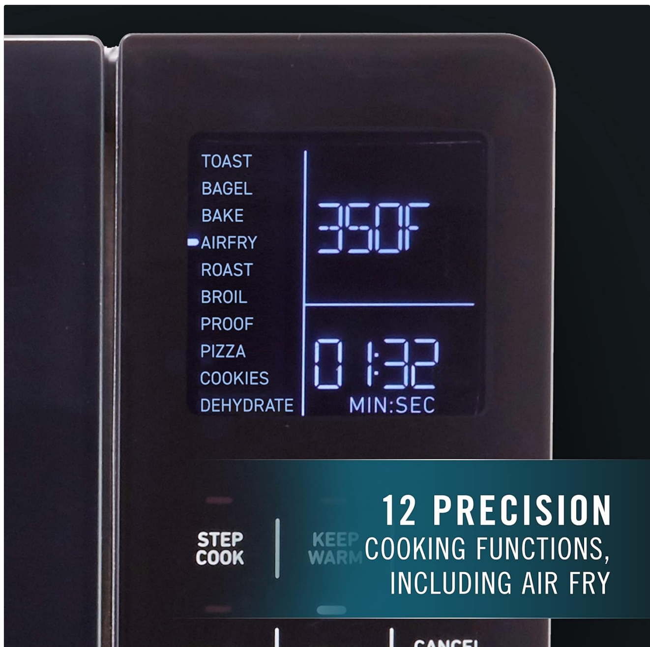
Image: A detailed view of the oven's control panel, showing the digital display with temperature and time settings, function list, and control knobs.

The oven features a high-contrast LCD screen and touchscreen buttons for intuitive control. The display shows the selected function, temperature, and cooking time.