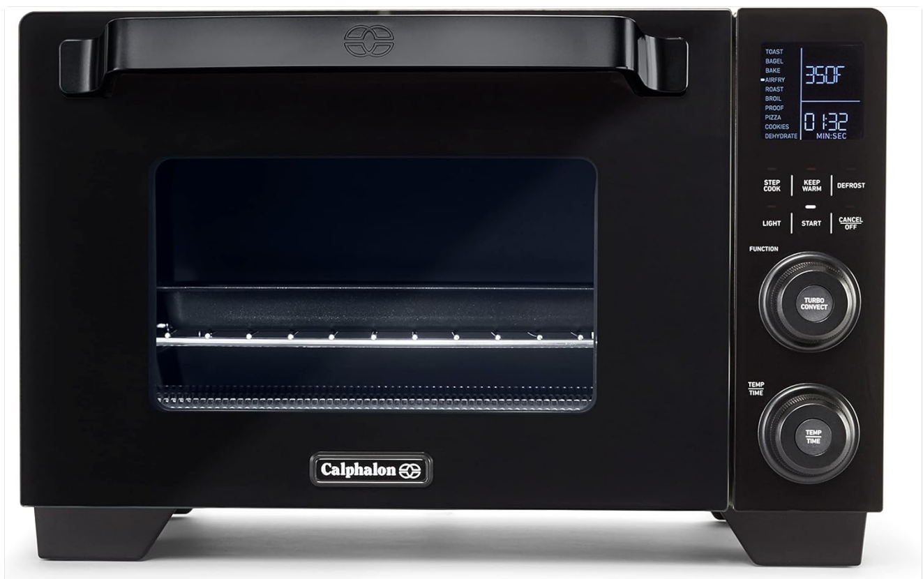
Image: Front view of the Calphalon Performance Cool Touch Air Fry Countertop Oven, showcasing its sleek design and digital display.

The Calphalon Performance Cool Touch Air Fry Countertop Oven is an 11-in-1 appliance designed for versatile cooking. It features Quartz Heat Technology for even heating and a Cool Touch Exterior for enhanced safety. The oven offers 12 precision cooking functions and a convenient Step Cook feature.