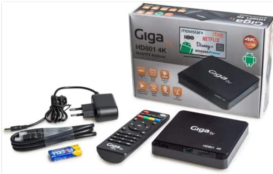
Figure 2.1: GIGATV HD801 TV Box and its included accessories.