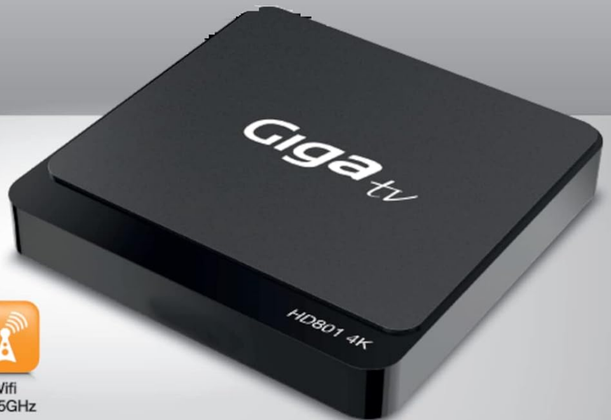
Figure 3.2: GIGATV HD801 Smart TV Box highlighting its key features.