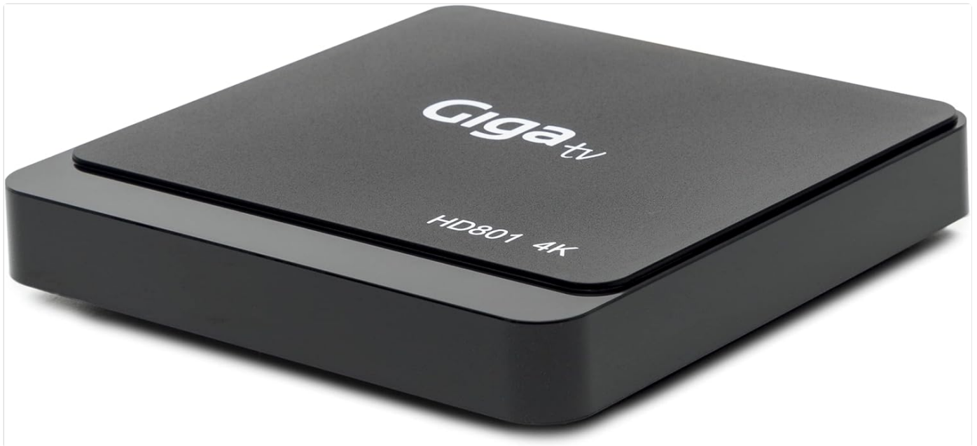
Figure 3.1: Front view of the GIGATV HD801 Smart TV Box.

The GIGATV HD801 is a compact and powerful streaming device. Its sleek design integrates seamlessly into any home entertainment setup.