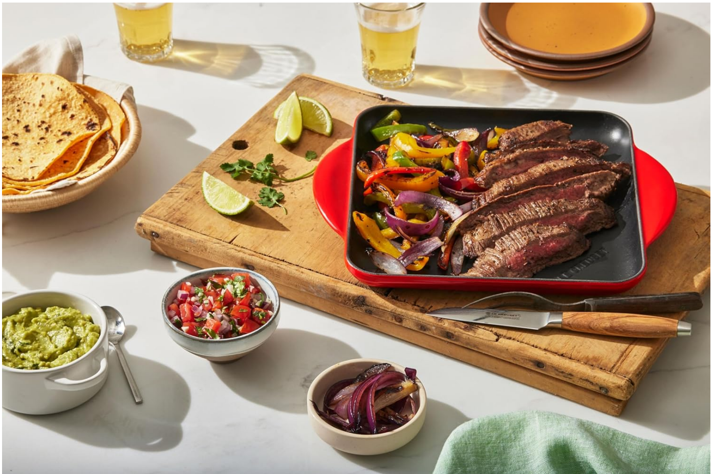
The Le Creuset grill pan used to prepare grilled steak and vegetables.