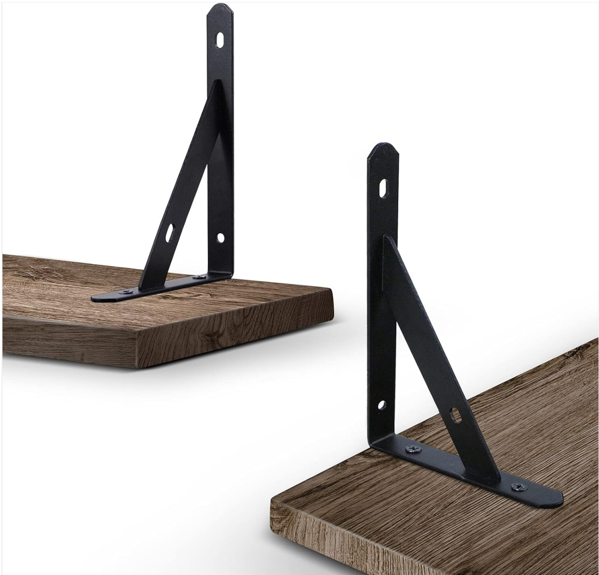
Image: Detail of the metal bracket attachment to the paulownia wood shelf.

Your browser does not support the video tag.