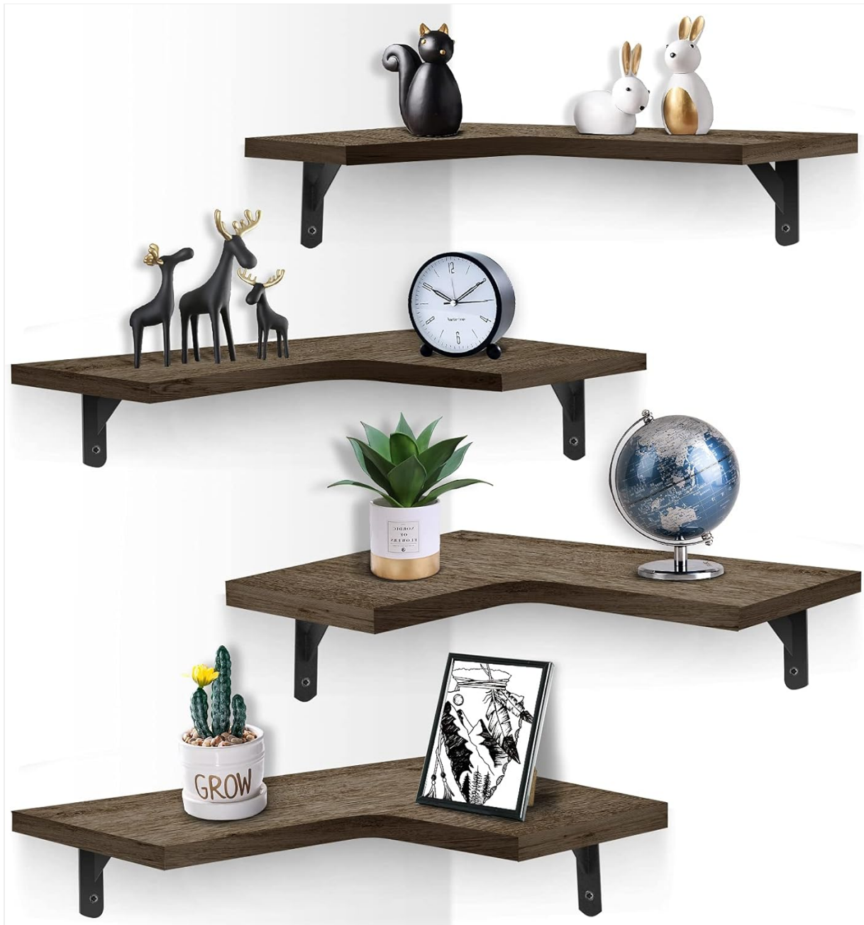
Image: An arrangement of four EACHPAI corner shelves displaying various items, highlighting their decorative potential.

living rooms, bathrooms, kitchens, and offices.