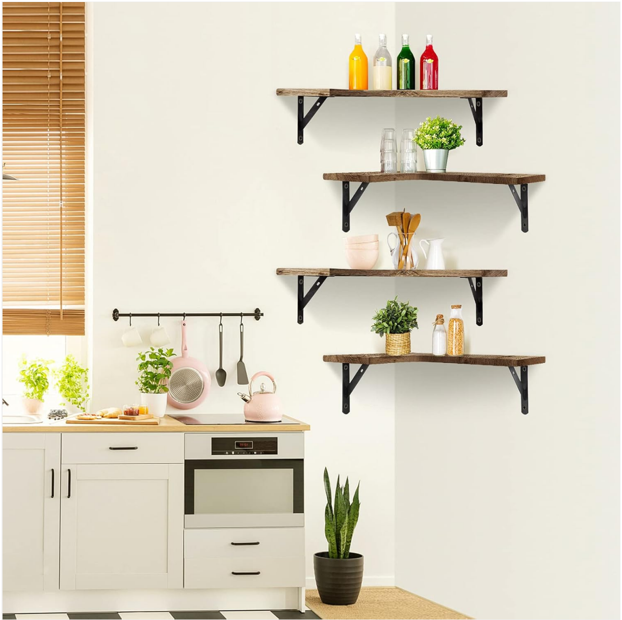
Image: EACHPAI shelves utilized in a kitchen for storing and displaying various items.