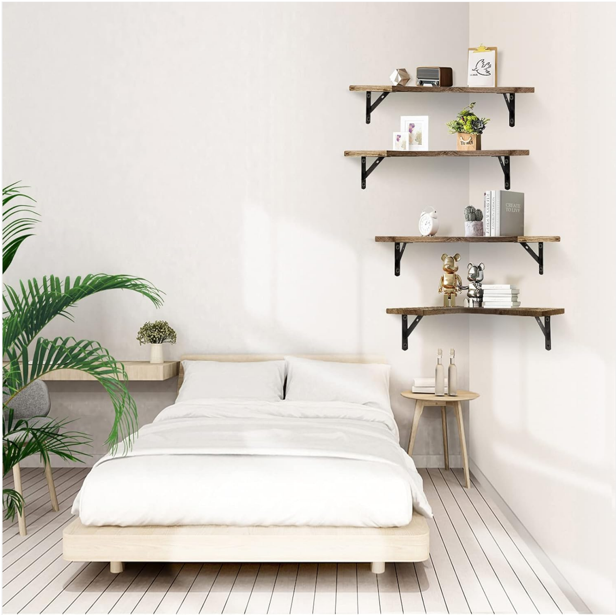
Image: EACHPAI shelves enhancing a bedroom corner with additional storage and display space.