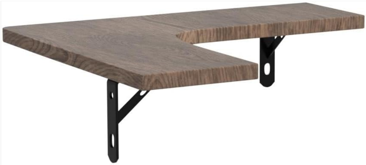
Image: A close-up view of the paulownia wood material, showcasing its texture and finish.