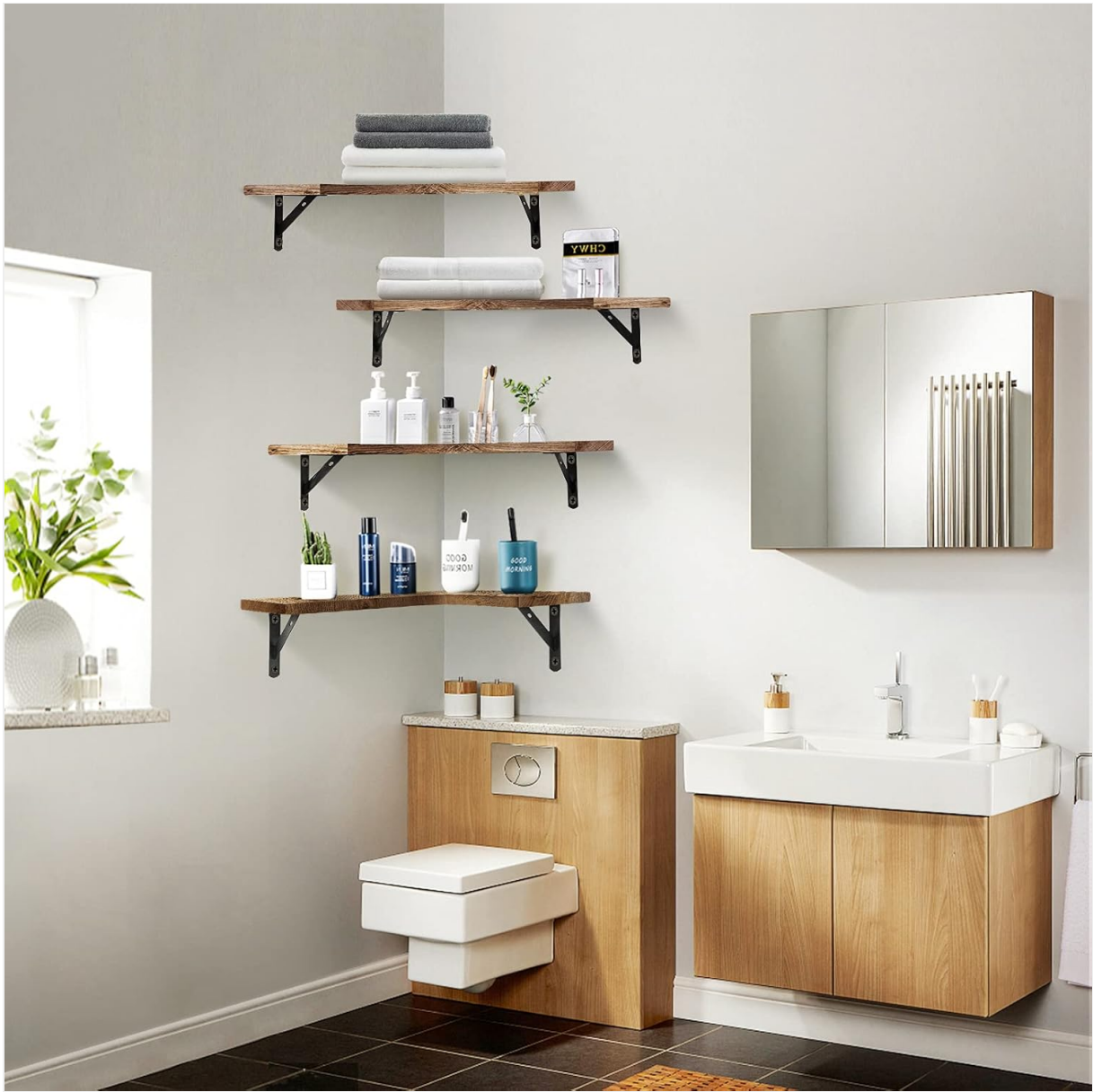
Image: EACHPAI shelves providing storage and organization in a bathroom environment.