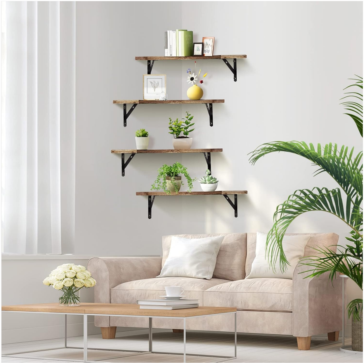
Image: EACHPAI shelves used in a living room setting, demonstrating their integration with home decor.