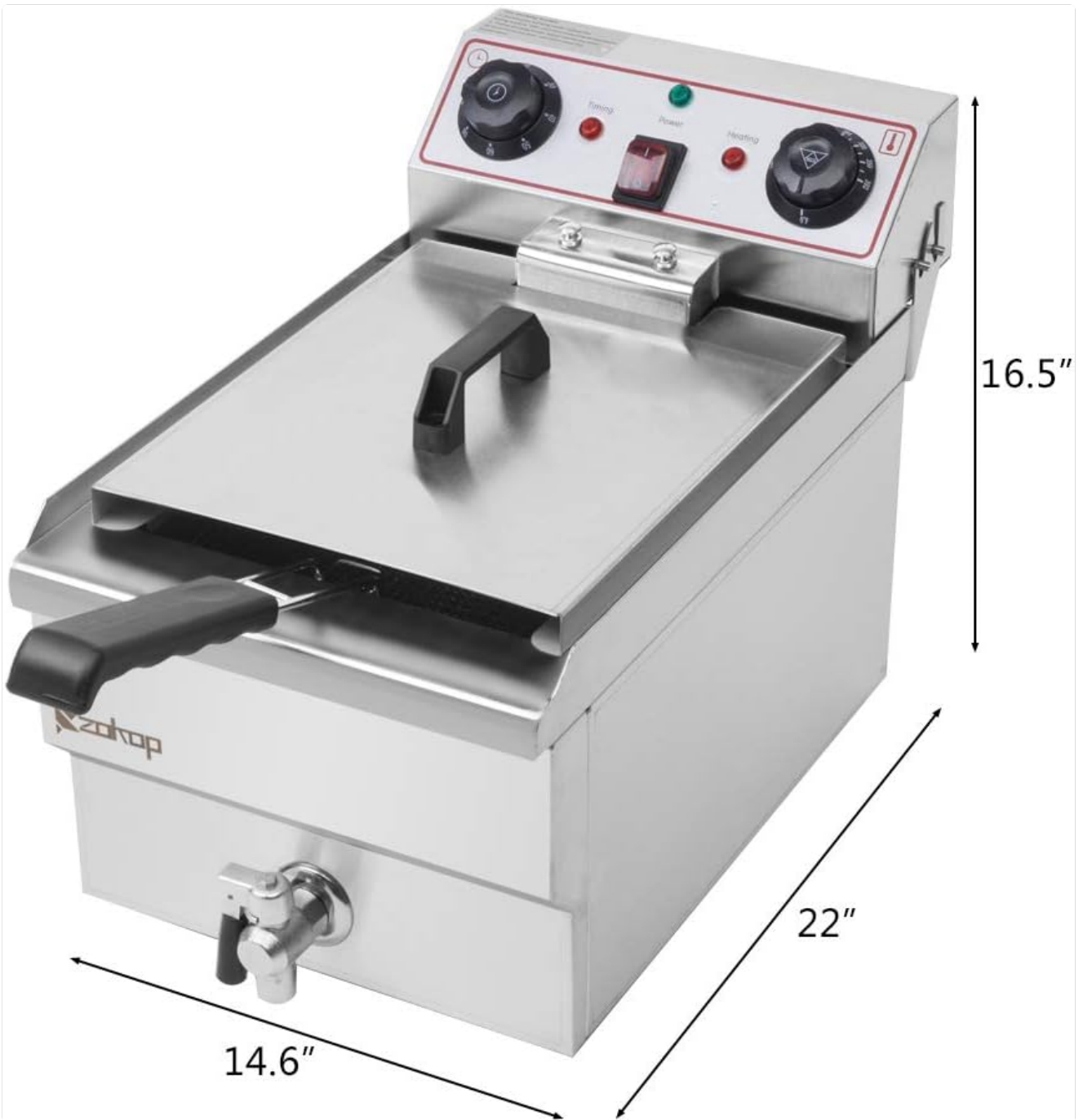
Figure 5: Overall dimensions of the ZOKOP EH101V Deep Fryer.