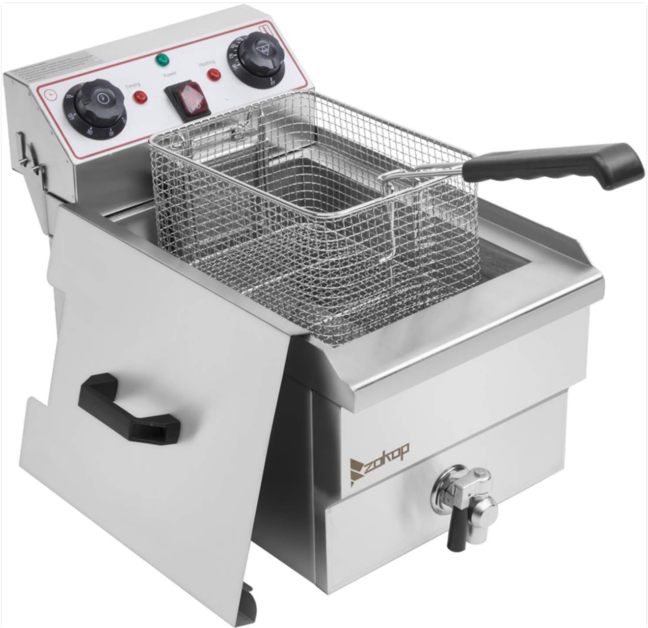
Figure 1: The ZOKOP EH101V Deep Fryer, showcasing its stainless steel construction, control panel, and frying basket.