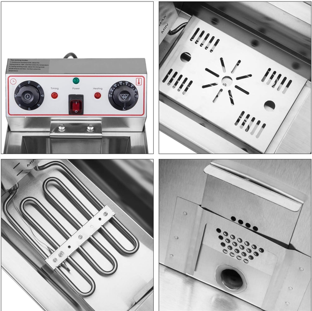
Figure 3: Close-up views showing the control panel, the residue plate inside the tank, the heating element, and the oil drain valve.