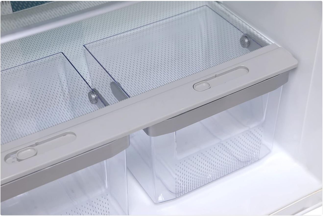
Figure 3.2: Transparent vegetable crisper drawers for fresh produce.