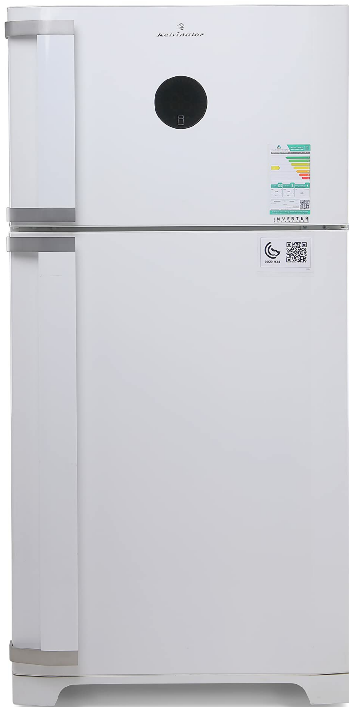
Figure 2.1: Front view of the Kelvinator Refrigerator Model KTM4881.