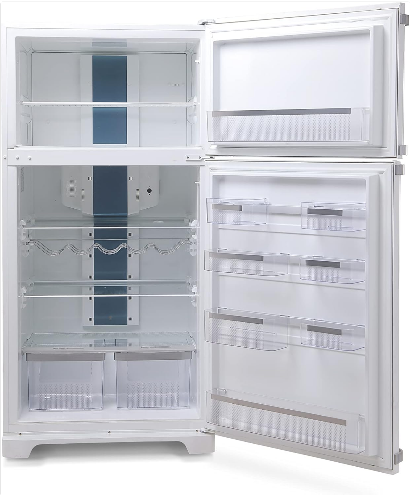
Figure 3.1: Interior layout of the refrigerator, showing shelves and drawers.