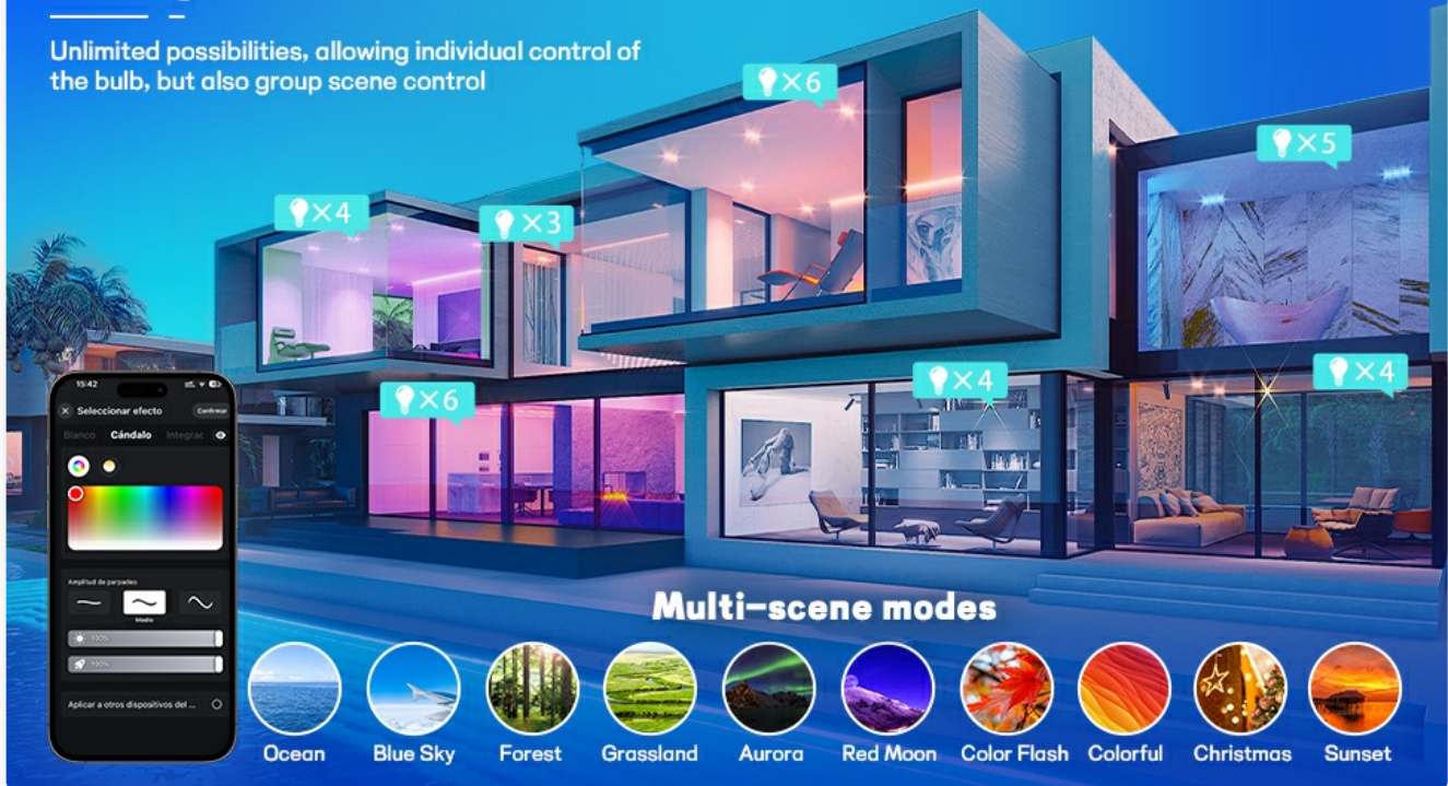
Image 4.3: Demonstrating the wide range of color options available through the app.

Unlimited possibilities, allowing individual control of the bulb, but also group scene control