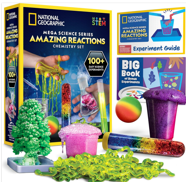
Image: The complete National Geographic Amazing Chemistry Set, including the main box, experiment guides, and various components for experiments.