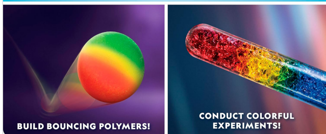
Image: Visuals of a glowing test tube and glowing worms, highlighting some of the more visually striking experiments.