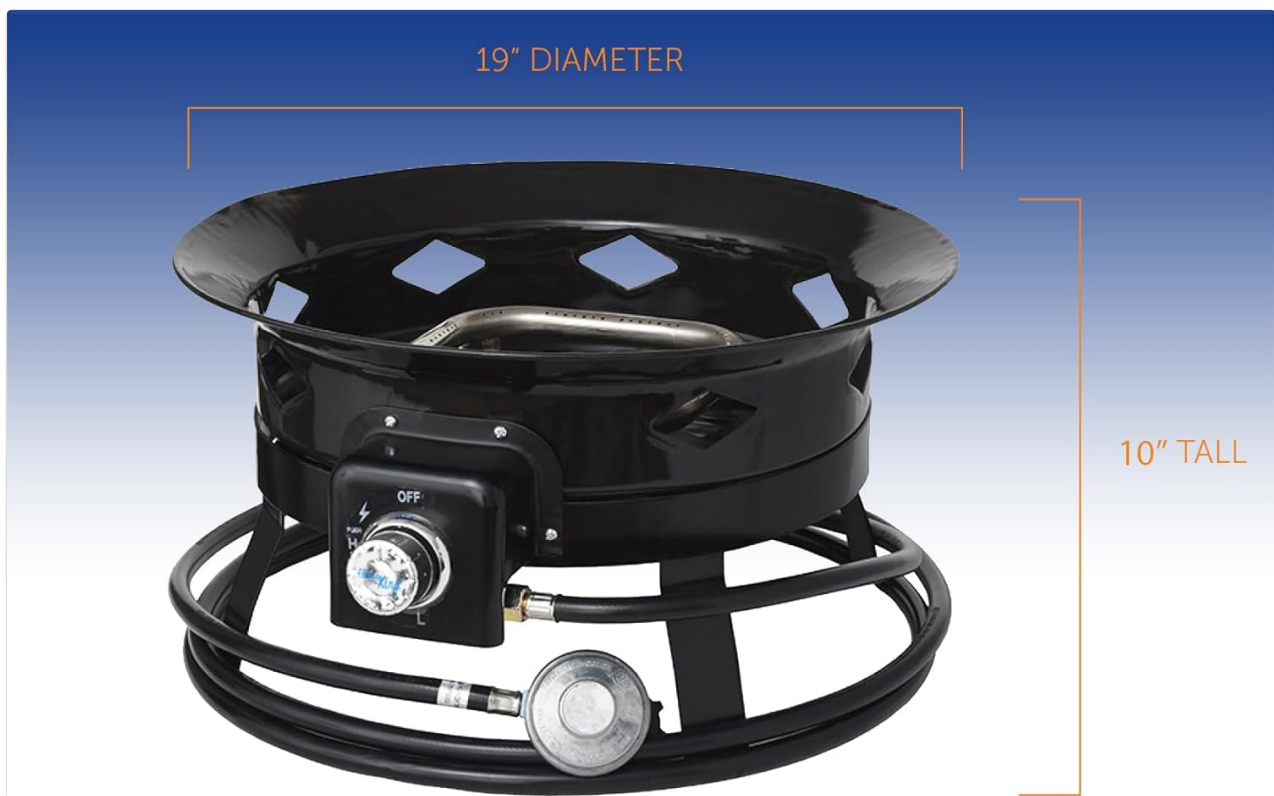
Image: A close-up of the fire pit's control knob, indicating the settings for ignition and flame adjustment.