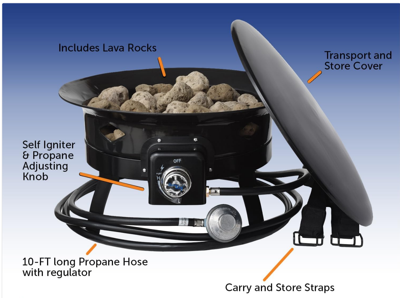
Image: The Flame King 19-inch Portable Smokeless Propane Fire Pit in operation, showcasing its compact design and vibrant flames.