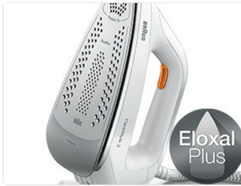
Figure 3.6: Close-up of the Eloxal Plus soleplate, known for its excellent glide and scratch resistance.