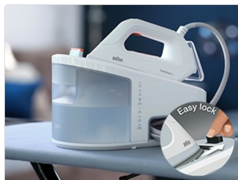
Figure 5.4: Depiction of the Easy Lock system, which securely fastens the iron to the base for safe transport and storage.