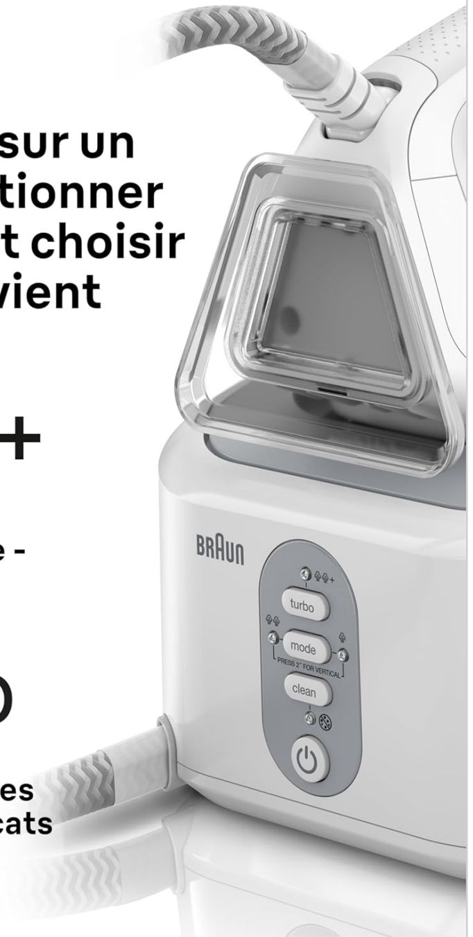
Figure 3.2: Close-up of the iMode interface on the steam generator base, illustrating the four selectable modes: Vertical Steam, Turbo (Maximum Steam), iCare (protects all fabrics), and Eco (for delicate fabrics).