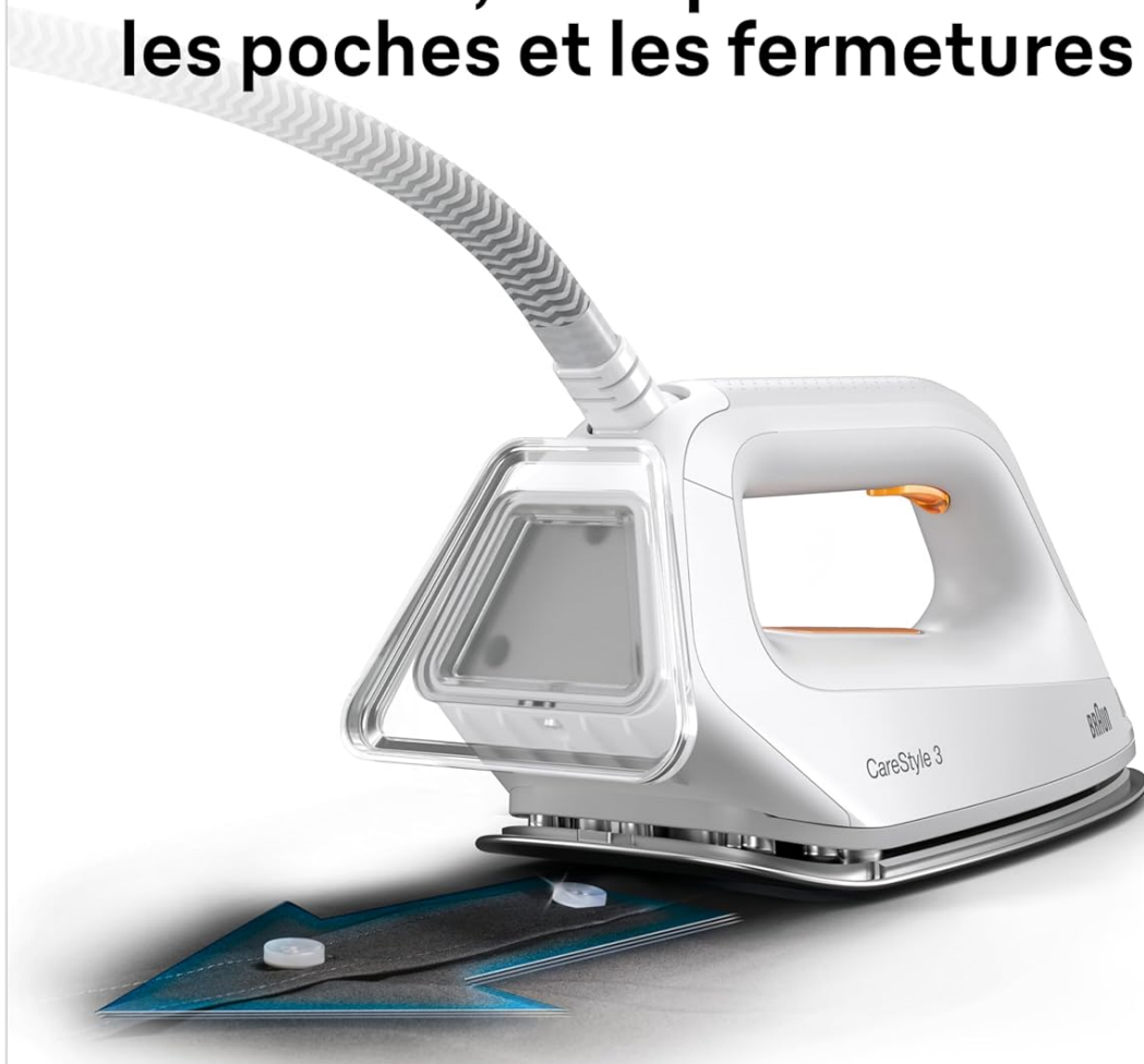
Figure 5.2: Visual representation of the FreeGlide 3D technology, showing the iron gliding effortlessly over obstacles like buttons, ensuring smooth movement in all directions.

Ne laissez rien vous ralentir. Glissez en arrière sur tous les obstacles, tels que les boutons, les poches et les fermetures éclair.