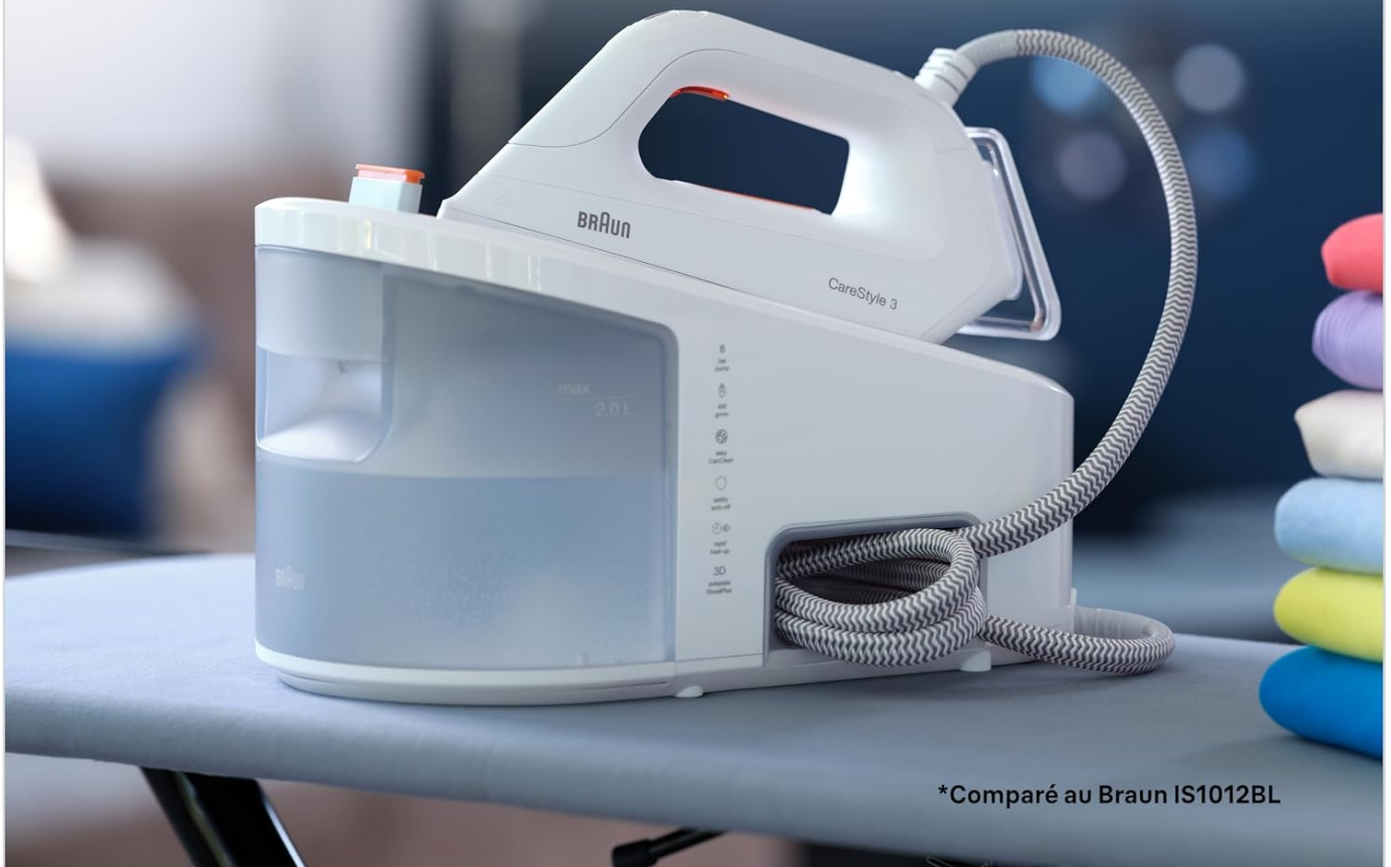
Figure 4.1: The large, removable 2-liter water tank, designed for easy refilling directly from the tap, allowing for extended ironing sessions.

Profitez des performances améliorées de la vapeur* associées à une forme compacte et un réservoir XL.