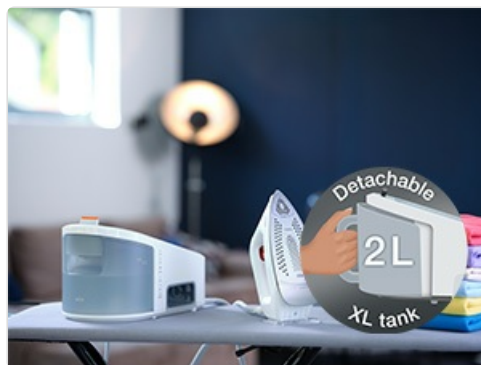
Figure 4.2: Visual demonstration of detaching the 2-liter XL water tank from the steam generator base for convenient refilling.