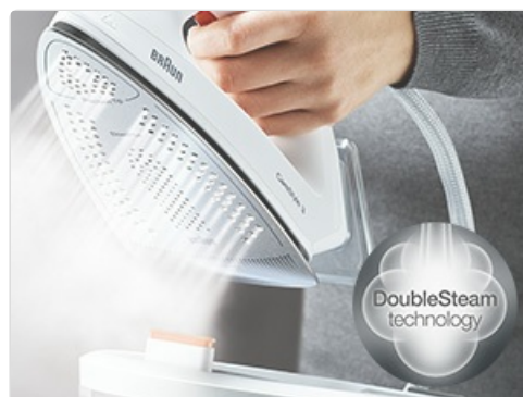
Figure 3.5: Illustration highlighting the DoubleSteam technology, indicating powerful and consistent steam output from the soleplate.