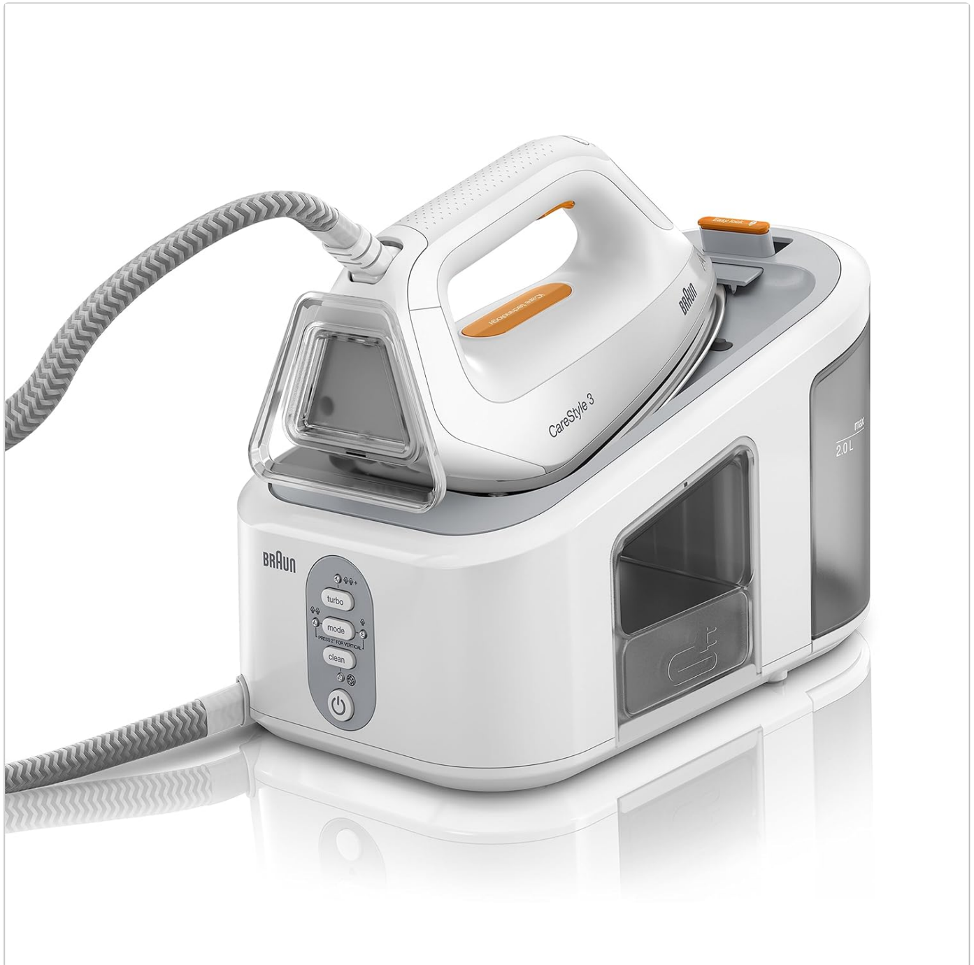
Figure 3.1: The Braun CareStyle 3 IS3132WH steam generator iron, showcasing its compact design with the iron resting securely on the base station.

Familiarize yourself with the components of your Braun CareStyle 3 IS3132WH steam generator iron.