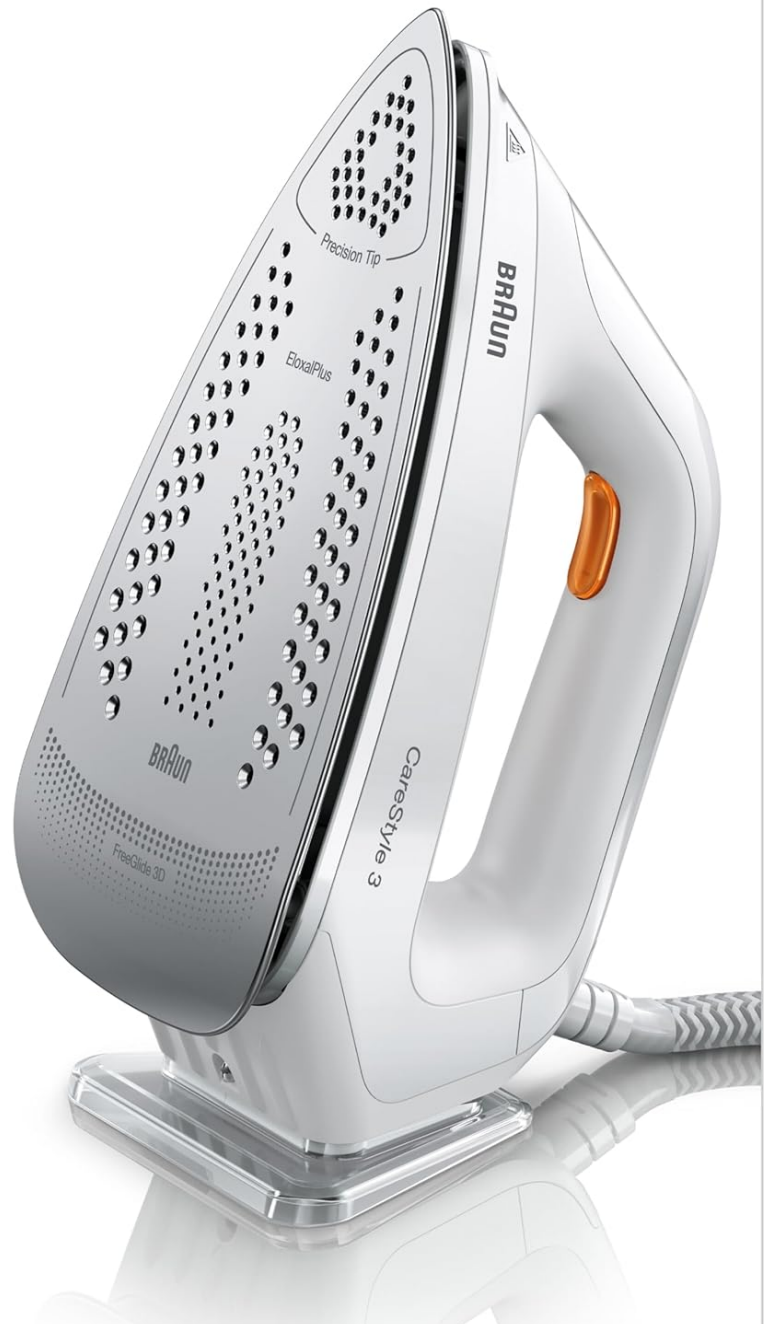
Figure 3.4: Visual representation of key specifications: 2400W power, 120 g/min continuous steam, 6 bar pressure / 400 g/min steam shot, and 1.8m cord length.