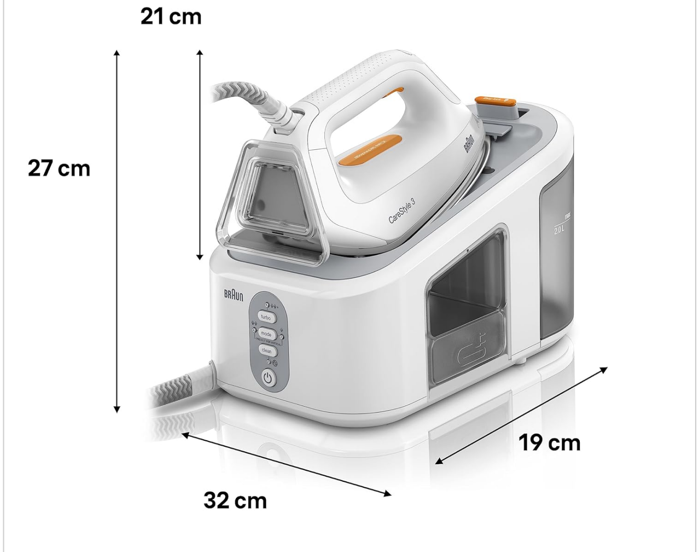
Figure 3.3: Diagram showing the approximate dimensions of the Braun CareStyle 3 steam generator iron: 32 cm length, 19 cm width, and 27 cm height (with iron on base).