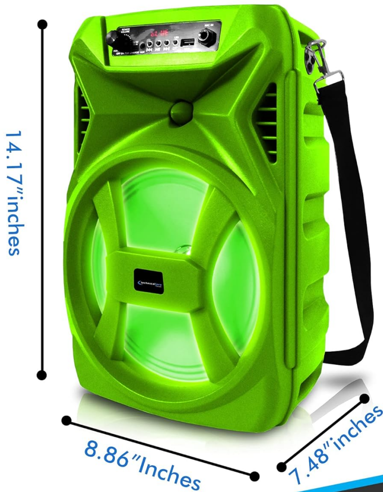
Diagram illustrating the physical dimensions of the Technical Pro SPARK8GNEON speaker, measuring 14.17 inches in height, 8.86 inches in width, and 7.48 inches in depth.