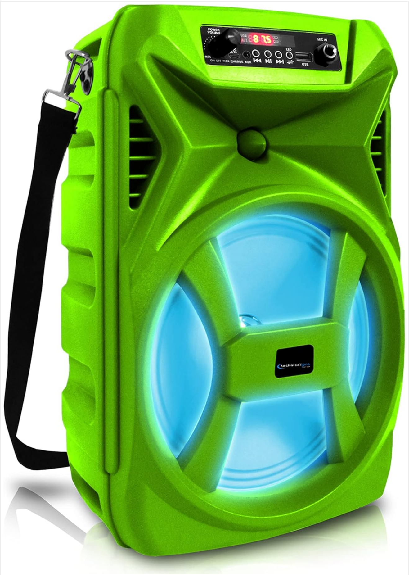
Front view of the Technical Pro SPARK8GNEON portable Bluetooth speaker, showcasing its vibrant green casing, illuminated woofer, and the top-mounted control panel.