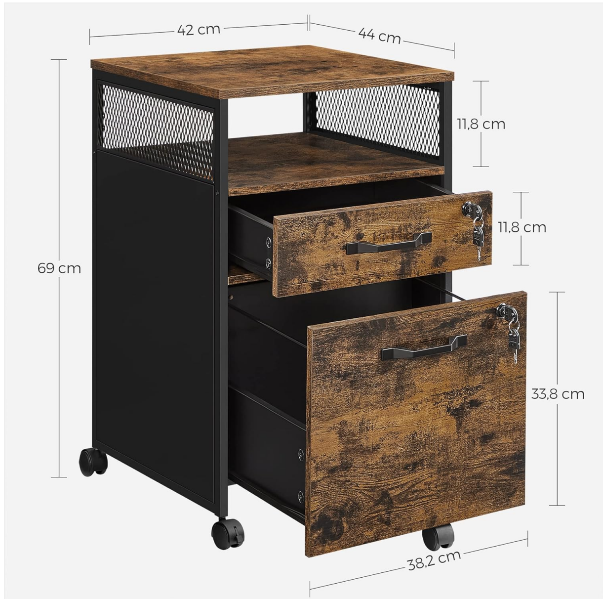
Image: A detailed diagram illustrating the dimensions of the filing cabinet, including its height (69 cm), width (44 cm), and depth (42 cm), along with drawer and shelf measurements.