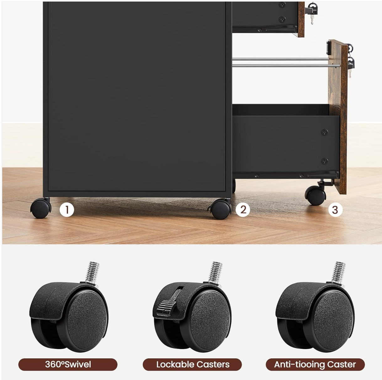
Image: A diagram detailing the three types of wheels: 360-degree swivel for easy movement, lockable casters for stability, and an anti-tipping caster for safety when drawers are open.

The cabinet is fitted with 5 wheels for easy movement. Two of these wheels are lockable to provide stability when the cabinet is in a fixed position. An anti-tipping caster is located under the bottom drawer to prevent the cabinet from tipping forward when the drawer is fully extended.