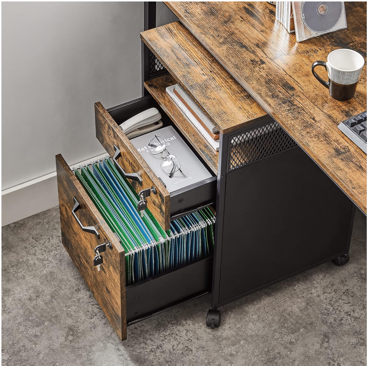
Image: The filing cabinet with its drawers open, revealing an organized interior with hanging files in the bottom drawer and various office supplies in the top drawer.