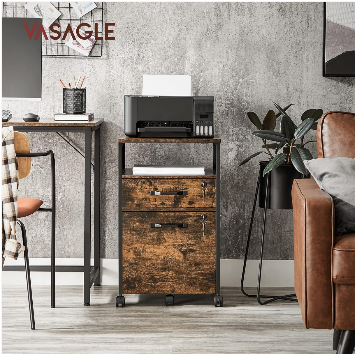
Image: The VASAGLE OFC077B01 Filing Cabinet, featuring a rustic brown and black industrial design, positioned in an office environment with a printer on its top surface.