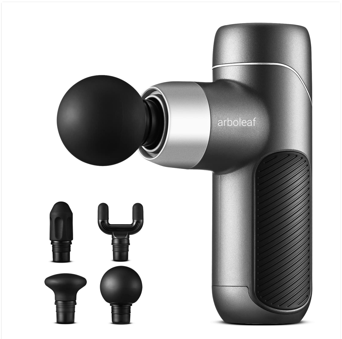
Image: Main unit of the arboleaf Mini Fascia Gun Model J2.