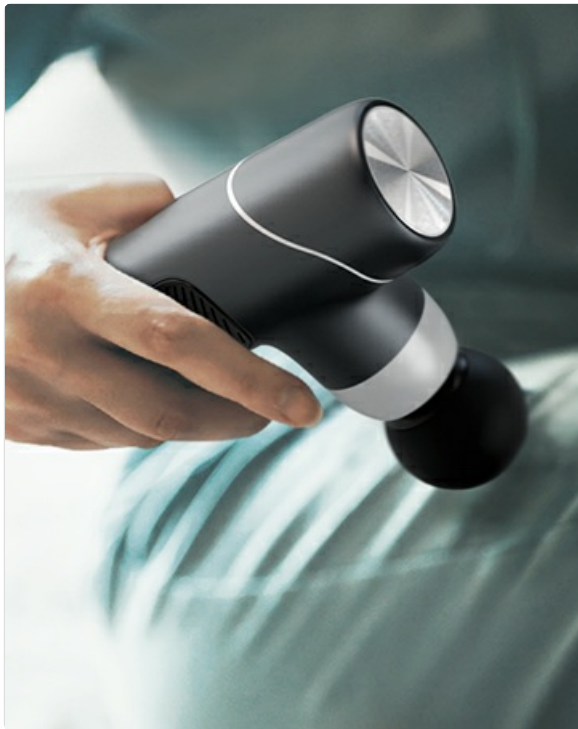
Image: Charging the arboleaf Mini Fascia Gun via Type-C port.

Your browser does not support the video tag.