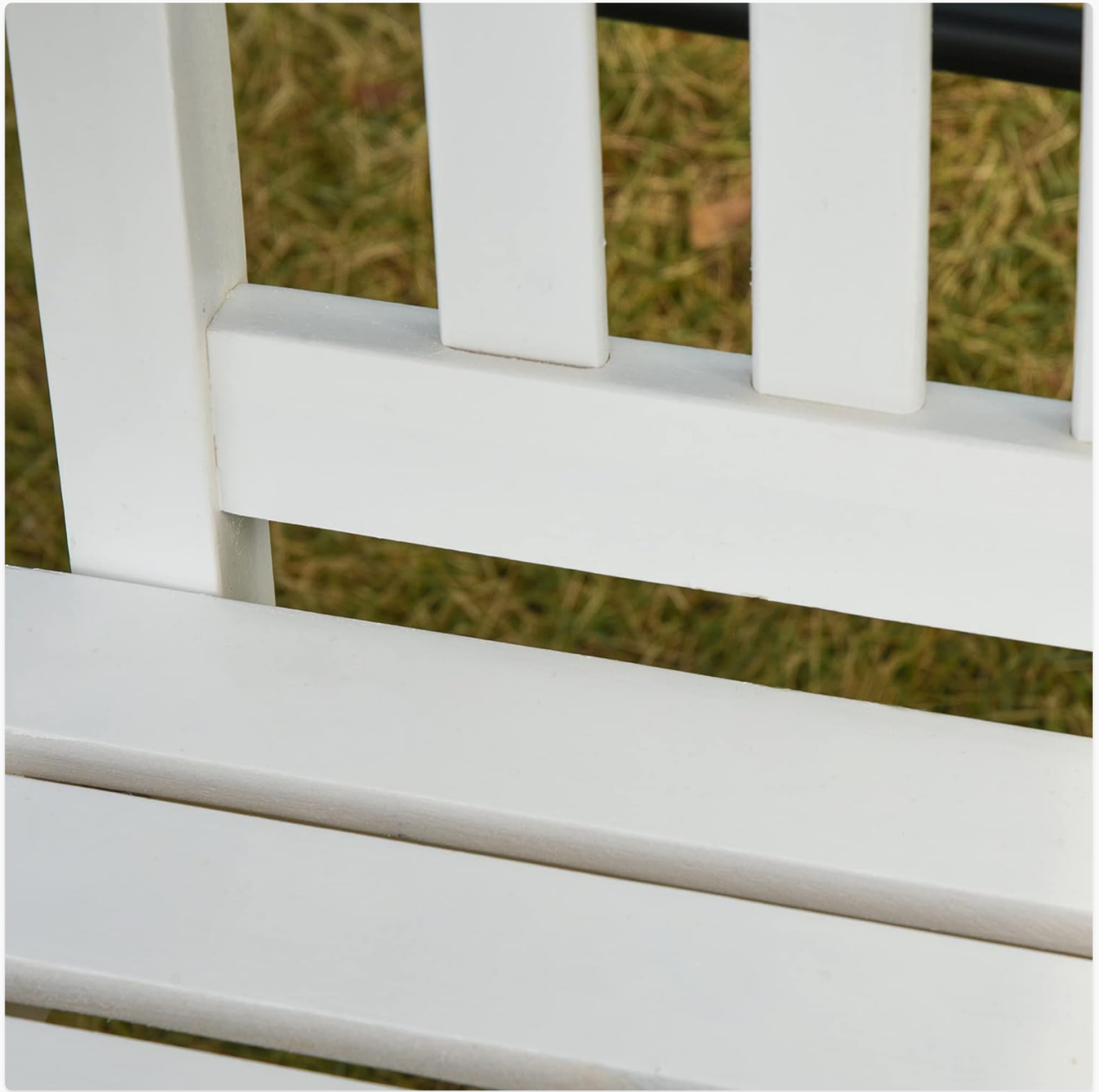
Image: A close-up view of the slatted seat and backrest design, highlighting the smooth finish.