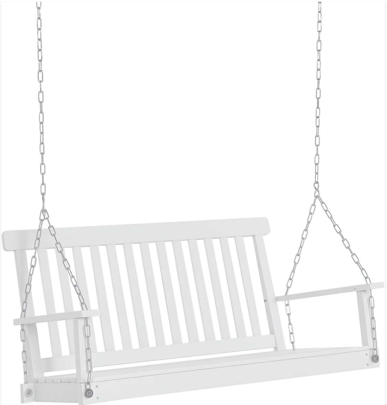
Image: The Outsunny 2-Seater Hanging Porch Swing in white, suspended by chains.