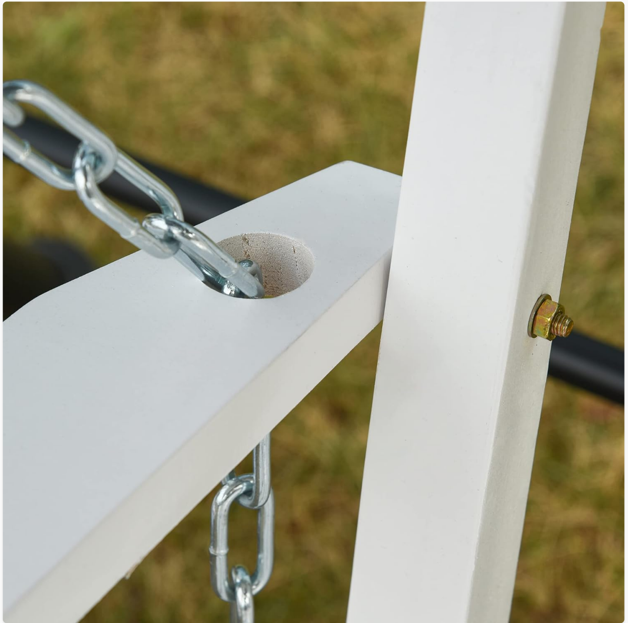
Image: A close-up view of the chain attachment point on the swing's armrest, showing the secure bolt connection.