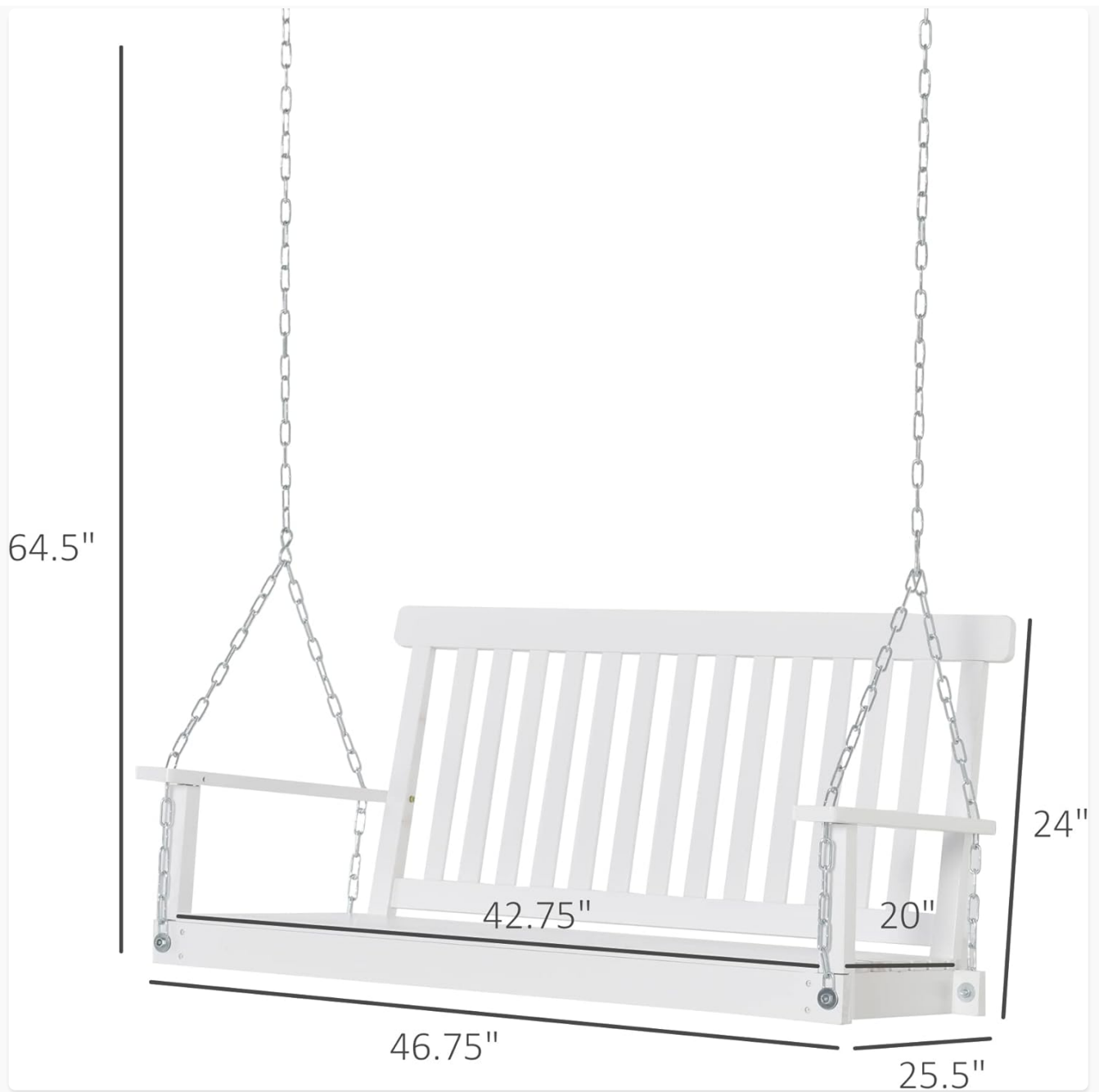
Image: A diagram illustrating the key dimensions of the Outsunny 2-Seater Hanging Porch Swing.