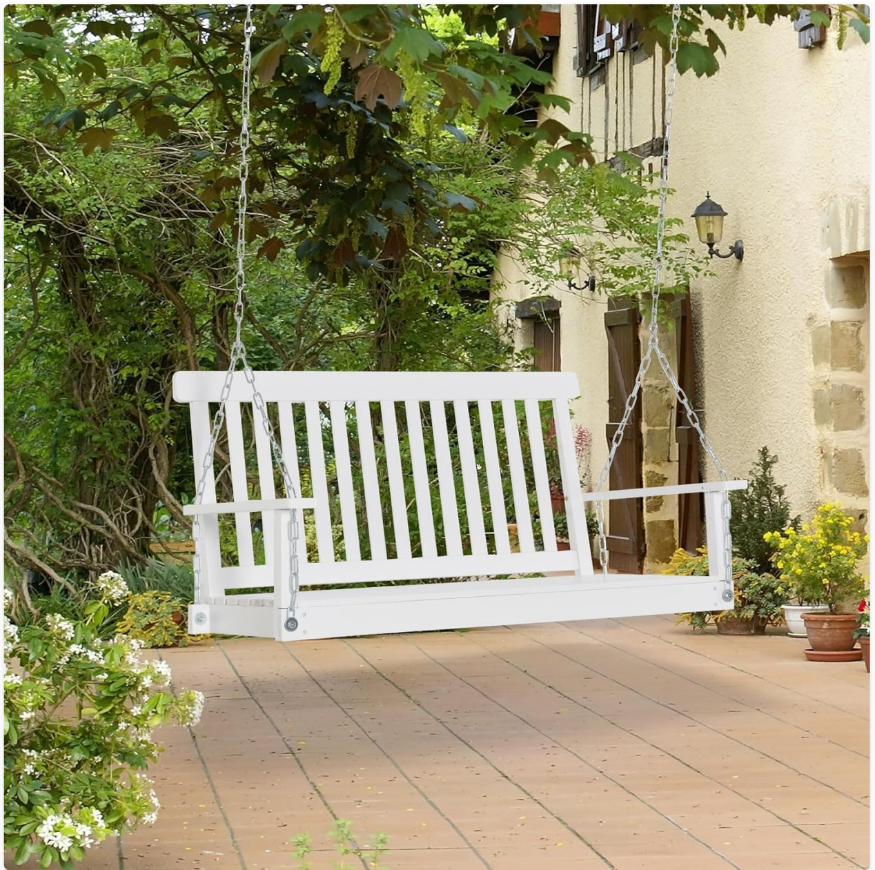
Image: The assembled porch swing positioned on a patio, demonstrating its intended use.