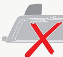
Flush Rail without Groove