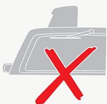
Integrated Rail Shallow Groove