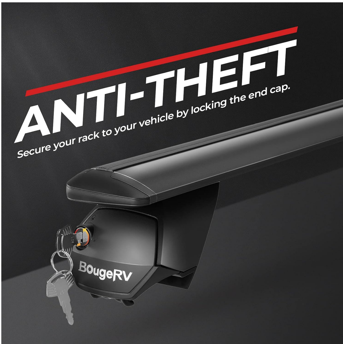
Image: Close-up of the BougeRV cross bar end cap with a key inserted into the lock, highlighting the anti-theft feature.