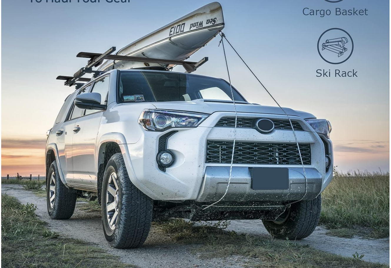
Image: A white SUV with a kayak mounted on BougeRV roof racks, illustrating the 150 lbs / 68 kg load capacity for various gear like kayaks, cargo baskets, and ski racks.