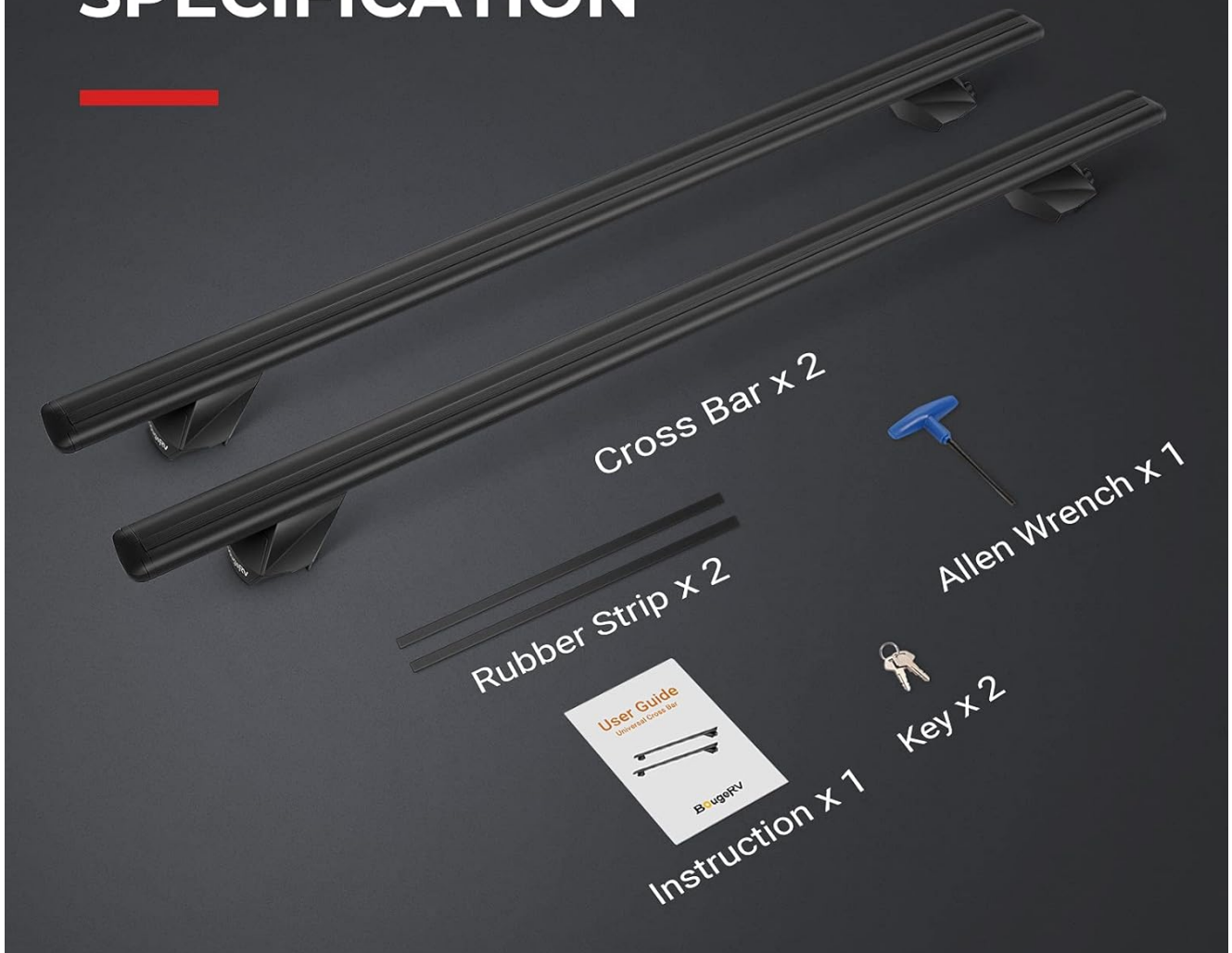
Image: Contents of the BougeRV Universal Anti-Theft Cross Bar Roof Rack package, including two cross bars, two rubber strips, one Allen wrench, and two keys.