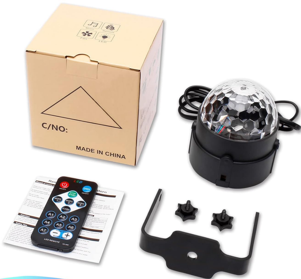
Image: Contents of the SEBRUANC Disco Ball package, showing the light, remote, mounting bracket, screws, and user manual.