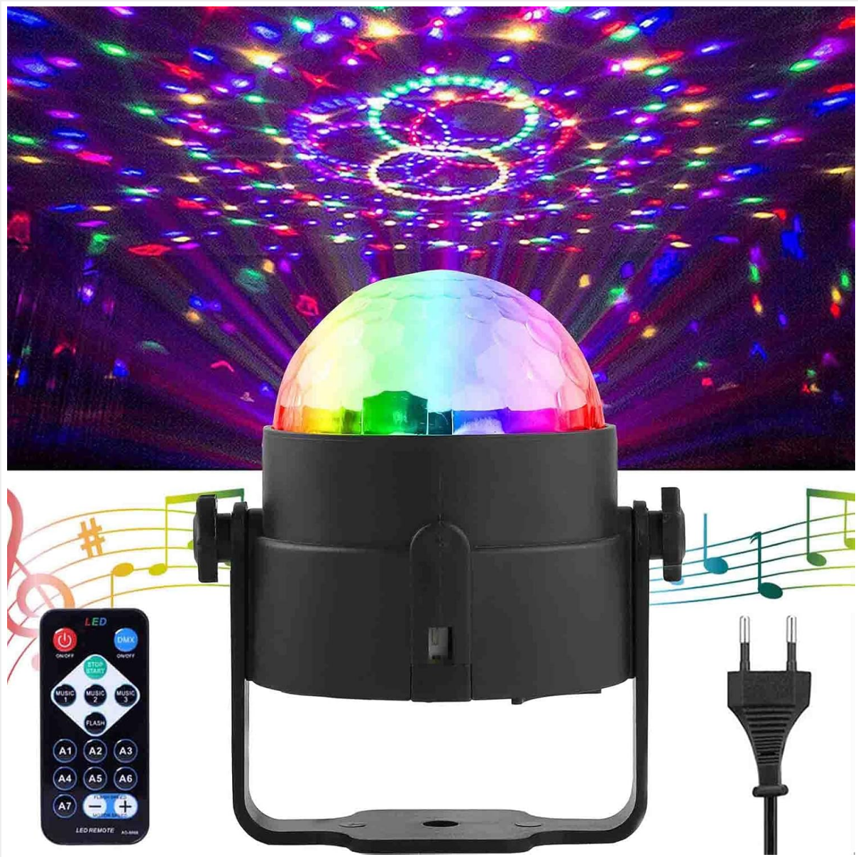
Image: The SEBRUANC Disco Ball shown with its remote control and power plug, illustrating its readiness for use.