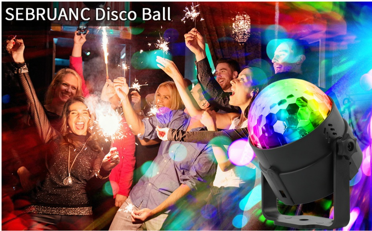
Image: A group of people enjoying a lively party atmosphere, illuminated by the colorful and dynamic lights projected by the SEBRUANC Disco Ball.

Your browser does not support the video tag.