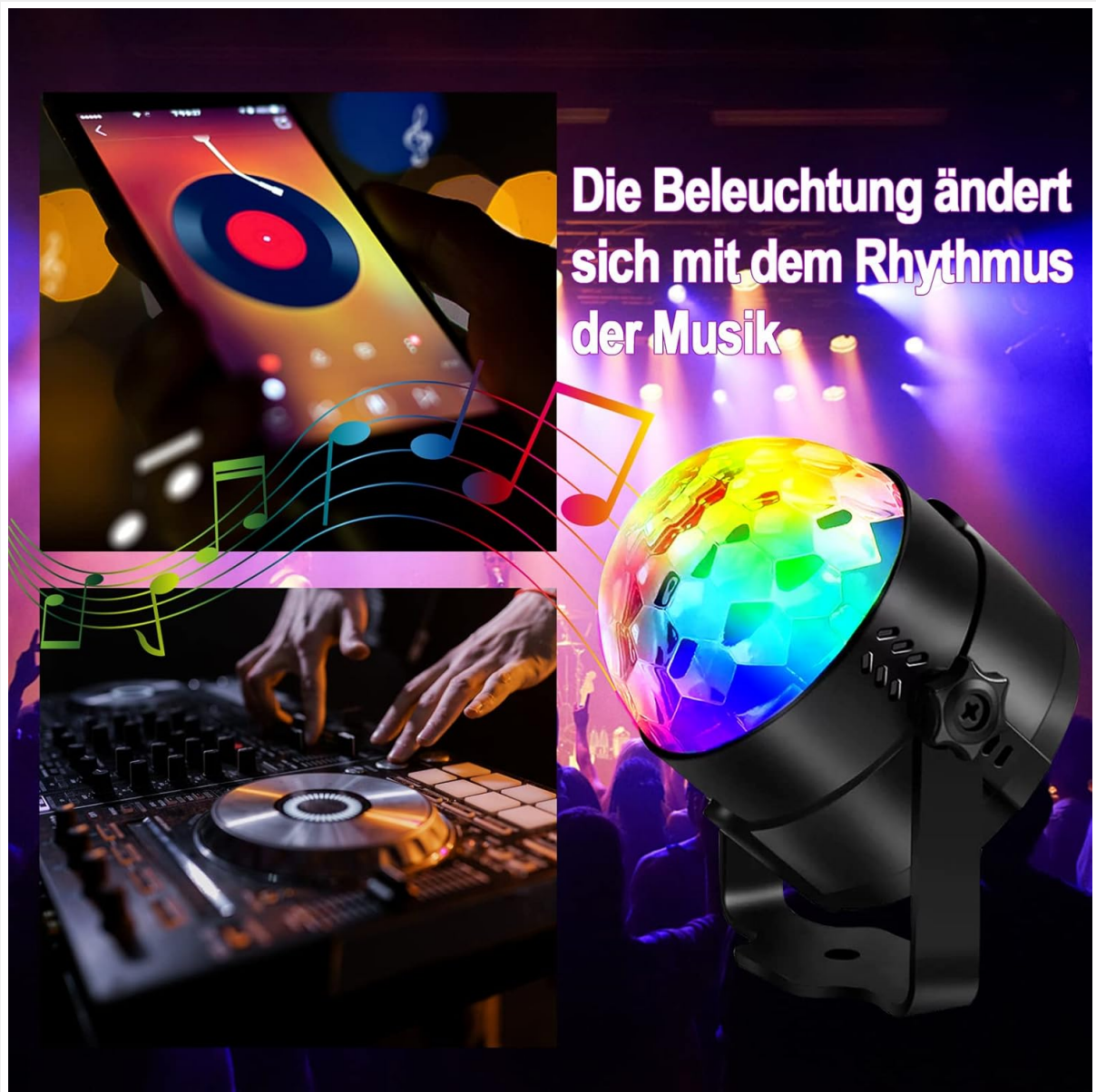
Image: The disco ball projecting lights that synchronize with music, depicted alongside a smartphone playing music and a DJ mixer, illustrating its sound-activated feature.