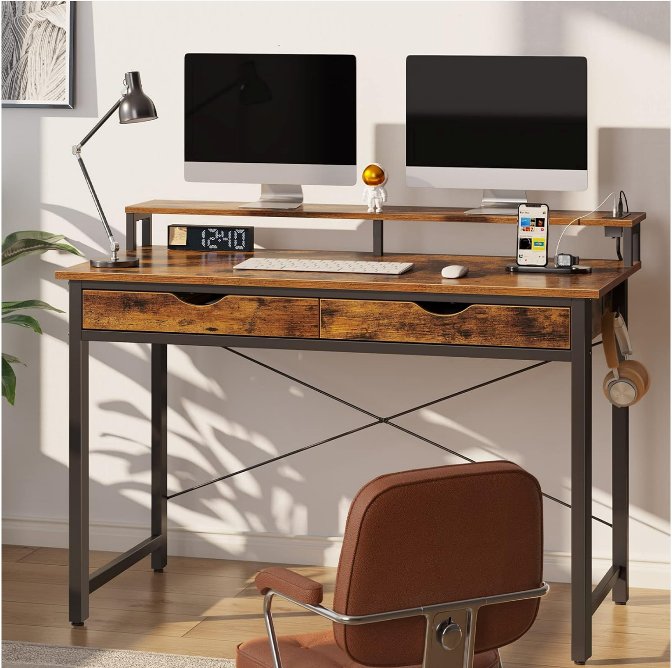
Image: Overview of the Rolanstar Computer Desk, showing the rustic brown wooden top and black metal frame.

Connect the metal frame components using the provided screws and the L-shaped Allen wrench. Do not fully tighten screws until all parts are loosely assembled.