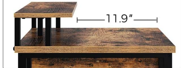
Image: Diagram showing the overall dimensions of the desk and two possible installation modes for the monitor stand, allowing for different widths.