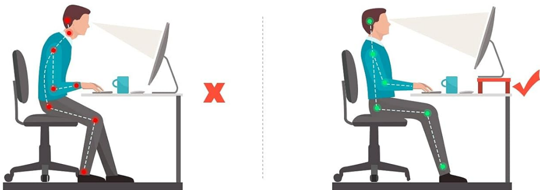
Image: An illustration demonstrating the ergonomic benefits of using the monitor stand to achieve a correct sitting posture.