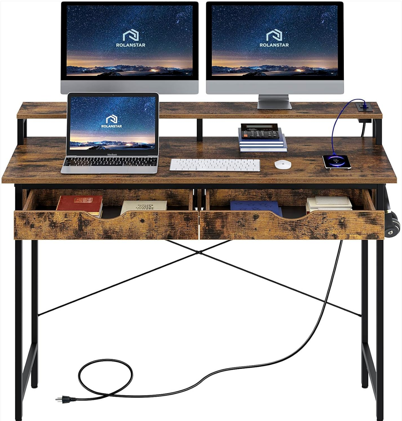
Image: The desk's power cord, approximately 6.5 feet long, shown extending from the integrated power outlet on the monitor stand.

The desk features a built-in power strip with 2 standard AC outlets (120V/12A) and 2 USB ports (5V/2A). Plug the desk's main power cord into a wall outlet. You can then plug your devices directly into the integrated outlets for convenient power access.