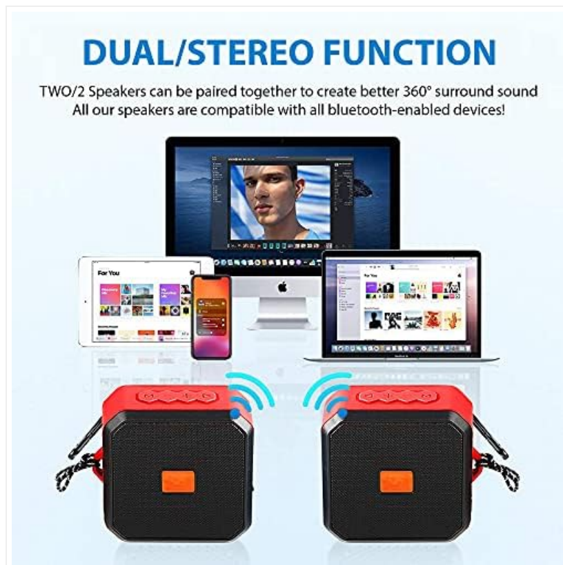
Image: Two speakers shown wirelessly connected to a computer and mobile devices, illustrating the TWS function.

You can pair two TS-1950 speakers together for a stereo sound experience.