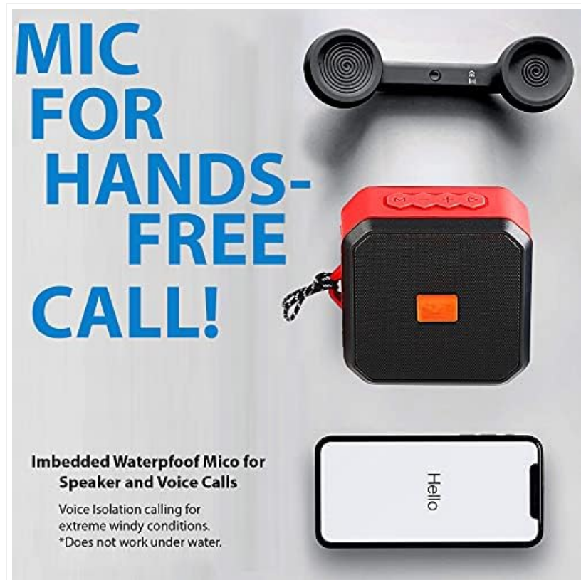
Image: The speaker positioned next to a smartphone displaying "Hello", emphasizing its built-in microphone for hands-free calls. Voice isolation for windy conditions is mentioned, with a note that it does not work underwater.