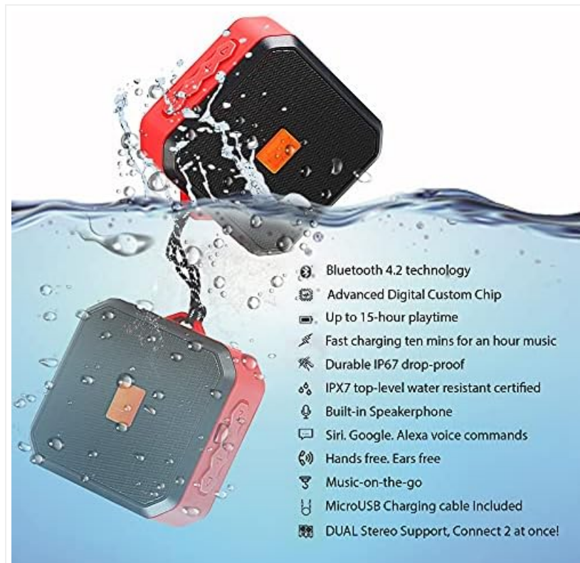
Image: The speaker partially submerged in water, visually confirming its IPX7 water resistance. Key features like Bluetooth 4.2 technology, up to 15-hour playtime, and built-in speakerphone are listed alongside.

The speaker is IPX7 rated, meaning it can be submerged in water up to 1 meter (3 feet) for up to 30 minutes. It is suitable for use in wet environments like pools, beaches, and showers. Ensure the charging port cover is securely closed before exposing the speaker to water.