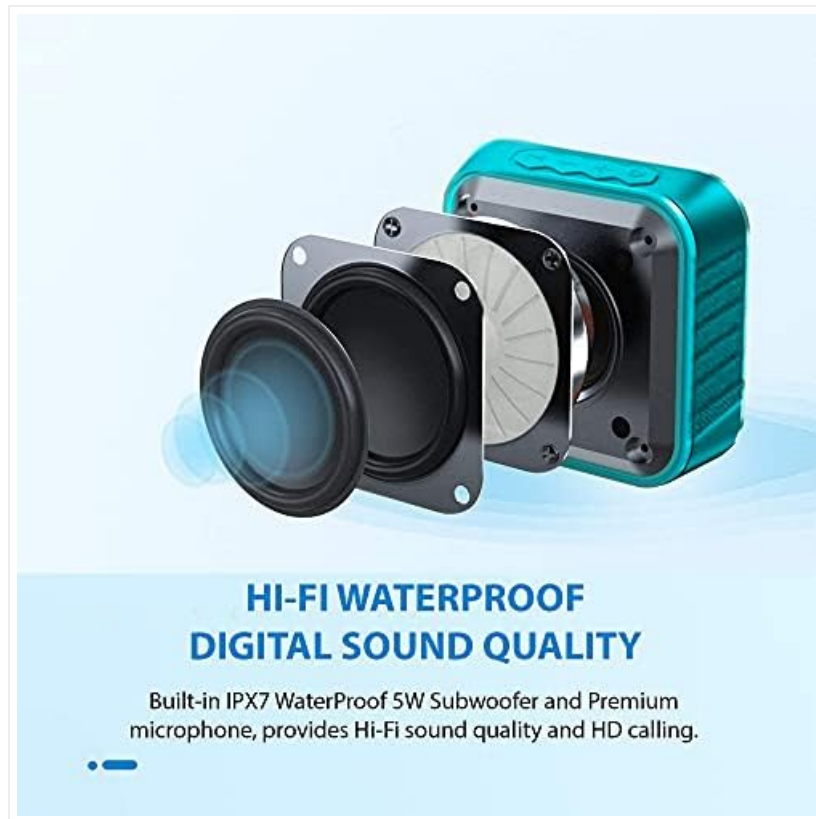
Image: An exploded view of the speaker's internal components, highlighting the built-in IPX7 waterproof 5W subwoofer and premium microphone, which contribute to Hi-Fi sound quality and HD calling.