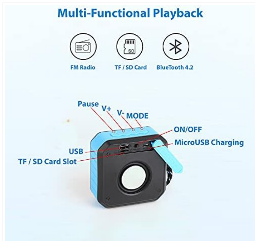
Image: Front and side view of the speaker, highlighting the control buttons (Pause, V+, V-, MODE), ON/OFF switch, MicroUSB charging port, and TF/SD card slot. Icons for FM Radio, TF/SD Card, and Bluetooth 4.2 are also visible.

Familiarize yourself with the speaker's components and controls.