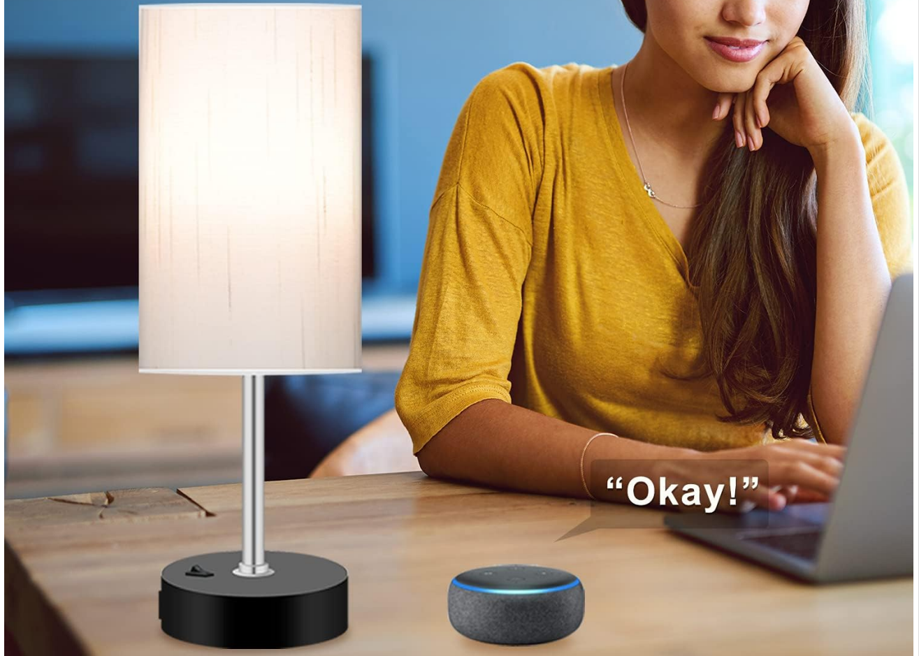
Figure 5.1: Voice Control with Alexa. This image depicts a user interacting with an Amazon Echo Dot to turn on the table lamp using a voice command, highlighting the hands-free control feature.