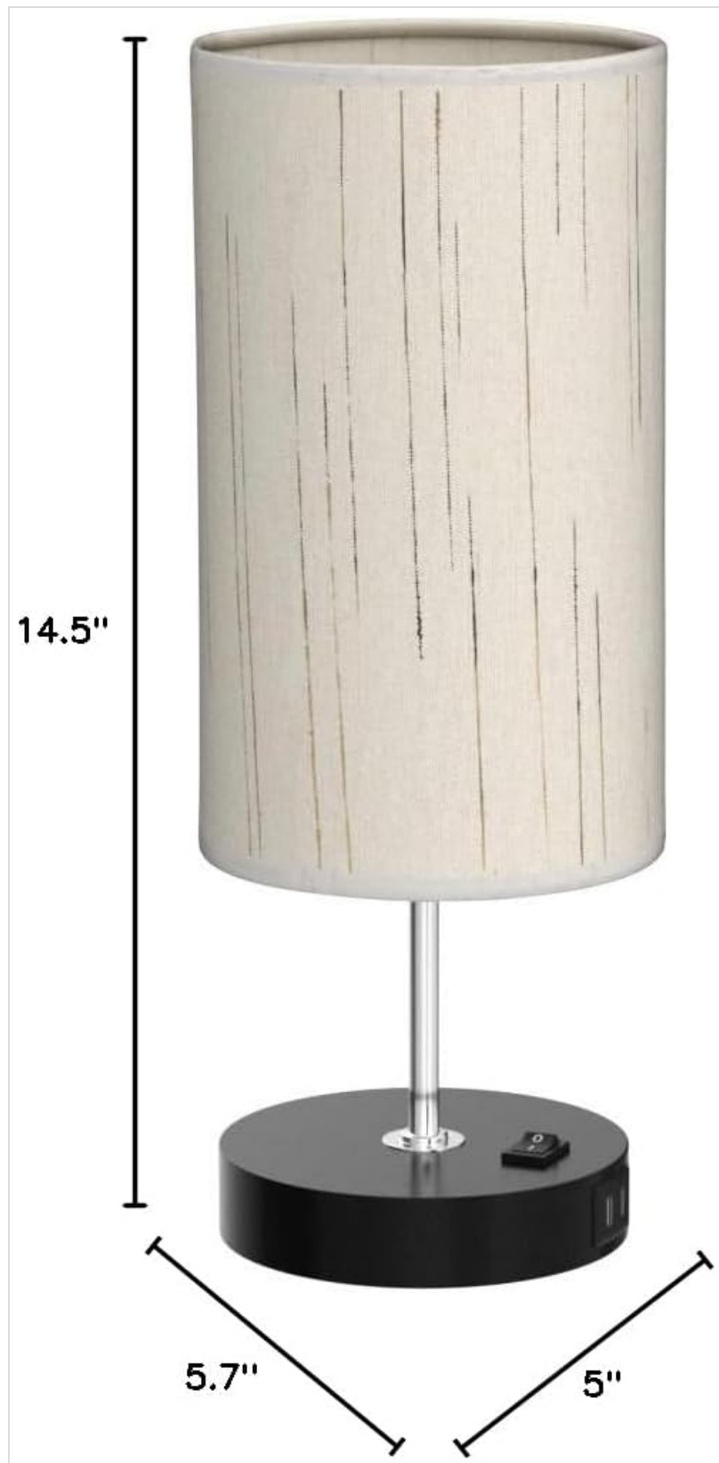
Figure 8.1: Product Dimensions. This diagram provides the key measurements of the lamp, including its height, width, and depth.