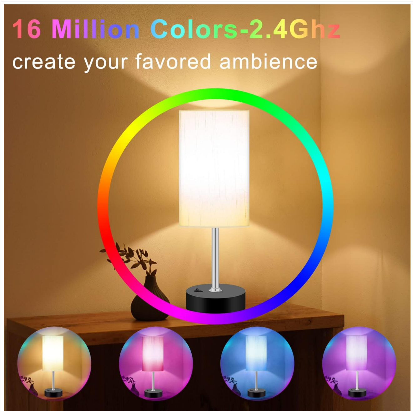
Figure 5.2: Multicolor Options. This image showcases the lamp emitting different colors, demonstrating its ability to produce 16 million colors and create various ambiances.