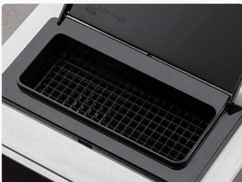
Figure 5.2: Place a paper filter in the filter grid.