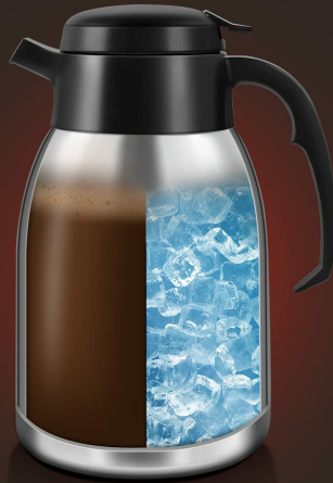
Figure 3.3: User-friendly thermal carafe with press-button pour spout and non-slip base.