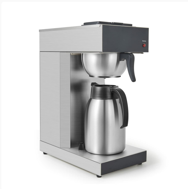
Figure 3.1: Overall view of the SYBO SF-CB-1AA Commercial 12-Cup Drip Coffee Maker.

The SYBO SF-CB-1AA coffee maker features a durable stainless steel construction and a 74 oz (12-cup) thermal carafe designed to keep your coffee hot for extended periods. Its simple, user-friendly design ensures efficient operation.