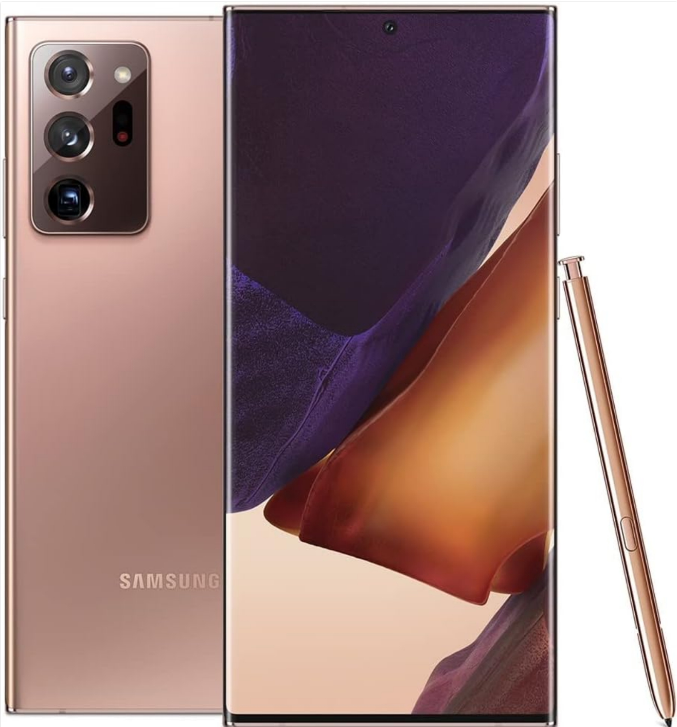
Image: Front and back view of the Samsung Galaxy Note 20 Ultra 5G, showcasing its design and the accompanying S Pen.