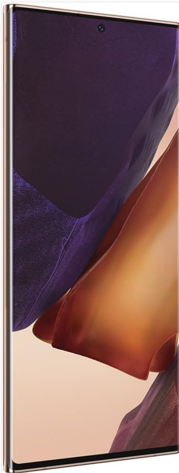
Image: Side view of the Samsung Galaxy Note 20 Ultra 5G, highlighting the location of the SIM card tray on the top edge of the device.

Use the provided SIM tray ejector tool to open the tray. Place your Nano-SIM card into the tray with the gold contacts facing down, ensuring it is correctly oriented. Gently push the tray back into the slot until it clicks into place.