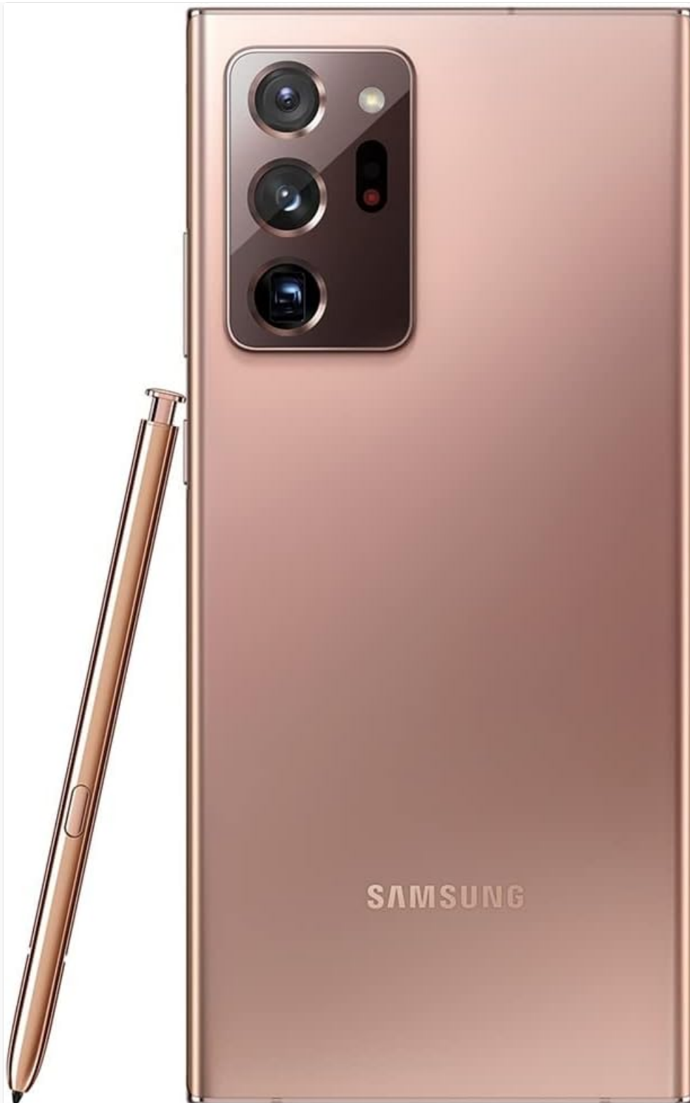
Image: Back view of the Samsung Galaxy Note 20 Ultra 5G, prominently featuring its advanced multi-lens camera module and the S Pen.