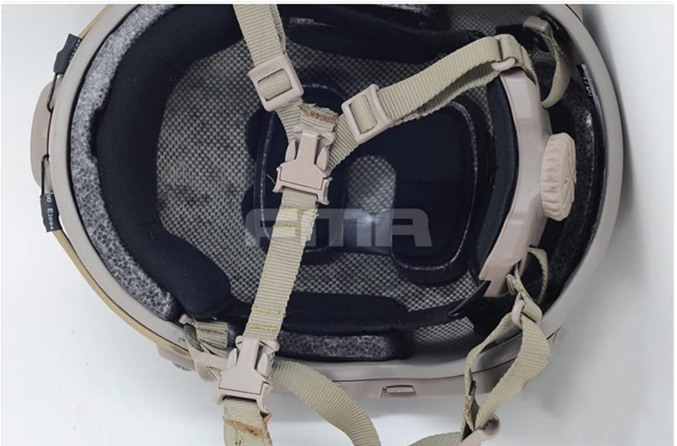
This image displays the FMA TB948 chin extender buckle strap properly installed within a helmet's suspension system,

Take one end of the FMA TB948 extender and securely click it into the corresponding buckle on your helmet's chin strap. Ensure a firm connection. Repeat for the other end of the extender, connecting it to the remaining part of your helmet's chin strap.