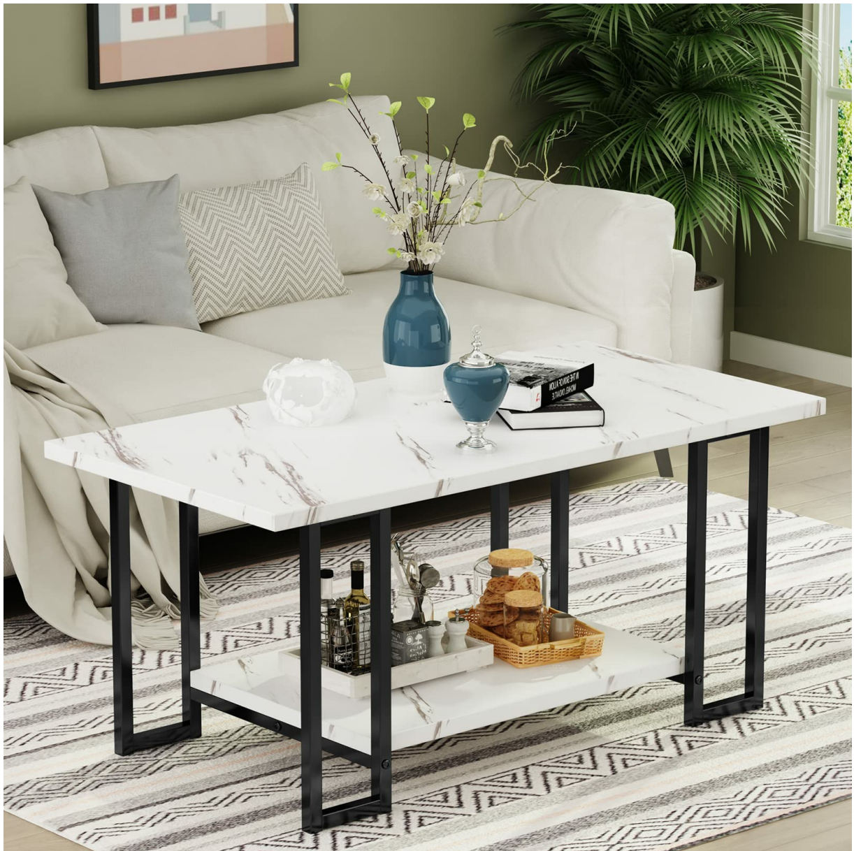
Image: The AWQM GJ08 Faux Marble 2-Tier Coffee Table, showcasing its white faux marble top and black metal frame.