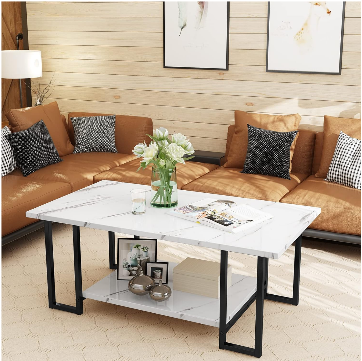
Image: The coffee table positioned in a living room, demonstrating its use for holding items and enhancing decor.