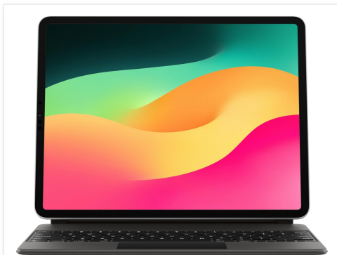
Front view of the Apple Magic Keyboard with an iPad Pro attached, showcasing the keyboard and the iPad's display.

The Magic Keyboard features a floating cantilever design, allowing for smooth angle adjustment. It includes backlit keys with a scissor mechanism for comfortable typing and a built-in trackpad supporting Multi-Touch gestures and cursor control. The keyboard connects magnetically to your iPad and provides a USB-C port for pass-through charging.