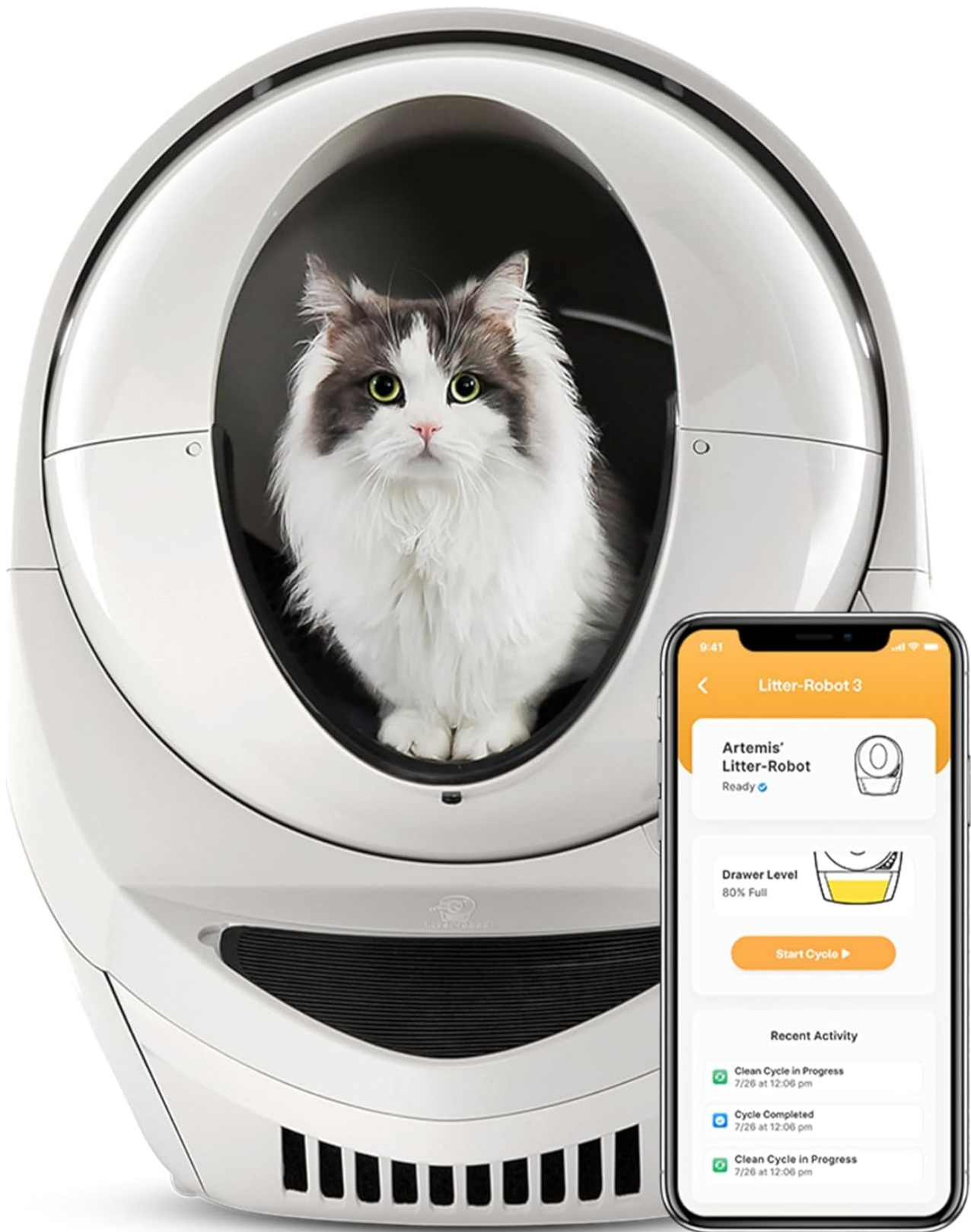
The Litter-Robot 3 Connect, ready for use with its companion app.