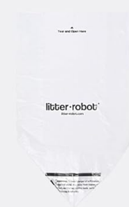
Waste Drawer Liners