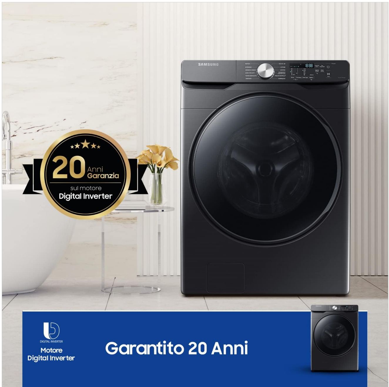
Figure 8.1: The Digital Inverter Motor is guaranteed for 20 years.