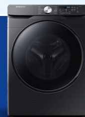
Figure 5.1: The Eco Drum Clean cycle removes detergent residue and dirt from the drum.

e le tracce di sporco all'interno del cestello.