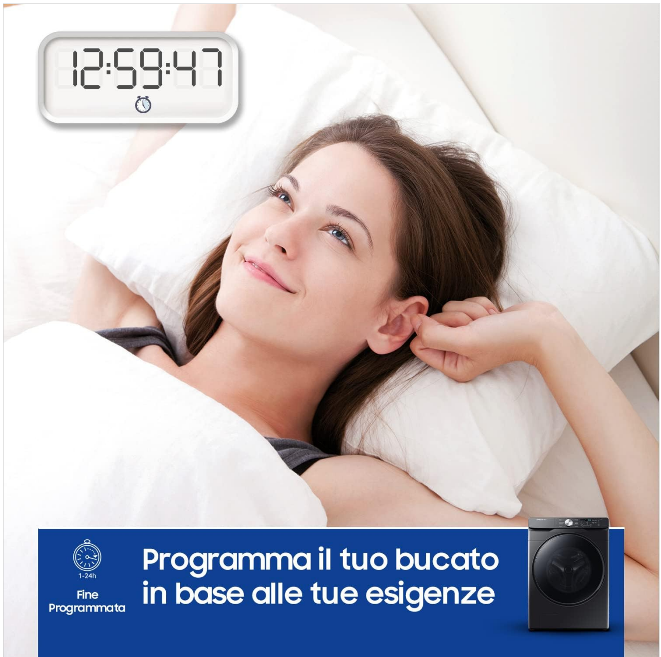
Figure 4.2: Program your wash cycle to end at a convenient time.

Use the Delayed End function to set a specific time for your wash cycle to finish, allowing you to manage your laundry more flexibly.