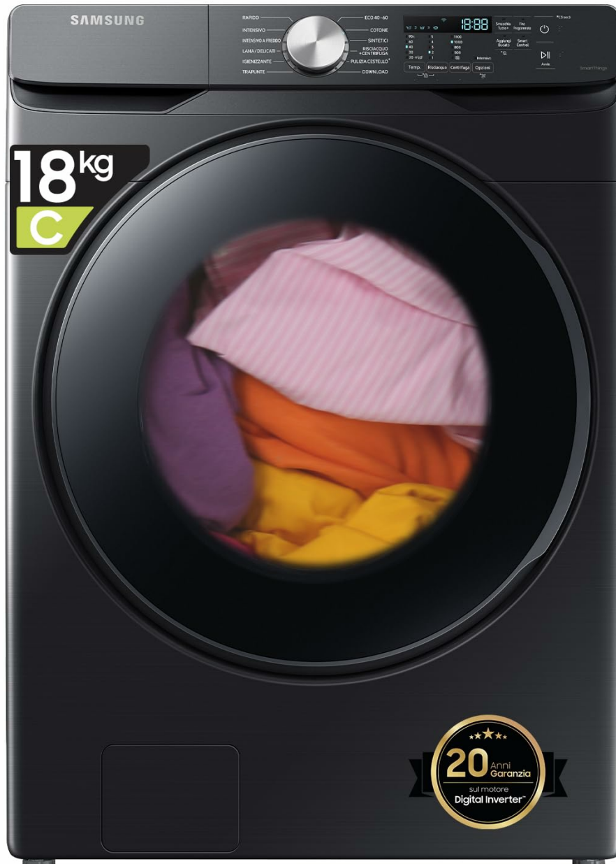
Figure 3.1: Washing machine with key dimensions (Width: 68.6 cm, Depth: 79.6 cm, Height: 98.4 cm).