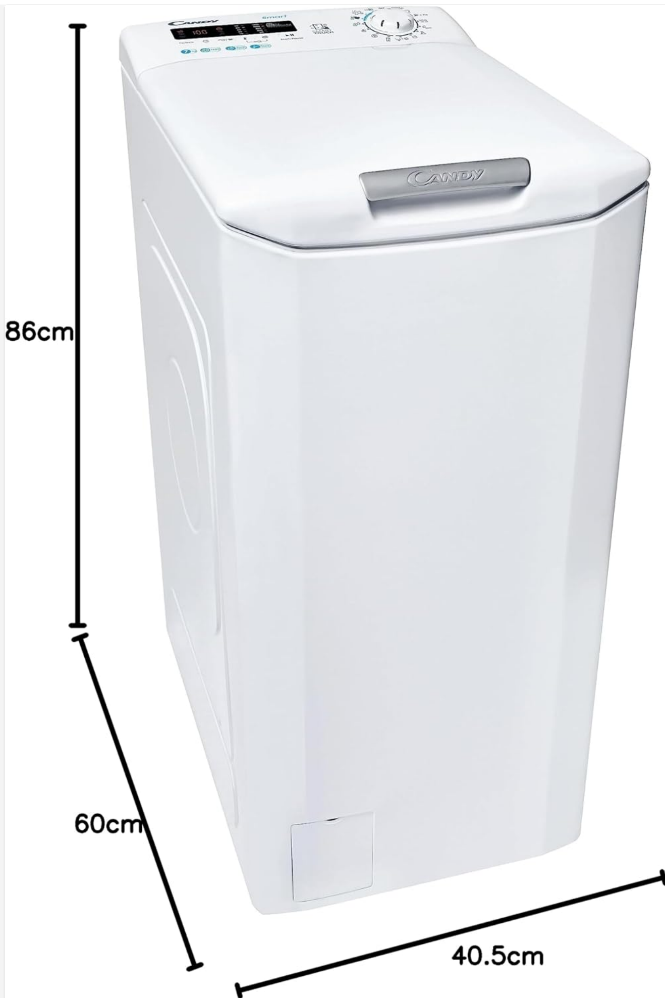
Figure 4.1: Diagram showing the dimensions of the washing machine: 86cm height, 60cm depth, and 40.5cm width. Ensure your installation space accommodates these measurements.