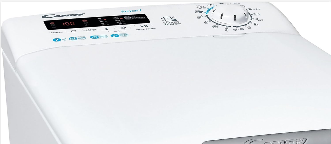
Figure 3.2: Close-up view of the control panel. It features a central program selector knob, a digital display, and various touch buttons for options like temperature, spin speed, delay start, and Smart Touch connectivity.

The control panel allows you to select wash programs, adjust settings, and monitor the washing cycle.