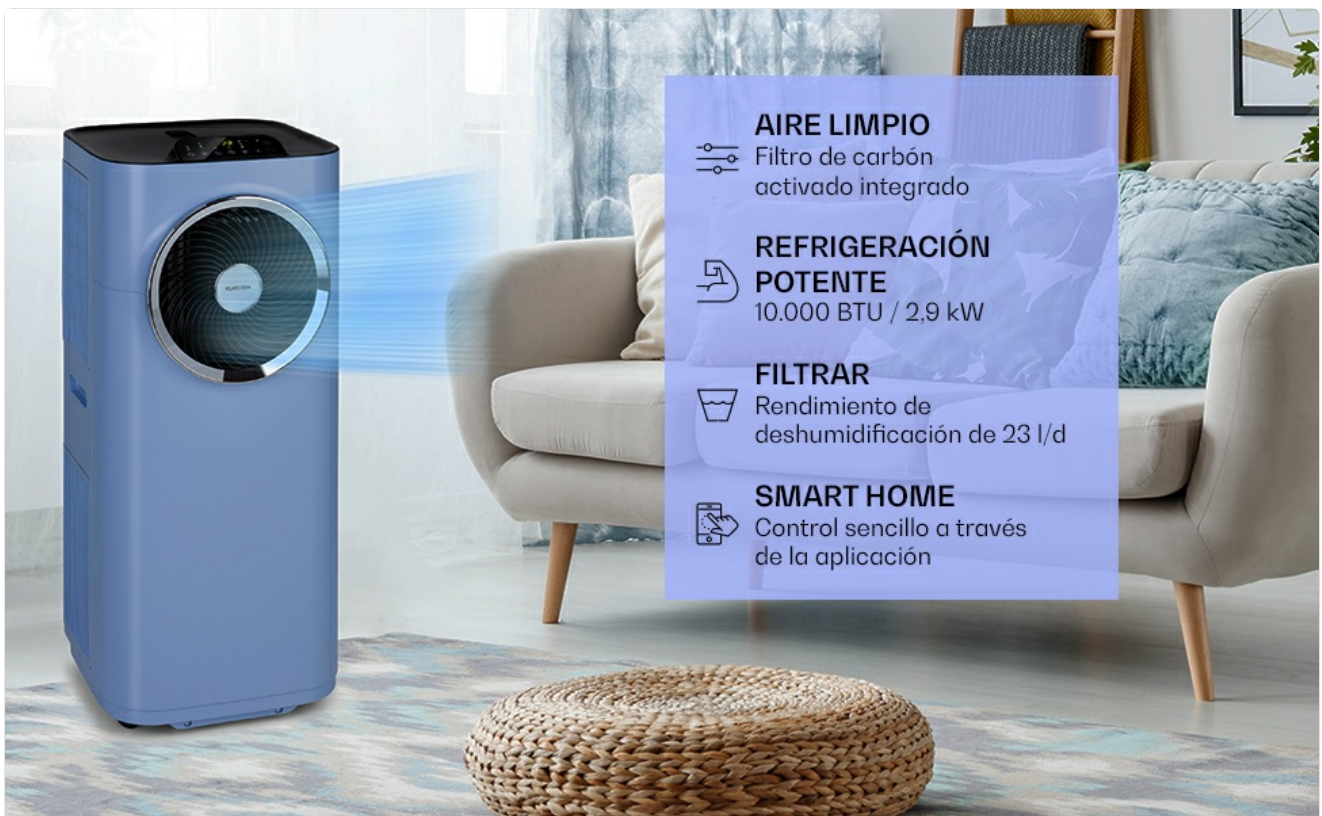
Image: The portable air conditioner with integrated wheels for easy transport.

Place the air conditioner on a flat, stable surface. Ensure there is at least 30 cm (12 inches) of space around the unit for proper airflow. The integrated castors allow for easy movement between rooms.