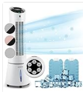
Image: Digital display and remote control for the air conditioner.

The unit can be controlled via the touch control panel on top of the unit or the included remote control. The remote control requires 2x AAA batteries (not included).